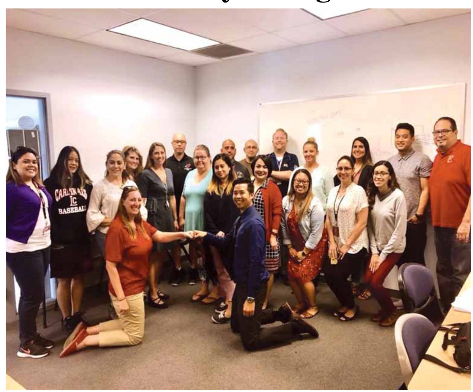
Pictured are Centinela Valley Union High School District's Digital Learning Initiative Teacher Leaders, working on their next professional learning workshop for DL1 teachers. The topic: Google forms! Free Chromebooks for all freshmen!