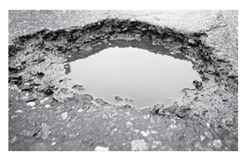
Potholes created by recent rains damage vehicles and contribute to more roadway crashes.

Torrance: Call (310) 781-6900 during business hours or email Public Works at Publicworksinfo@torranceca.gov. •