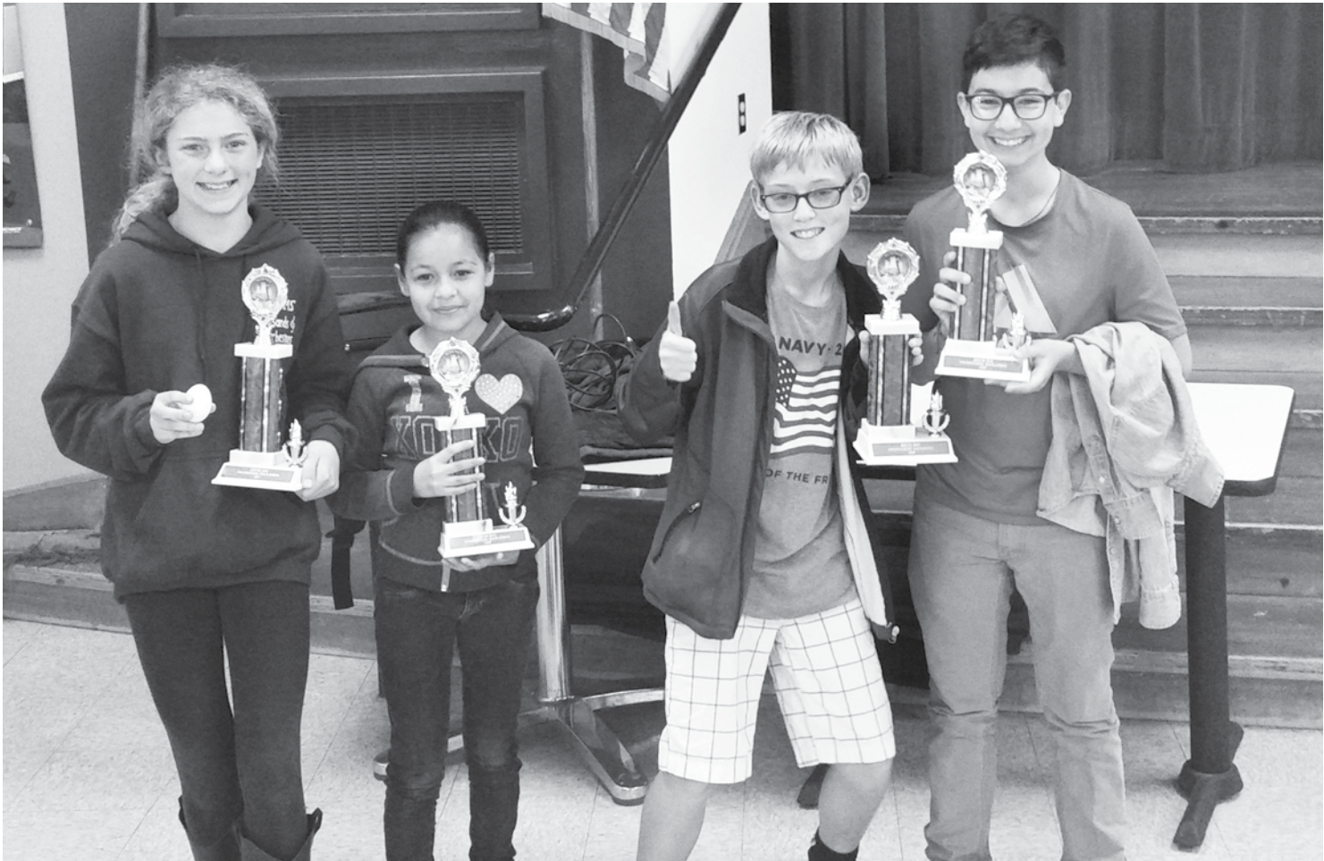
Lawndale's Will Rogers Middle School hosted the third installment of the South Bay Hackathon Series, featuring a question and answer session with a panel of engineers and an engineering challenge for students. Shown here are first place winning team with members representing all participating schools. The Hackathon connects students to local professionals to engage in applied STEM (Science, Technology, Engineering and Mathematics) activities, helps students build the necessary skillset needed to succeed in competitive college and career engineering pathways, and inspires young people to choose STEM careers.