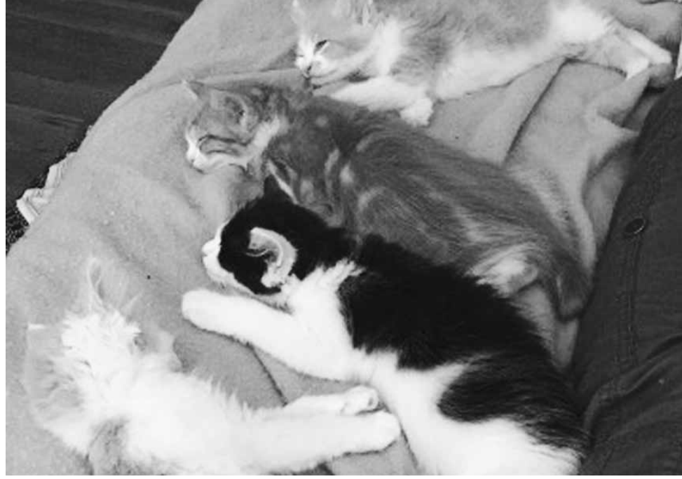
The Pastry Kittens

Baklava is an energetic boy who loves to