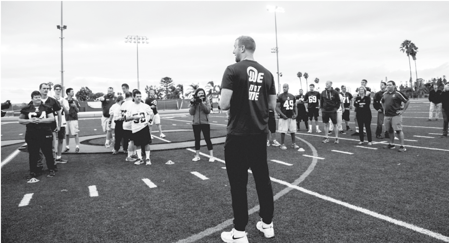
On September 14, the Los Angeles Rams and Special Olympics Southern California hosted a FUNDamentals Football Camp and Punt, Pass and Kick Challenge. The event featured 70 Special Olympics athletes and 15 coaches from Los Angeles, with a special appearance by Rams' all-pro punter Johnny Hekker (facing the group in the photo).