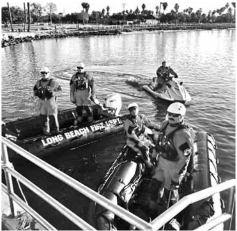
A Long Beach expo held Saturday featured disaster-readiness tips and rescue demonstrations for South Bay residents. The above photo is from last year's program, taken from the event Facebook page.