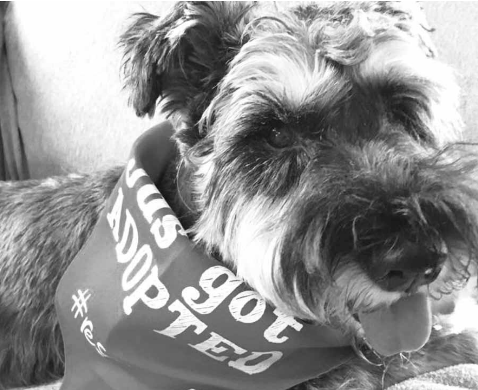
Congratulations to Jack and his new life!

Another experience where a lot of love, patience and perseverance paid off. Jack was one of our older, special needs dogs that was difficult to place. He had to have an eye removed after being hit by a car and his remaining eye required drops twice a day. At one time we thought we had found him a home, but he was returned because he took his job as protector of his family a little too seriously. His defensive nature when meeting strangers could be a bit off-putting, so we had a trainer work with him to improve his introduction manners. While adoptions didn't reveal his finer attributes, he was loving and patient with his caretakers and that is who opened their heart to Jack. Despite his issues, Jack's caregiver, who works at Yellow Brick Road, fell in love with Jack. She continued working with him and started taking Jack home at night to acquaint him with her two dogs, one of which is an MSFR alumni.