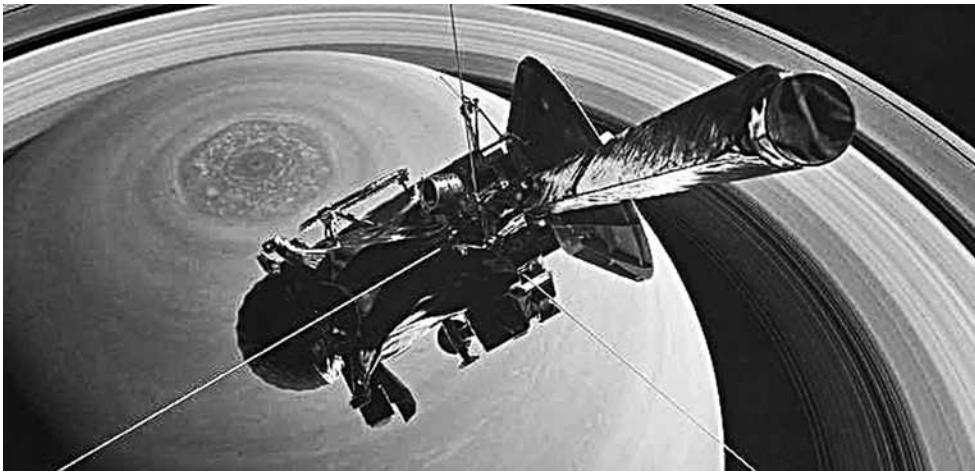
Cassini spacecraft makes its final approach to Saturn. Photo courtesy of NASA. Cassini spacecraft makes its final approach to Saturn. Photo courtesy of NASA.

The mission's final calculations predict loss of contact with the Cassini spacecraft will take place on September 15 at 4:55 a.m. PDT. Cassini will enter Saturn's atmosphere approximately one minute earlier, at an altitude of about 1,190 miles above the planet's estimated cloud tops (the altitude where the air pressure is 1-bar, equivalent to sea level on Earth). During its dive into the atmosphere, the spacecraft's speed will be approximately 70,000 miles per hour. The final plunge will