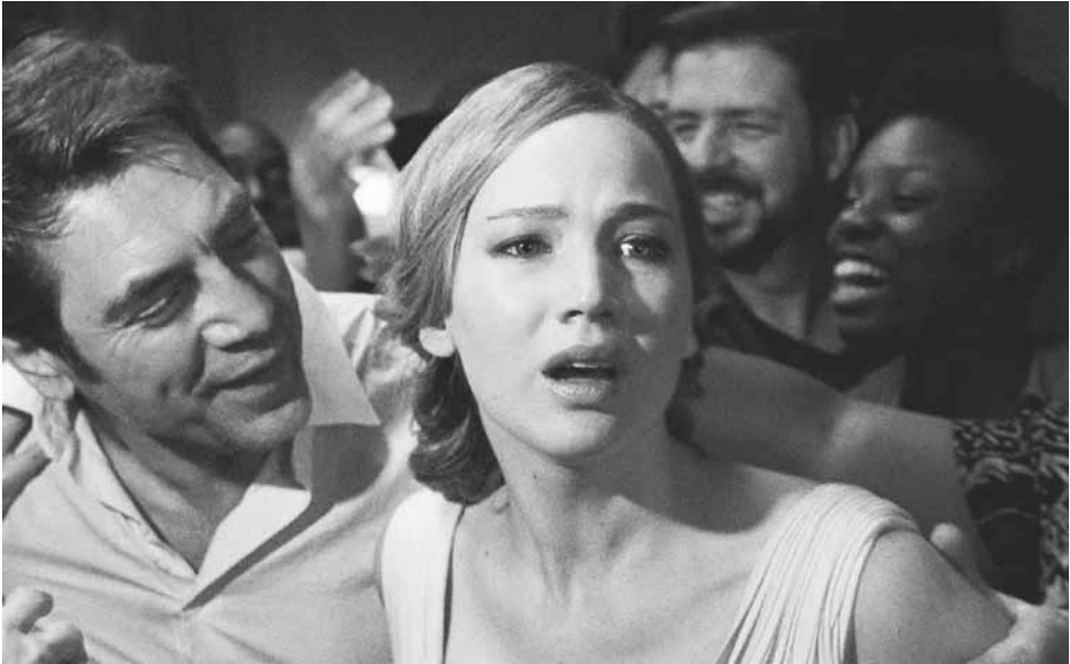
Javier Bardem and Jennifer Lawrence in "mother!"

mother! is rated R for strong disturbing violent content, some sexuality, nudity and language. 121 minutes. Now playing in theaters. •