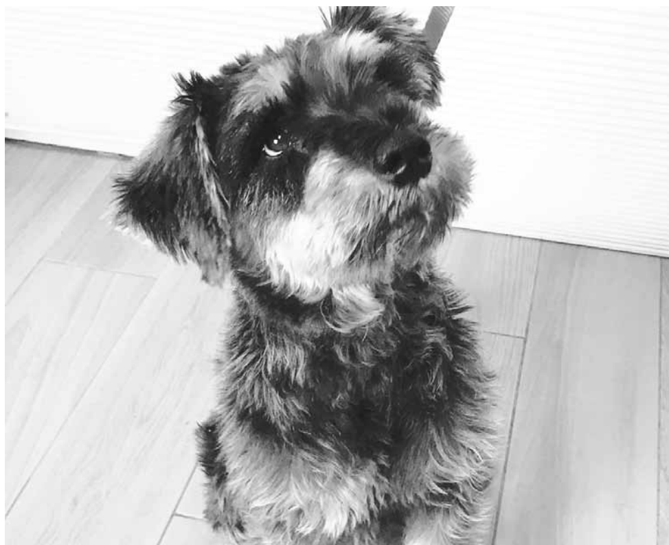
High - fives to Banjo and his new family!

Congratulations to Banjo and his new family. Banjo was our mature, mid-August rescue whose talents included some awesome "high fives." He and his new mom had an accidental meeting when she was at Yellow-Brick-Road to pick up her English Bulldog from doggie day care. Banjo caught her eye and she just couldn't resist visiting him at YBR a couple more times. Mom decided that it was finally