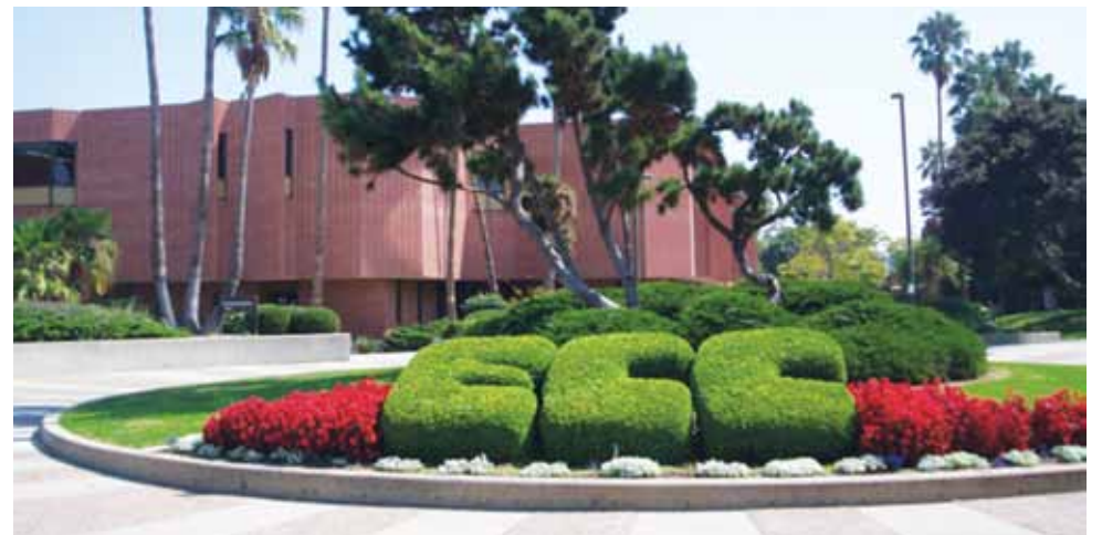
The study predicts skills El Camino graduates will need to enter the local workforce.

JP Morgan Chase sounded the alarm, too, about a middle-skill talent gap in greater Los Angeles. The financial service company predicted the L.A. County economy will grow by 12 percent in the next decade. That expansion is expected to create one million middle-skill jobs paying close to $30 per hour. Healthcare is expected to be the top job creator, along with global trade and logistics being so close to the Port of Los Angeles and LAX. •