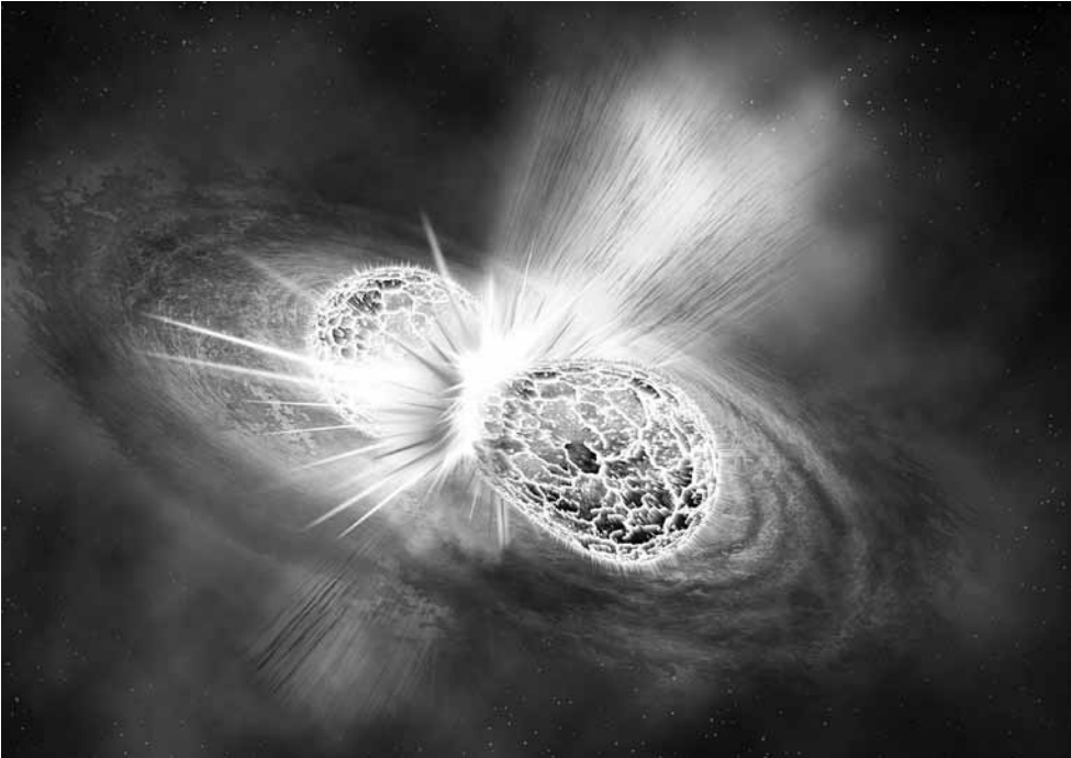
Neutron merger.