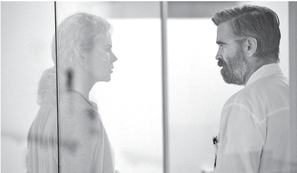
Nicole Kidman and Colin Farrell in The Killing of a Sacred Deer.

The Killing of a Sacred Deer is rated R for disturbing violent and sexual content, some graphic nudity and language. 116 minutes. Now playing at the ArcLight Hollywood and The Landmark. •