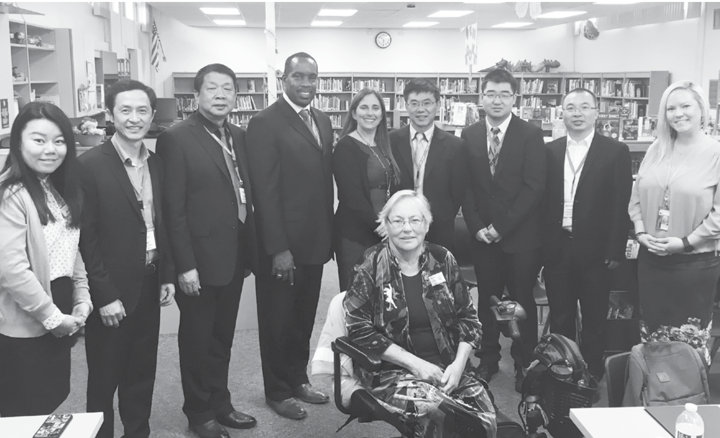
On November 9, Lawndale Elementary School District (LESD) had the honor of hosting Chinese principals from the Jiangsu Provincial Department of Education as part of a larger international cultural collaboration with the theme Curriculum Development and School Culture. The photo shows the group at Will Rogers Middle School. They also visited Jane Addams Middle School. The guests enjoyed a comprehensive overview of the campuses and got a first-hand look at the excellent educational programs offered at each school.