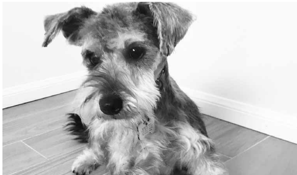
A black and white close-up photograph of a small, scruffy dog, possibly a Shih Tzu or Lhasa Apso, looking directly at the camera. The dog has dark, expressive eyes, a dark nose, and floppy ears. Its fur is light-colored and appears somewhat unkempt or scruffy. The background is a light-colored, possibly tiled floor.

“They call me Roz ...and at 16 pounds, I’m considered the ‘big’ sister. I’m an eight-month-old female Miniature Schnauzer mix who was rescued from an LA County shelter with my brother. We had been living on the streets and looking for food when a really nice person saw us and started feeding us. After about a week it was decided that this is not the way young pups should be living. It became clear that we needed a loving family and it wasn’t very safe being alone on the streets. That’s how we ended up at the shelter as strays until we were