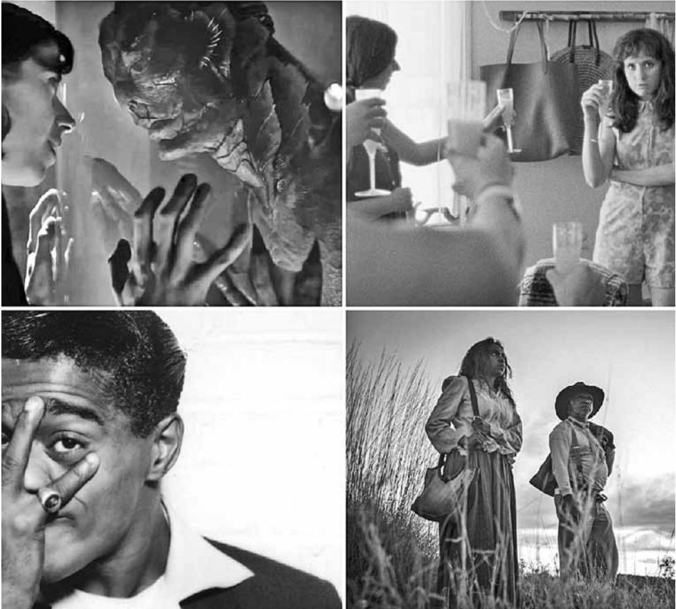
(L-R) The Shape of Water , Mr. Roosevelt , Sweet Country , Sammy Davis, Jr.: I've Gotta Be Me