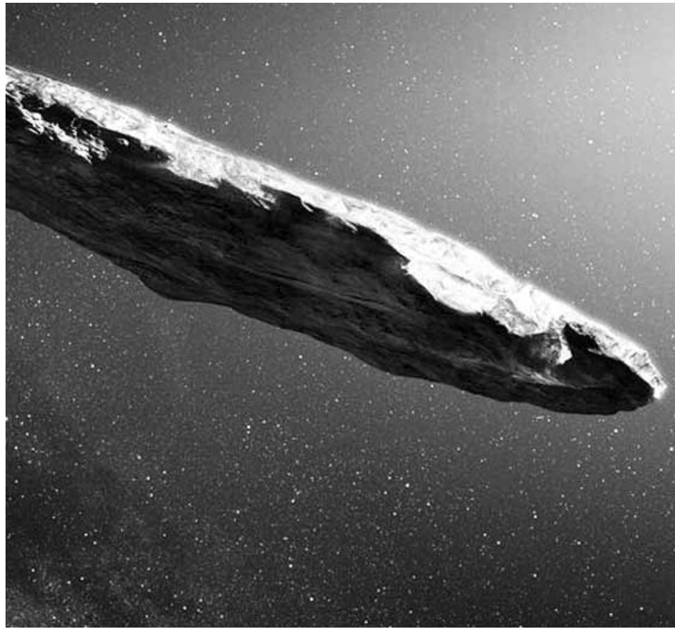
Artist's concept of interstellar asteroid 1I/2017 U1 ('Oumuamua) as it passed through the solar system after its discovery in October 2017. The aspect ratio of up to 10:1 is unlike that of any object seen in our own solar system.

Combining the images from the ESO telescope with those of other large telescopes, a team of astronomers led by Karen Meech of the Institute for Astronomy in Hawaii found that 'Oumuamua varies in brightness by a factor of 10 as it spins on its axis every 7.3