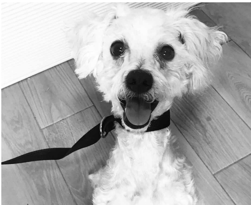
With help from our friends at Yellow Brick Road, Glory has found a new home and family. Goodness all around!