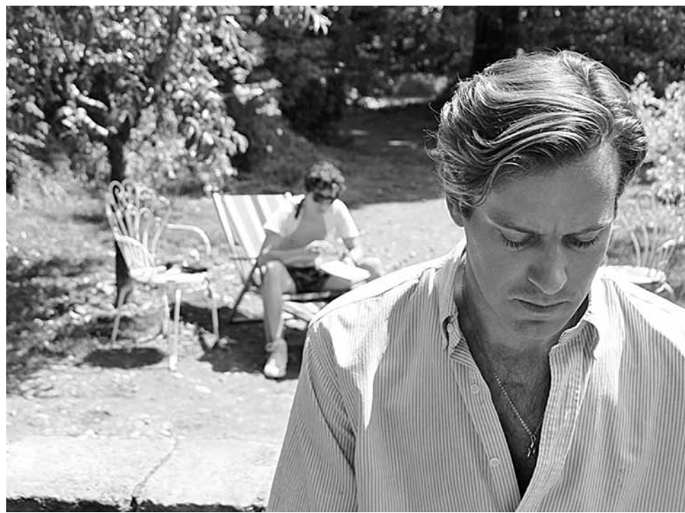
Timothée Chalamet and Armie Hammer in Call Me By Your Name.

Based on the 2007 novel from André Aciman of the same name, Call Me By Your Name was quickly regarded as a modern classic on first love. Although mainly celebrated in the LGBTQ community for its subject matter, it has since been embraced universally for its portrayal of the joy and heartache that comes from first love that transcends gender or sexuality. The film has also been nominated for six Independent Spirit Awards, including Best Feature, Best Actor and Best Supporting Actor—and if that is any indication, there will likely be many awards tied to this film in the months to come. Call Me By Your Name is rated R for sexual content, nudity and some language. 132 minutes. Now playing at ArcLight Hollywood and The Landmark. •