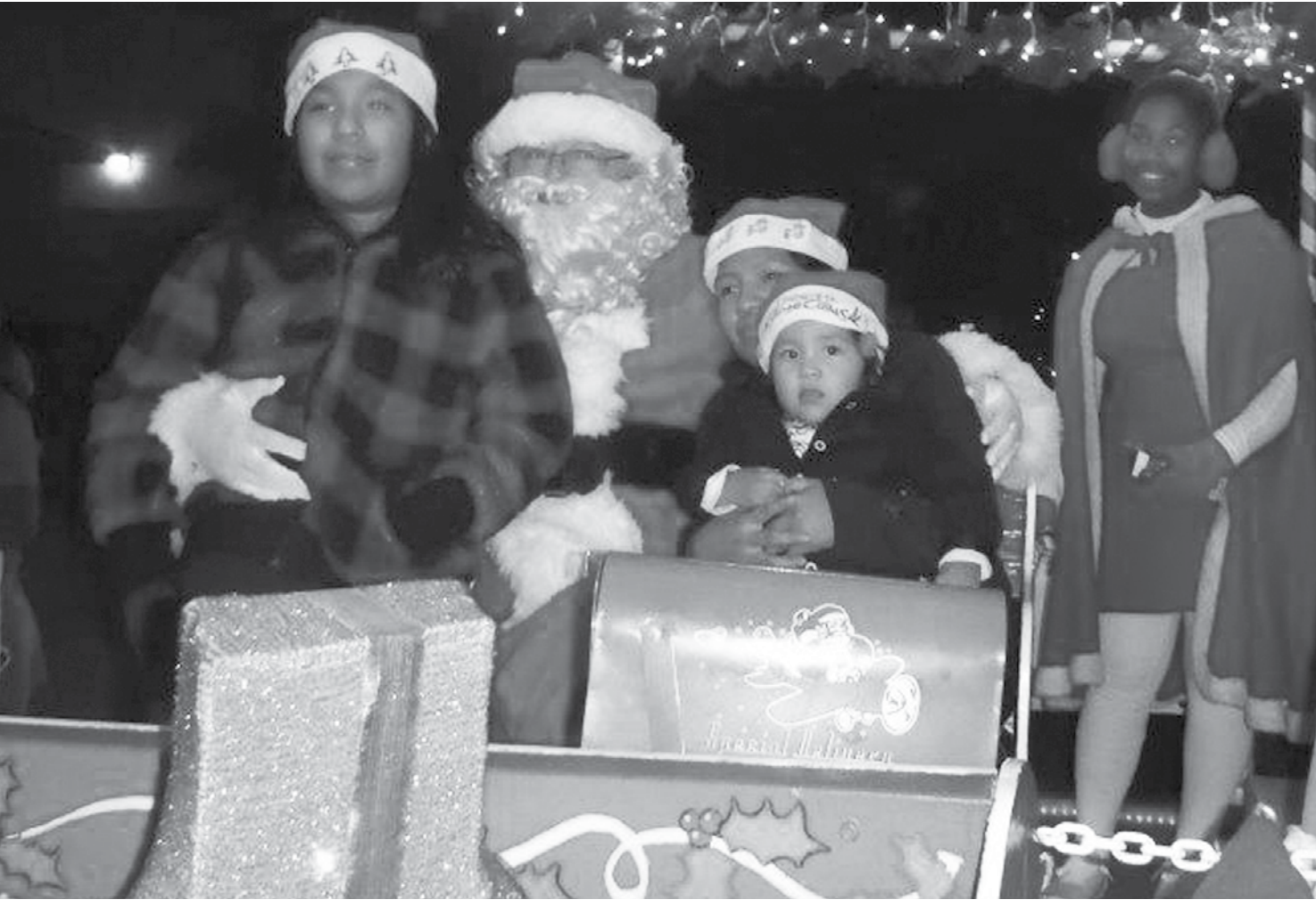
Santa Claus is alive and well in Lawndale, making the rounds through the city and finding out who has been naughty or nice.