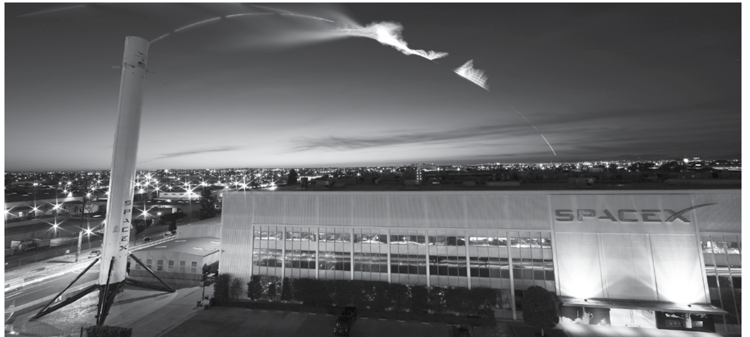
No, it wasn't a UFO. The white plume seen streaking across Southland skies the evening of Friday, December 22 came courtesy of the Hawthorne-based SpaceX, which launched a Falcon 9 rocket from Vandenberg Air Force Base. The dazzling visuals spurred many to pull out their phones to take a photo or video. This view shows the rocket's flight trail from above the company's local headquarters.