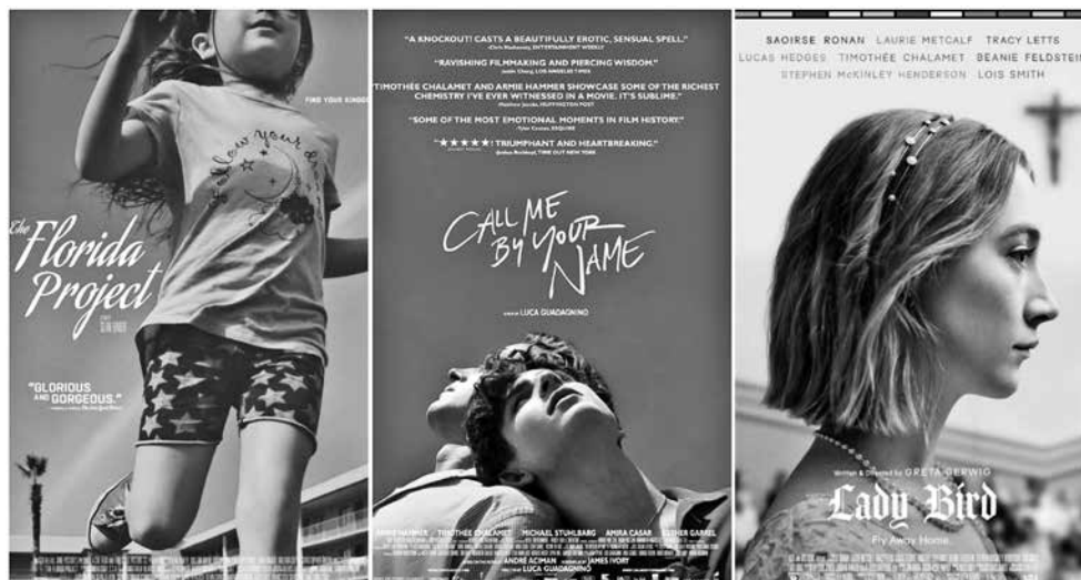
The Florida Project (A24), Call Me By Your Name (Sony Pictures Classics), and Lady Bird (A24).