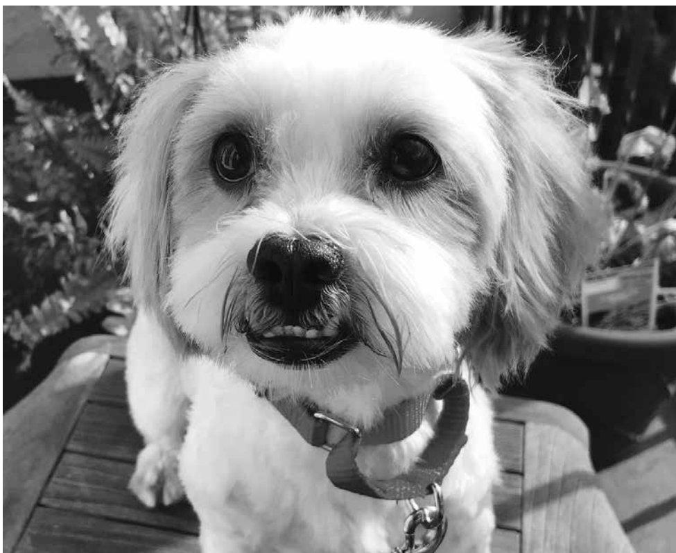
Congratulations to Beanie and his new family.

Beanie is the little Shih-Tzu mix that required four surgeries over the course of two months to totally remove all of the foxtails he had. His folks had previously adopted MSFR's Timmy, a tiny poodle mix, in 2006 but sadly he passed away a couple of months ago from kidney cancer. Their little five-year old female Malti-Poo (Maltese/Poodle mix) named Pixie missed Timmy and everyone was so lonely and