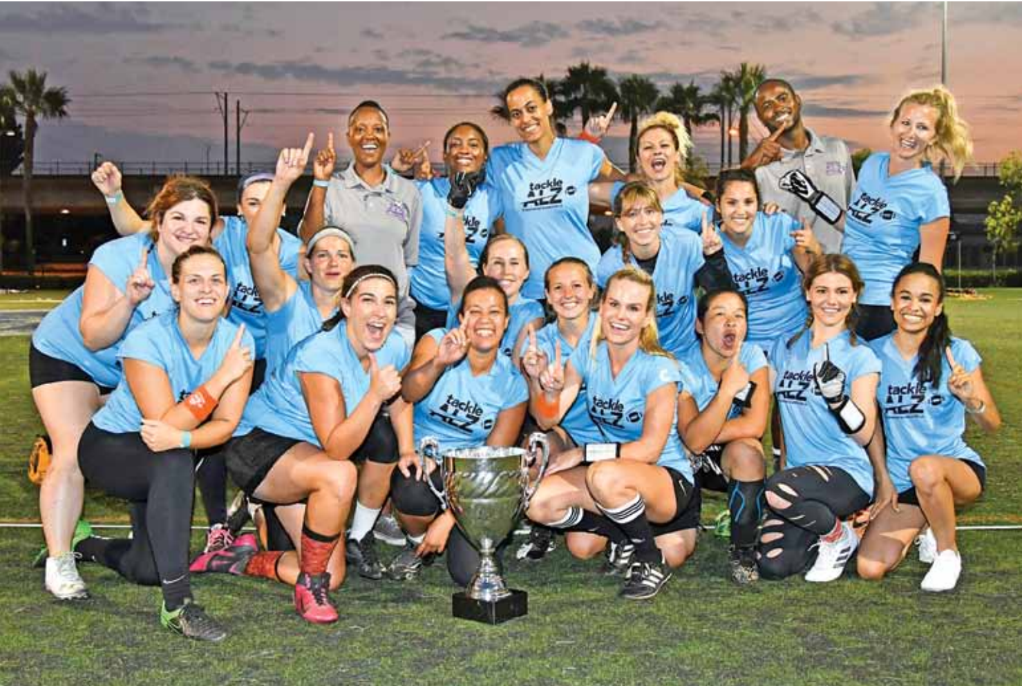
The 6th annual tackleALZ flag football game took place Saturday, July 15 at Campus El Segundo. Two teams--the FireALZ (pictured above) and the AlzStarz--competed fiercely both on and off the field in a friendly rivalry to raise awareness of Alzheimer's disease and funds for Alzheimers' of Greater Los Angeles (ALZGLA). Team FireALZ won the game, 13-12, but team AlzStarz won the online fundraising challenge. tackleALZ raised more than $60,000 for ALZGLA.