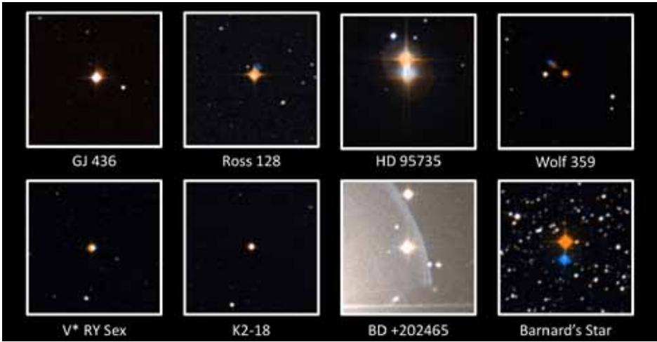
Barnard's Star Will Be Studied Simultaneously from Different Observatories