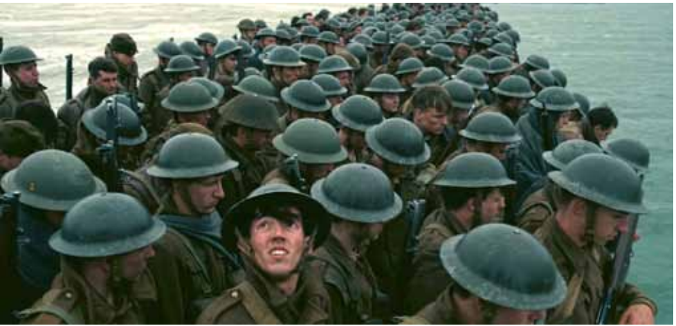
Christopher Nolan's Dunkirk is stunning in both scale and artistry.

Much can be said about the experience of seeing this film in IMAX. The genuine IMAX screen at Universal Citywalk is where I was able to experience this film and it did