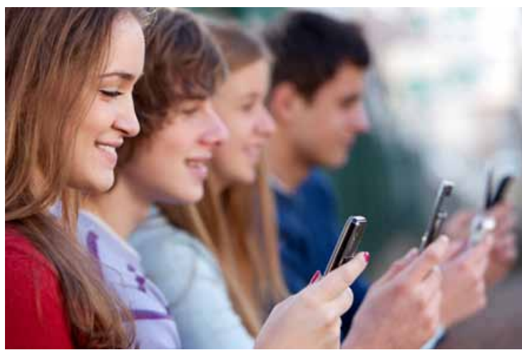
College students with smartphones within reach found it harder to concentrate and focus.

experience "phantom vibrations," feeling as though their phones are vibrating even when they're not. A 2012 paper published in the journal Computers in Human Behavior