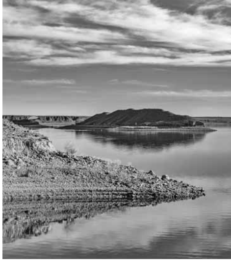
Reflecting on the Wind River at the Boysen Reservoir.

driving up from Colorado, with the impossibly distant horizon and a sky-high storm front that stretches from one end of the world to the other