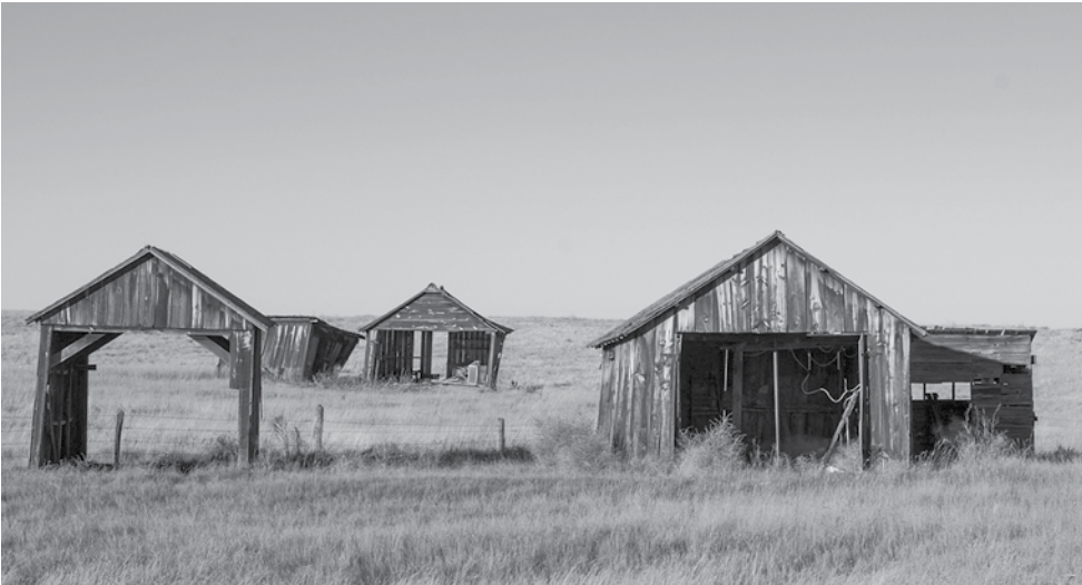
What might have been.