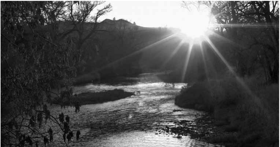
Sunrise over Sheridan.