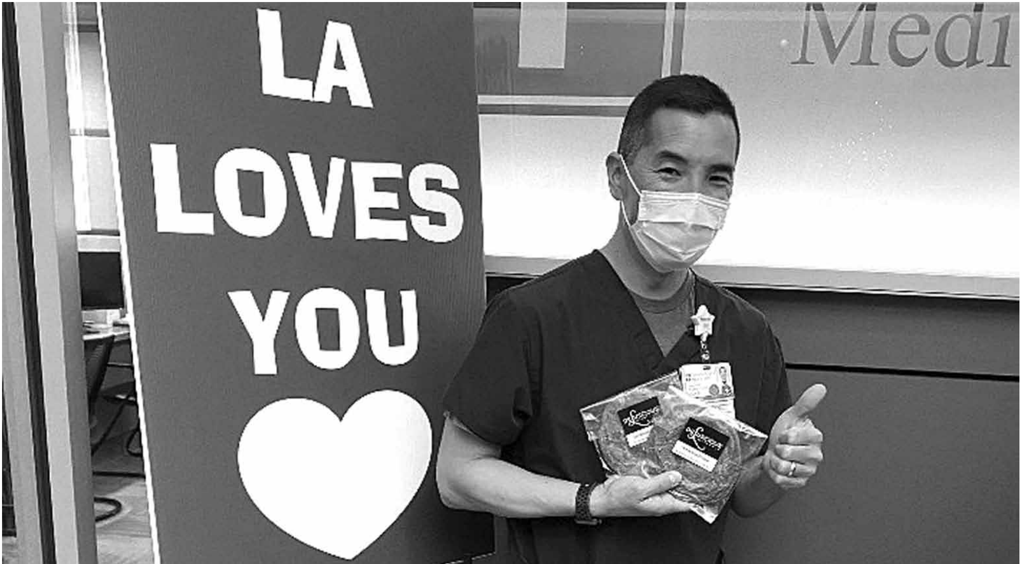
Big Shout Out to DeLuscious Cookies for delivering not only their fantastic cookies to our team but also a heartfelt thank-you card to the hospital’s frontline workers. With Omicron variant infections on the rise, our dedicated healthcare team and support staff are working harder and longer than ever to meet the needs of the Inglewood community and our surrounding LA County cities. Your donation lifted spirits and helped save lives. We appreciate you.