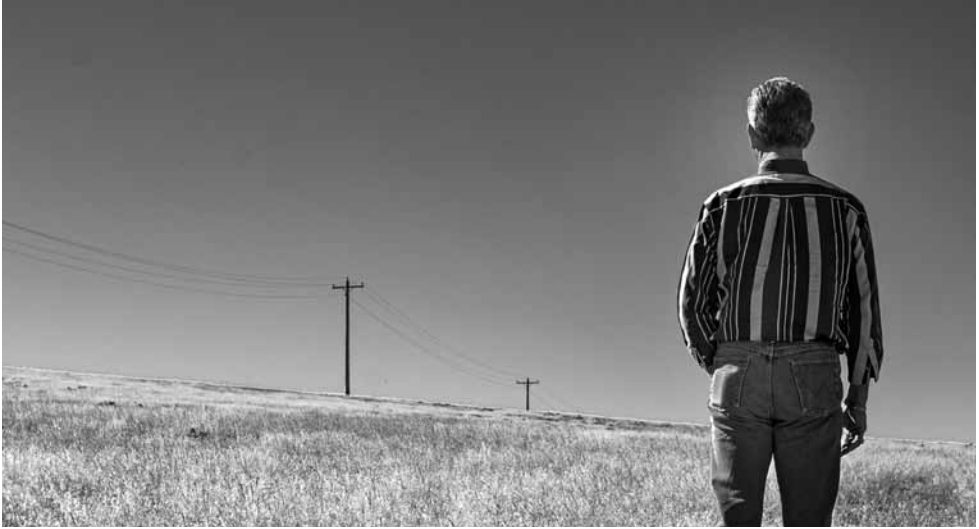
As far as the eye can see.

have any questions or interest in a particular subject, please email them at web@herald-publications.com . •