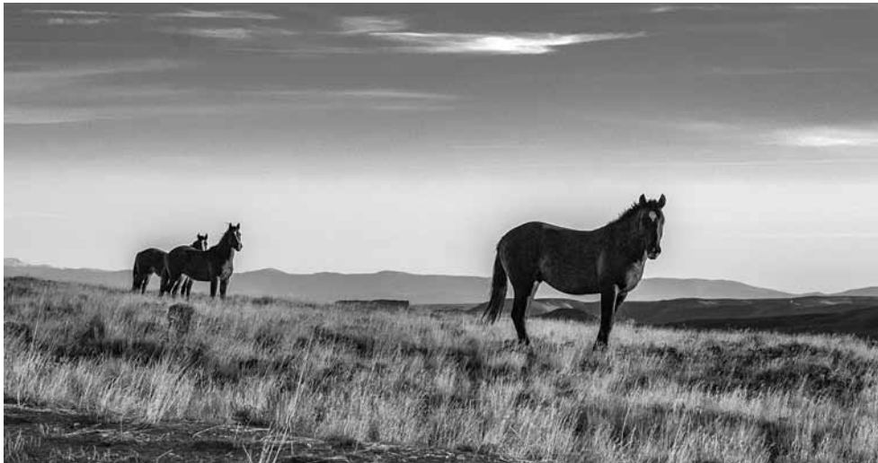
Chasing wild horses across the American steppe.