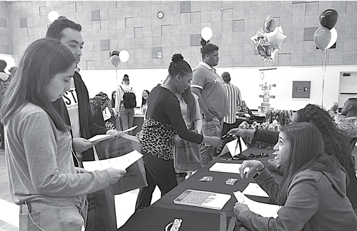
On December 27th, South Bay Workforce Investment Board Partnered with Centinela Valley Union High School District to Present the Second Annual Career Fair for High School Students Visit www.sbwib.org for more available services.