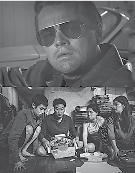
Leonardo DiCaprio in Once Upon a Time... In Hollywood (Sony), the cast of Us (Universal), Robert DeNiro in The Irishman (Netflix), and the cast of Parasite (Neon).

While Martin Scorsese's decades-spanning crime epic does follow the life of a hitman, the film is not just another celebration of criminals like Goodfellas . In The Irishman ,