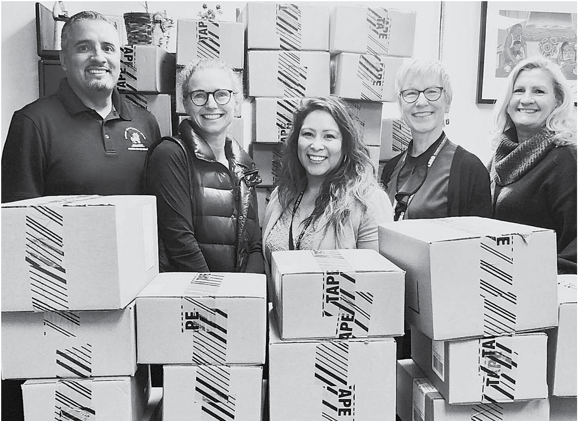
Children from the neighboring Beach Cities collectively ran over 1600 miles to have 65 pairs of shoes donated to Lawndale students! Skechers and Kids Helping Kids partnered with Lawndale Elementary School District.