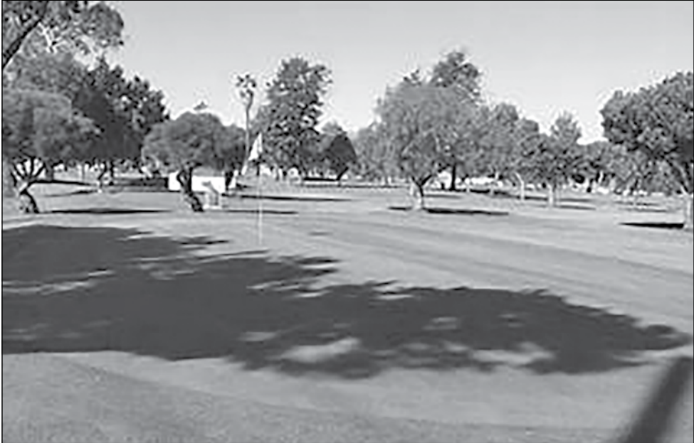
Alondra Golf Course.