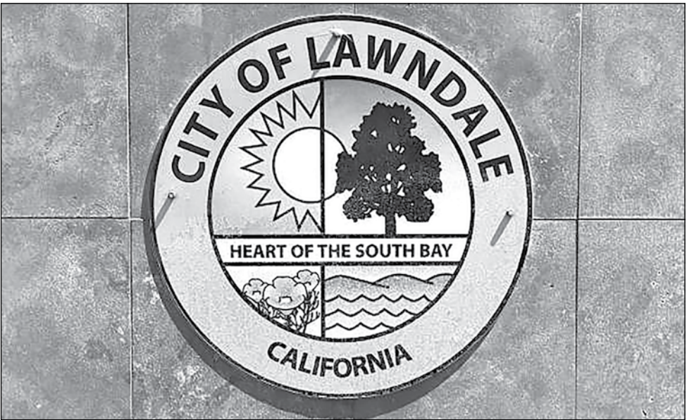
Lawndale, Heart of the South Bay.