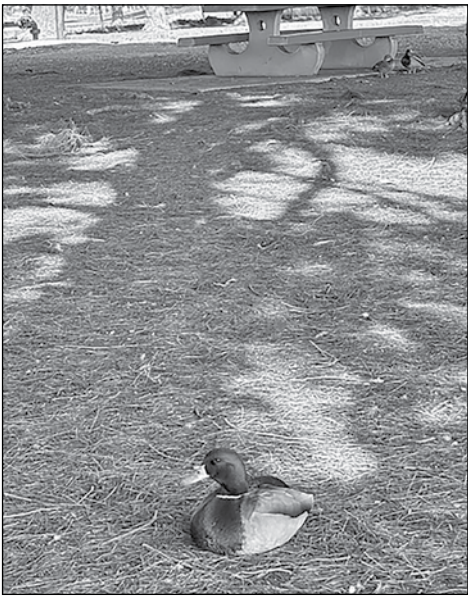
Feeling Ducky at Alondra Park.