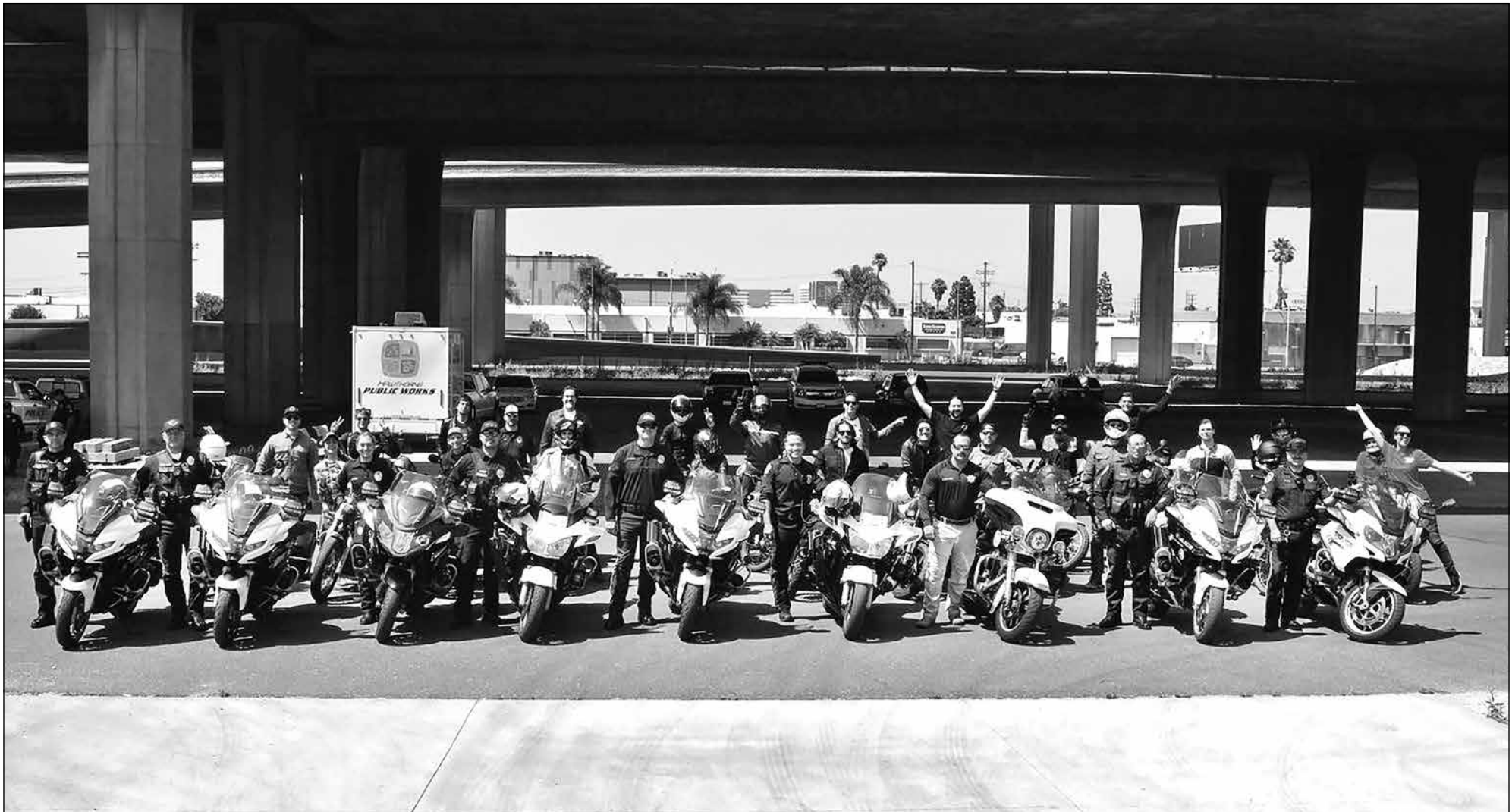
Ride to Live is a Hawthorne Police Department sponsored training class for any motorcycle rider seeking to improve his/her riding skills, enhance their safety and control, and learn the techniques taught at law enforcement motor schools. This class works because the skills taught are real-world skills. No classroom. It's all about "hands on" learning techniques and skill sets that you can put into practical use immediately. The classes are Free to all riders and the next class is this Saturday. Space is limited so register today. For registration, requirements, and more info, go to www.ridetolive.com.