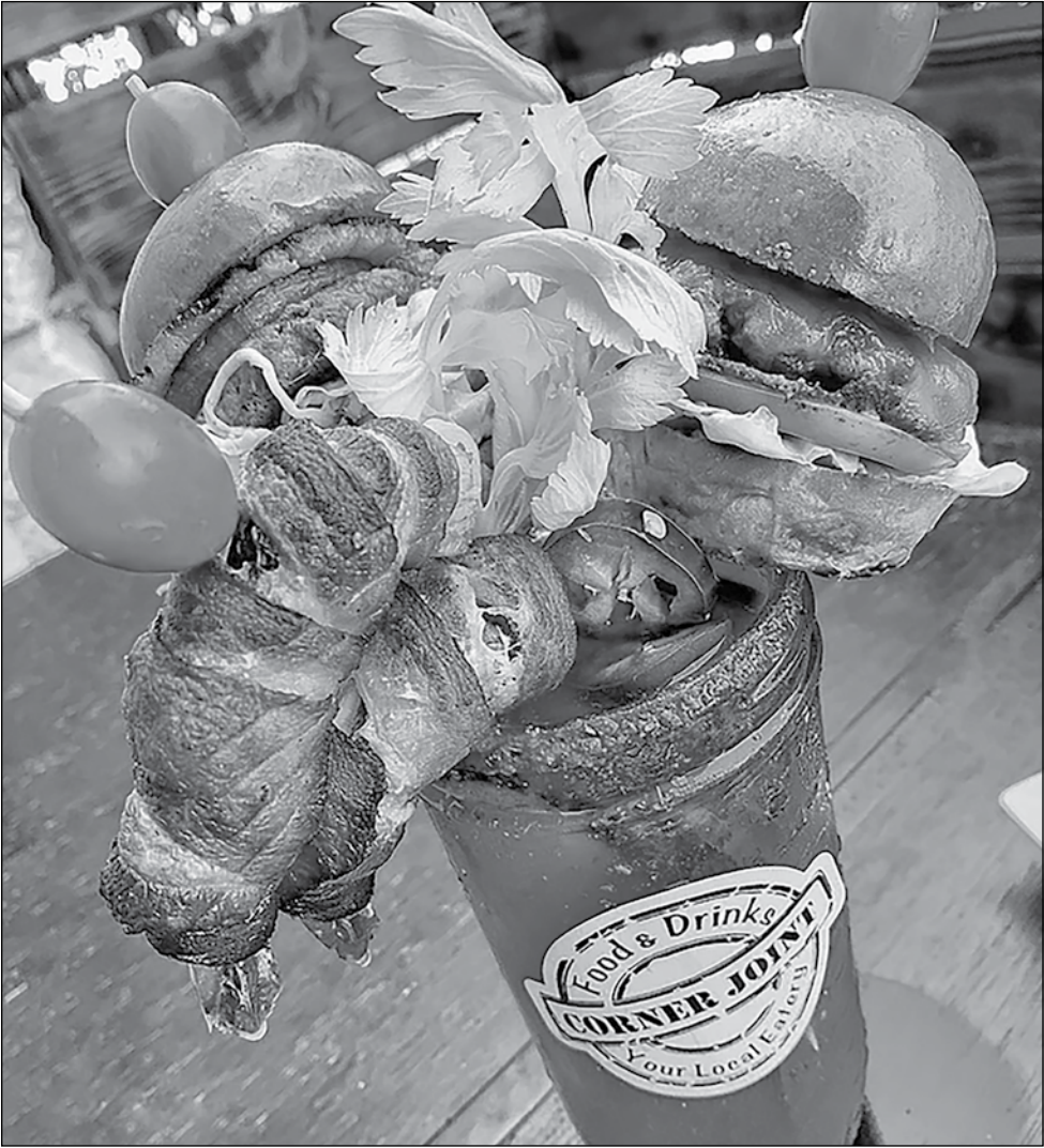
Corner Joint is your local eatery and hangout spot featuring specialty pizzas, pasta dishes, sandwiches, cold beer, and big screen TVs that are perfect for watching your favorite sports game. Please support our local businesses.