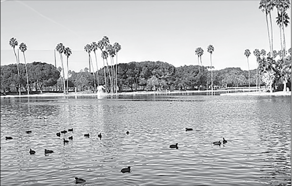
Alondra Park.