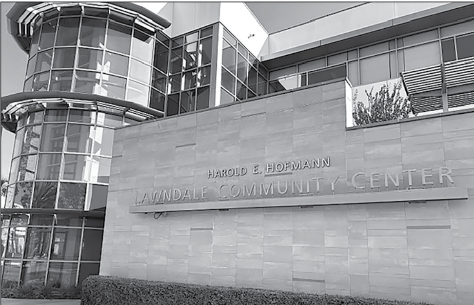
Lawndale Community Center.