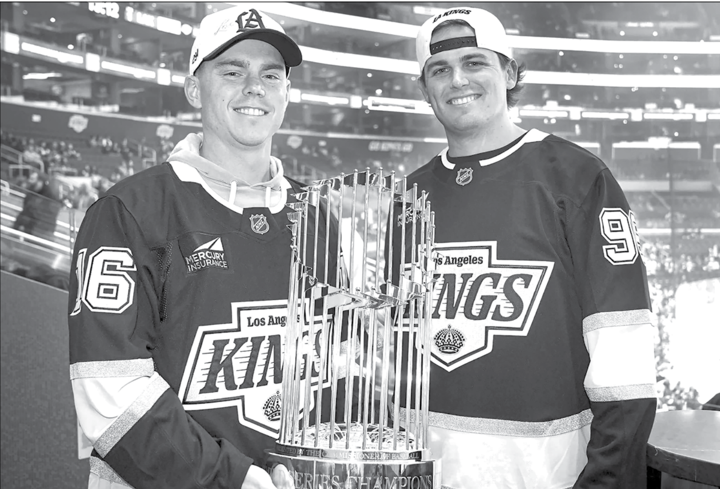
The Champs were in the house, celebrating with the World Series trophy. The Los Angeles Dodgers were recognized by the Los Angeles Kings during their annual celebration to pay homage to the MLB franchise.