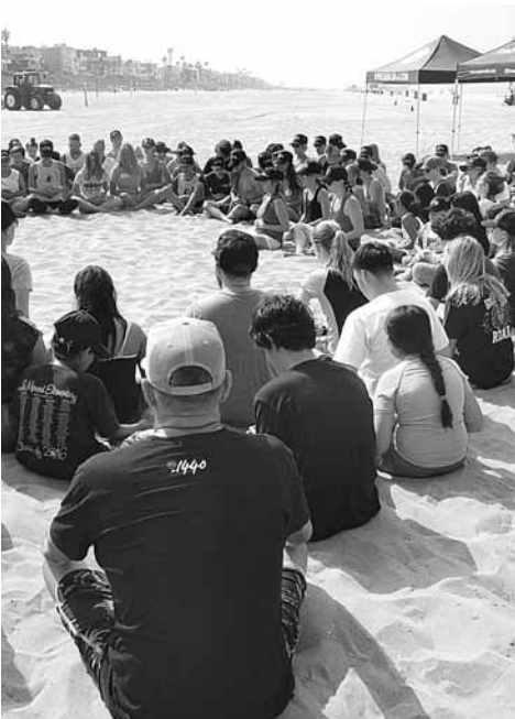
Mentors and mentees gather for Walk With Sally surf day.

If you or someone you know is struggling with the illness of a family member, or if you’d like to volunteer, email info@walkwithsally.org , or visit their website at walkwithsally.org .