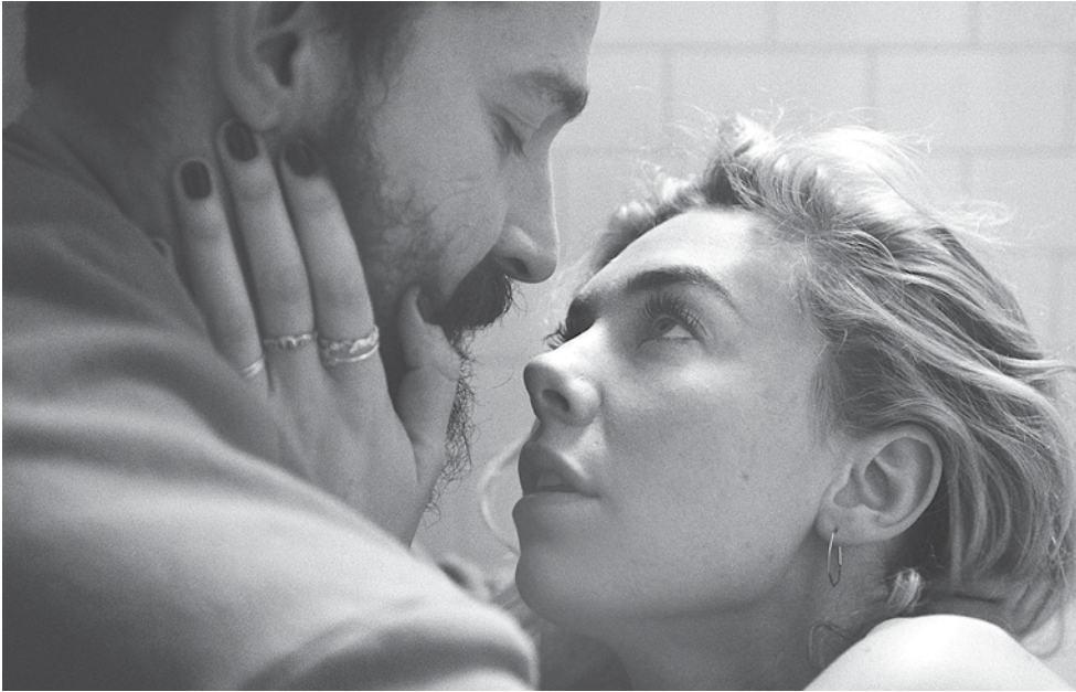
Pieces of a Woman , courtesy of Netflix.

While Pieces of a Woman offers a shocking, yet captivating look at human condition when suffering tragedy, its power is definitely in its 24-minute, uninterrupted opening scene. The choreography is both fluid and chaotic, and I held my breath in anticipation of what was to come. Kirby and Parker’s