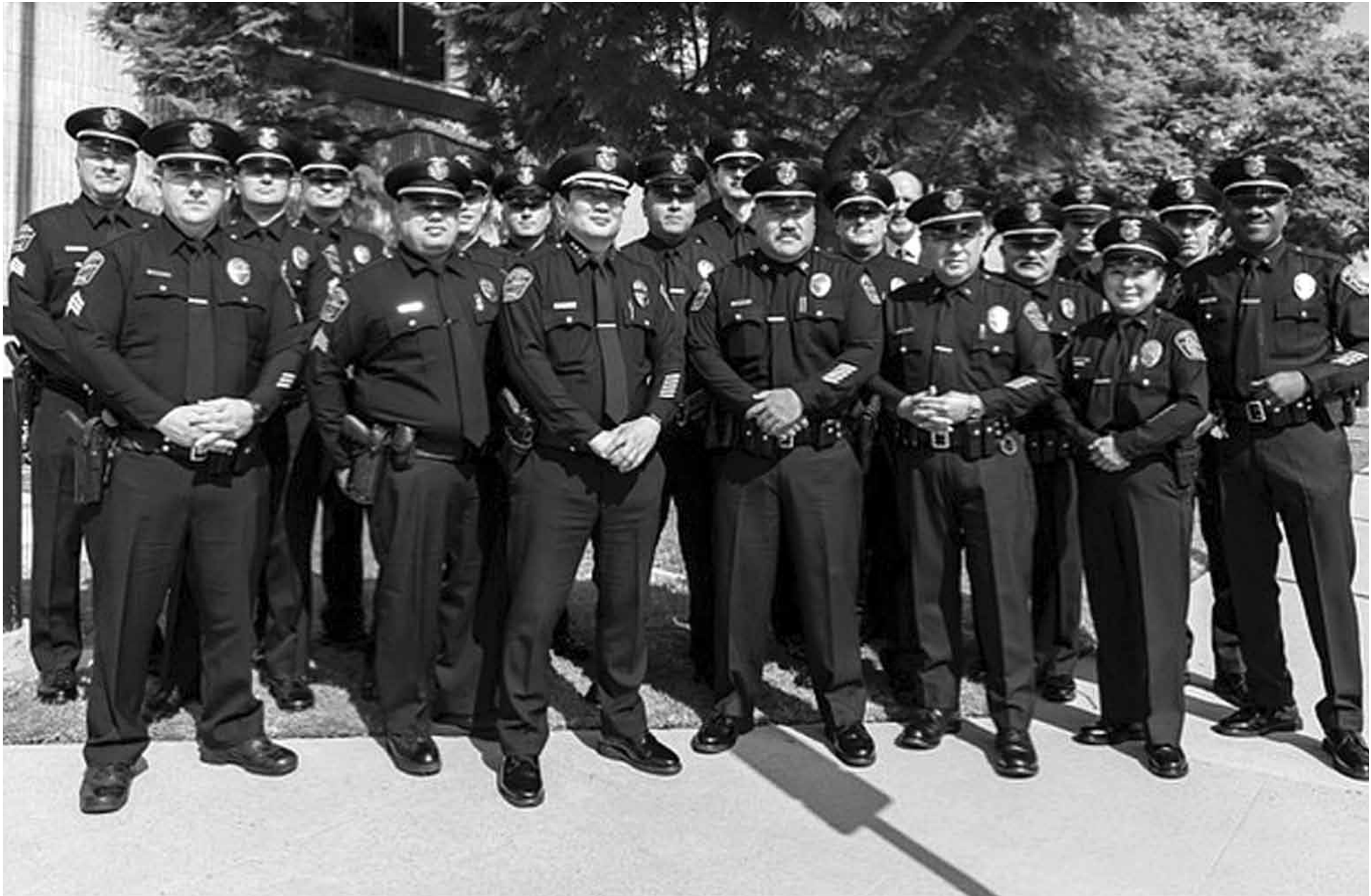
Saturday, January 9, was National Law Enforcement Appreciation Day. Thank you to our fellow police officers, doing good police work and serving communities world wide. Here in the City of Good Neighbors, we are proud to serve our Hawthorne community. Photo was taken before COVID.