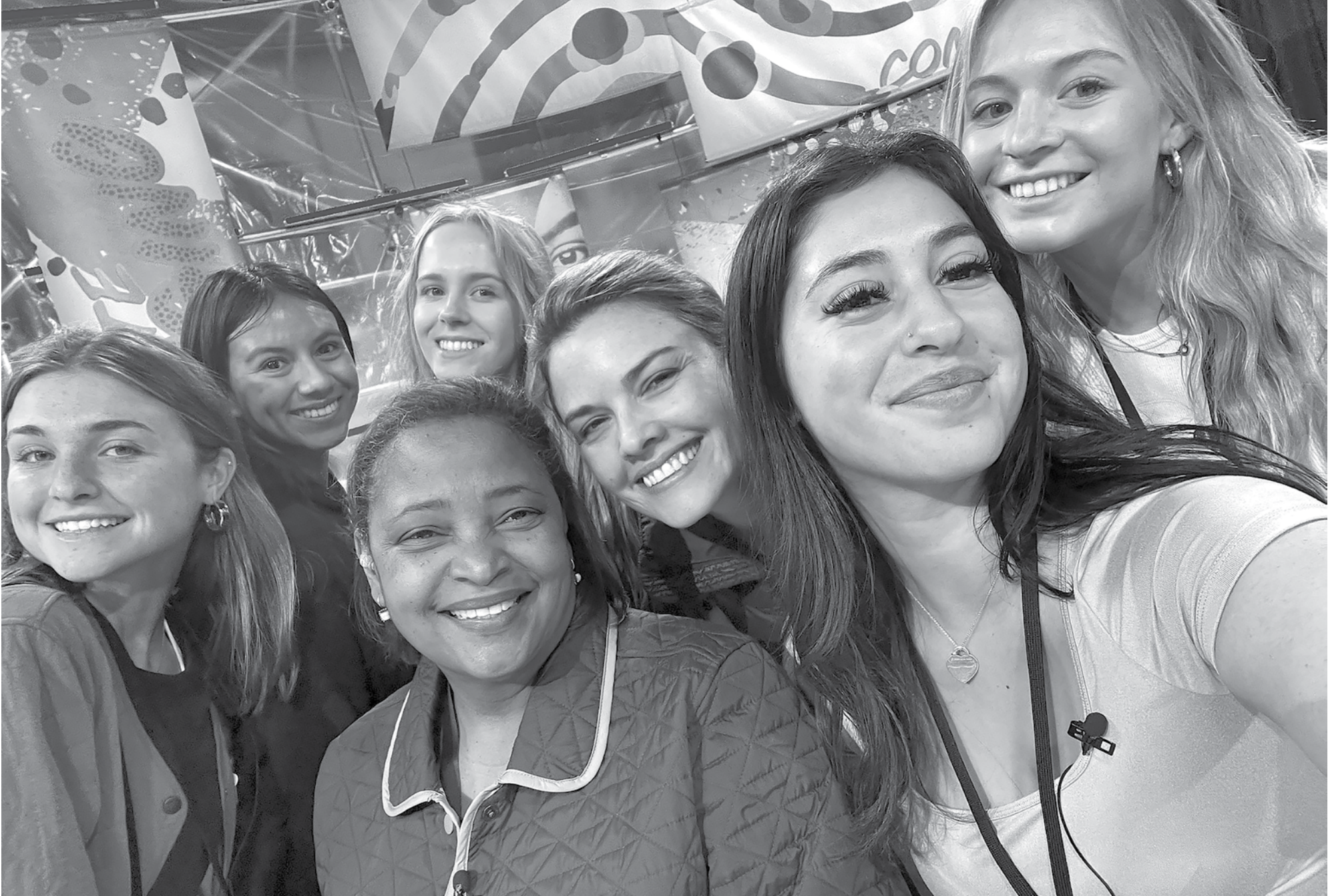
Students from El Camino College, California State University, Fullerton, California State University, Long Beach and UC Santa Barbara were interns at the Los Angeles taping of the National Day of Racial Healing specials that were sponsored by W.K. Kellogg Foundation. The specials aired on NBC News NOW and Noticias Telemundo.