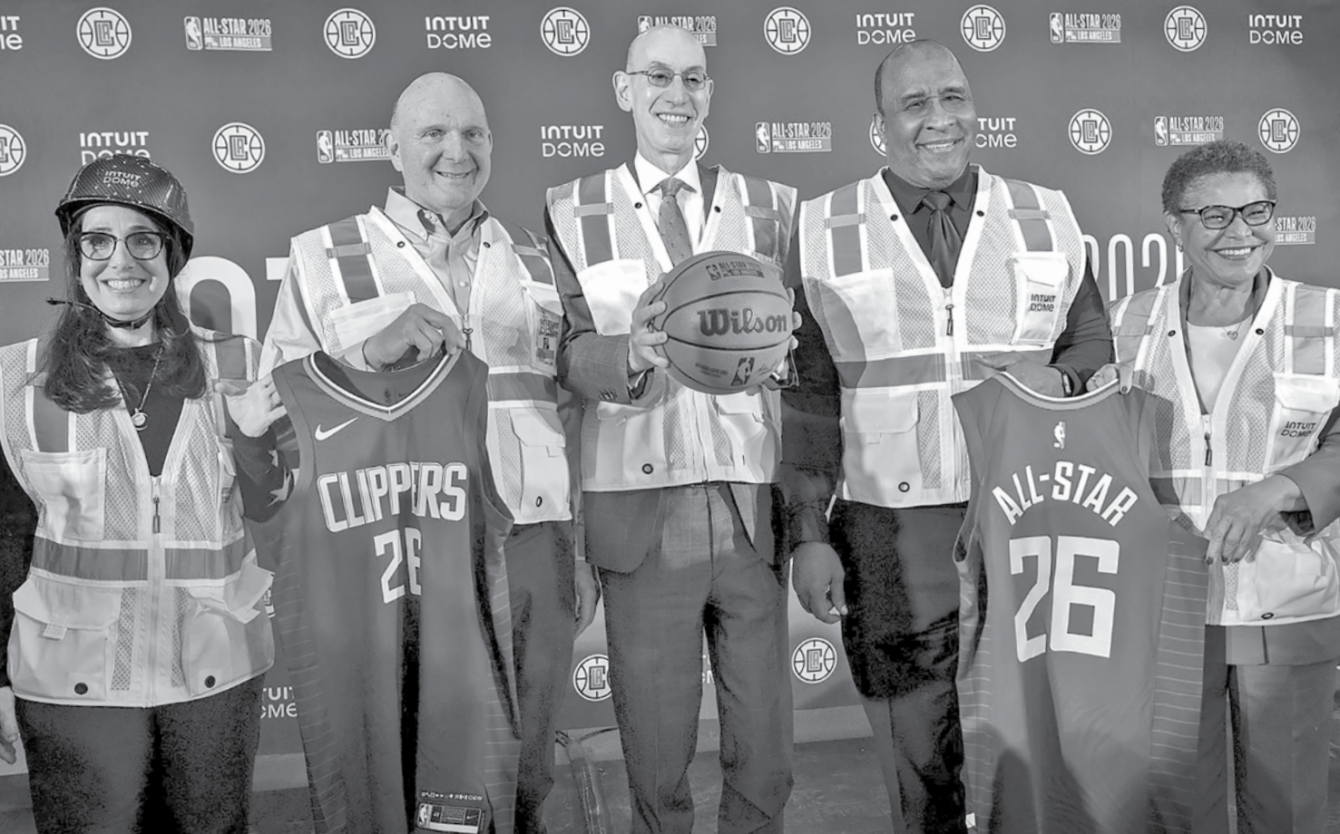
After 41 years, the NBA All-Star Game makes an exciting return to Inglewood in 2026 at the most sophisticated sports arena in the world, the Intuit Dome.