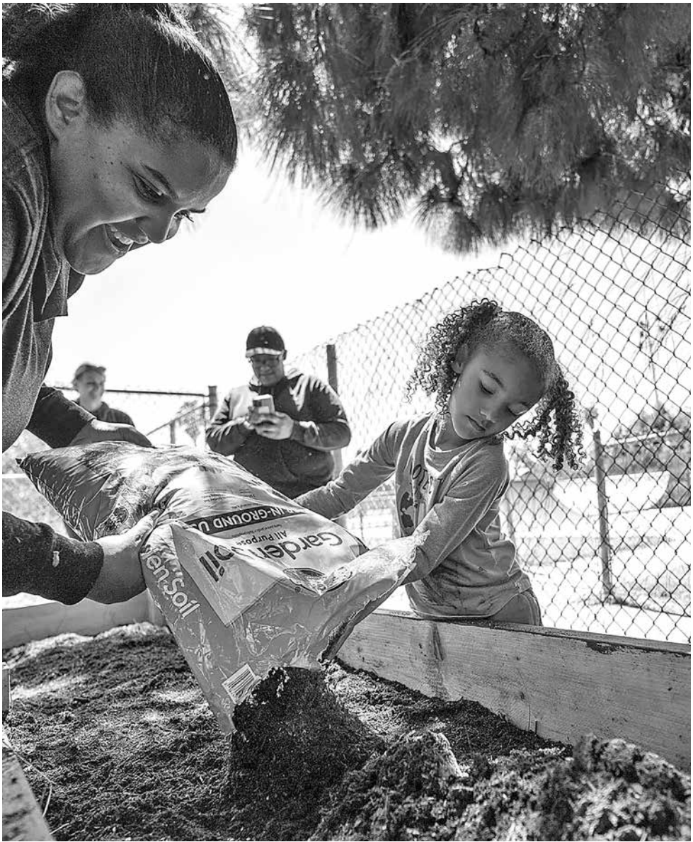
From wellness classes to handball courts to an outdoor preschool area – this park has it all. Don't miss out on the endless activities and facilities that make Rogers Park the ultimate hub for fun and fitness. Come join the excitement and support our parks.