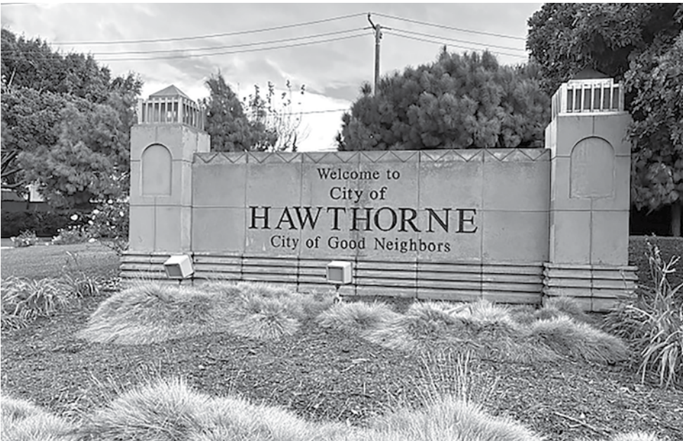
City of Good Neighbors

Marilyn Monroe and Jim Thorpe, and let’s not fail to mention the beloved Beach Boys whose music and lyrics have meant so much to so many over the years. I also find a warmth and friendliness in the neighborhoods. There are many parks and outstanding schools for the kids. The seniors have their own Center. Mr. Hawthorne, there is much to praise!” He would no doubt take this in, nod, probably sigh a bit, and remark: “I am not sure that I understand all that you are talking about, but I sense there is a real pride here, a genuine community, and an objective of lifting each other up... would that be correct?” Without missing a beat, I would put my hand on his shoulder, look him square in the eye, and say: “In my view, that is a definite. This is not to suggest Hawthorne is without See Mr. Hawthorne, page 5