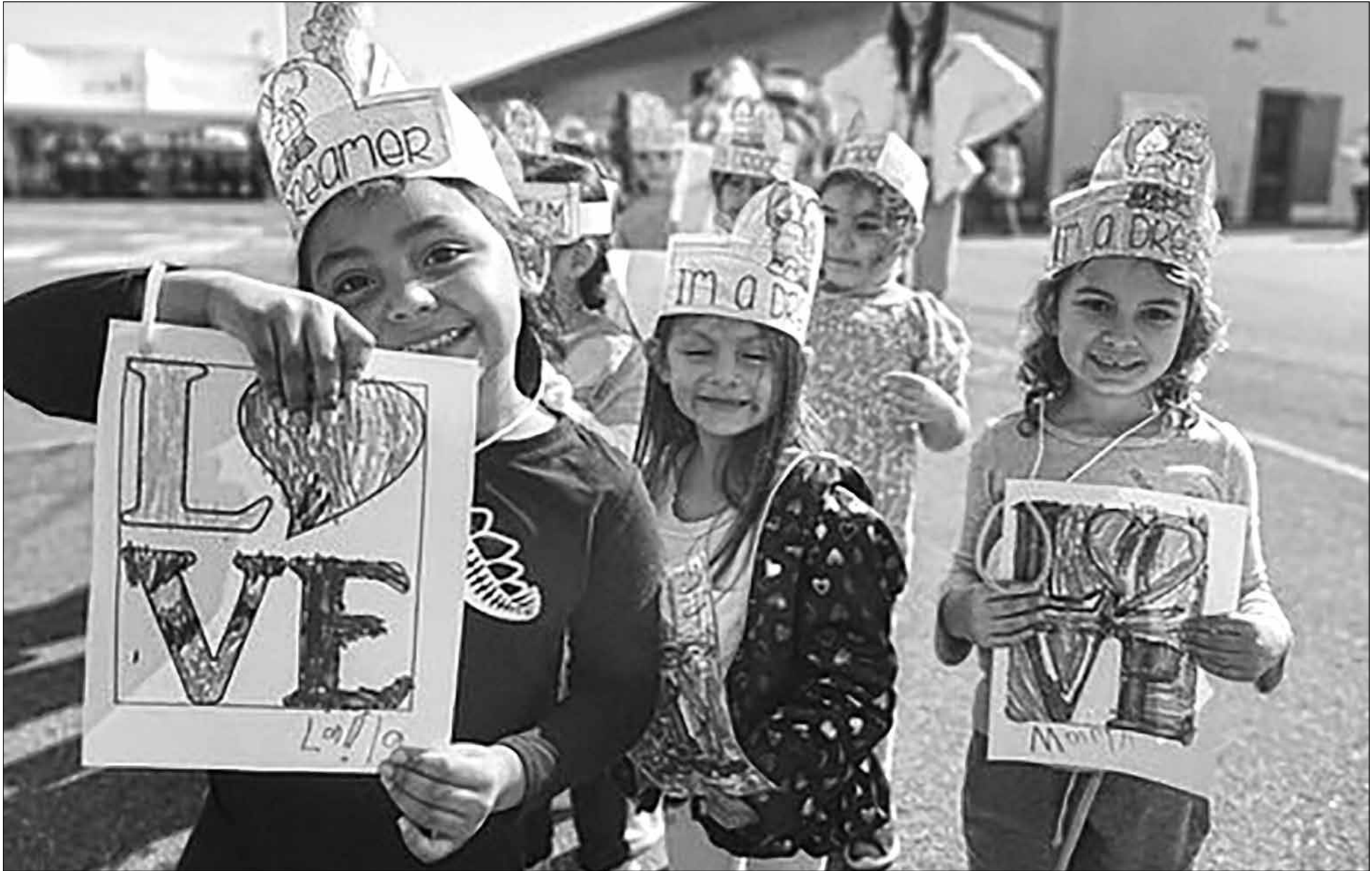
TK and Kinder students engaged in their annual Peace March in honor of the legacy of Dr. Martin Luther King Jr. Teachers prepared for this day by teaching about the legacy of Dr. King, the civil rights movement, peaceful marches, and how it connects to the way our community SOARS by always leading and serving with love. They sang songs, made signs, and engaged the entire school in their march. The entire school took part of these march by cheering them on, waving, making signs, and singing along. Let us keep working towards peace and a brighter future for our aviators and our community.