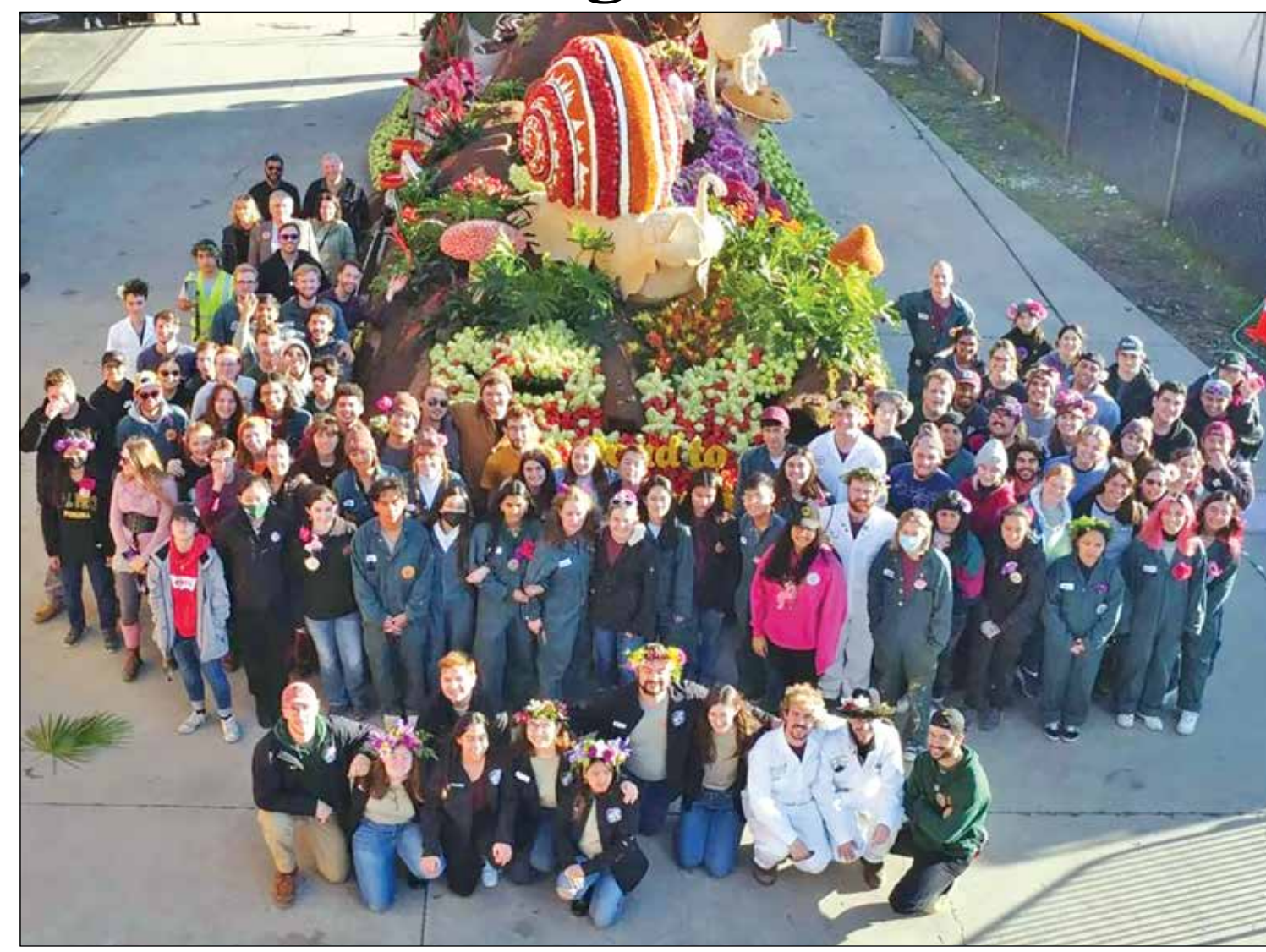
The Cal Poly float team who helped create The Road to Reclamation float in the 2023 Rose Parade. For story see page 3.