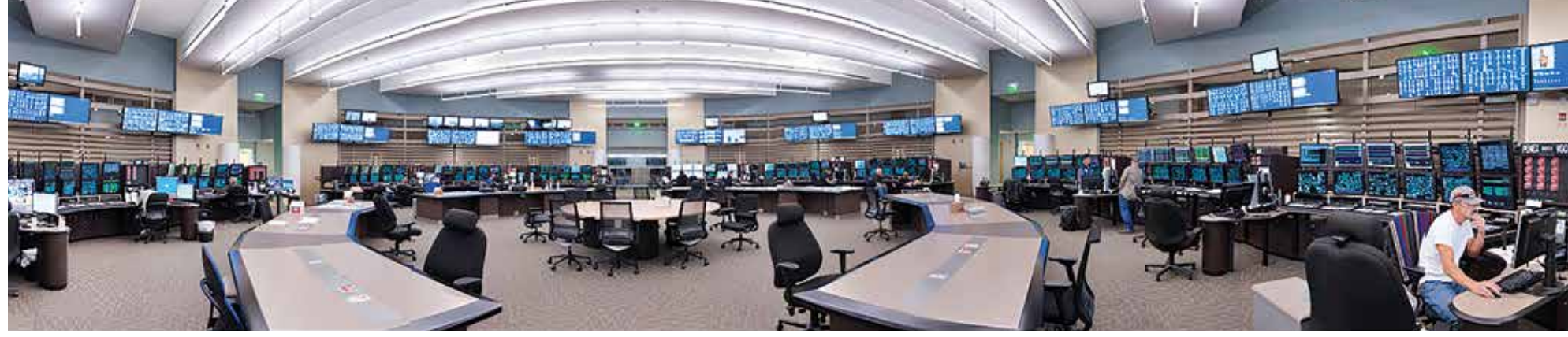
{\it Chevron's NASA-like\ control\ center,\ known\ as\ the\ Refinery\ Optimization\ Center(ROC).\ }

ables technology and innovation while still providing safe, reliable service to customers—a win-win. "We have a long tradition of being able to deliver on a corporate level to our shareholders," he said. And an especially important part of delivering to shareholders involves constantly thinking about how the company's operations and presence coincide with its neighbors, including El Segundo. As a result, one of the company's biggest priorities