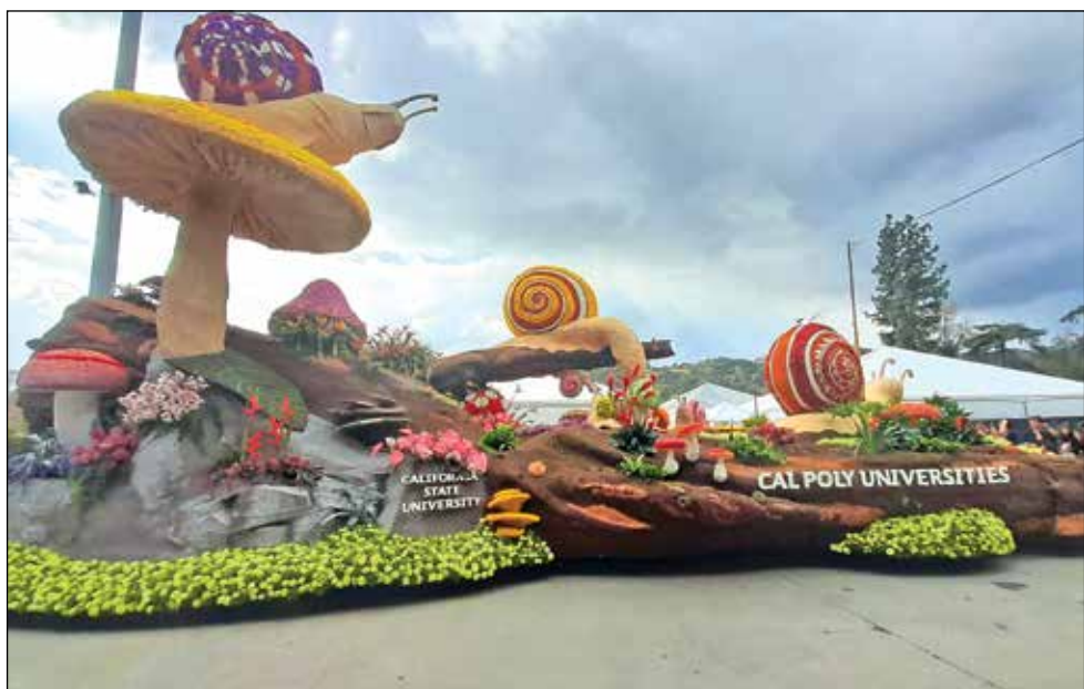
The Road to Reclamation