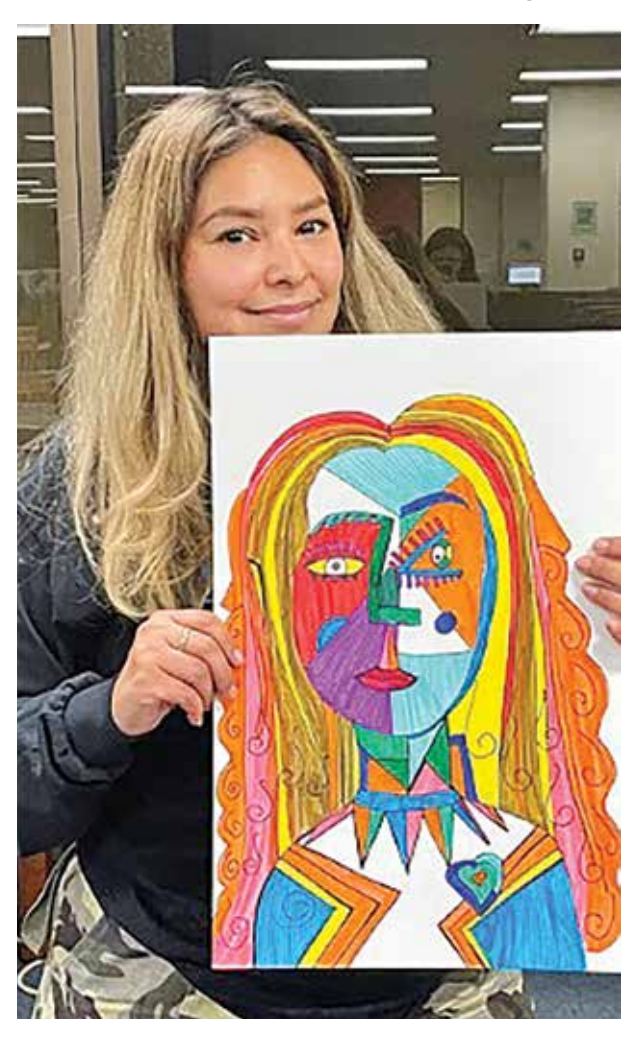
Library patrons had an awesome time creating their Picasso inspired self-portraits. Check out other fun events at the library.