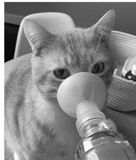
Happy New Beginnings for Maui and his new family.

When you adopt a "pet without a partner", you will forever make a difference in their life and they are sure to make a difference in yours. •