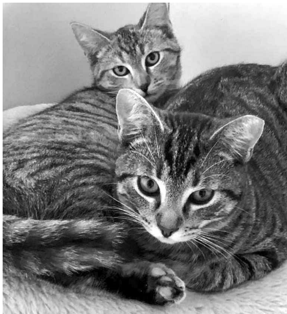
Minnow and Mackerel