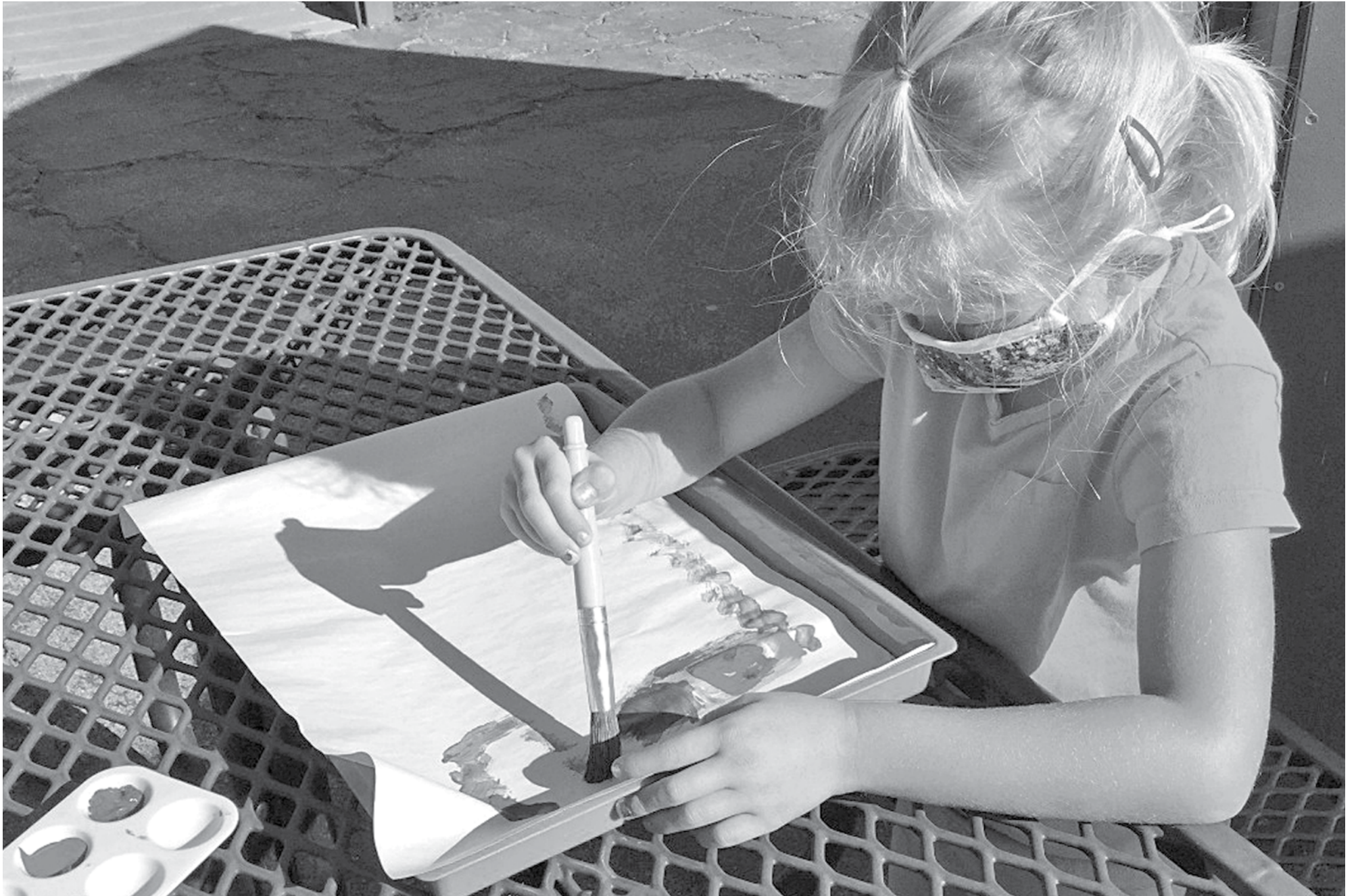
State Preschool student enhancing her fine motor skills and creativity by using a paint brush and different paint colors. It brings a smile to our faces to see students safely engaged in learning.