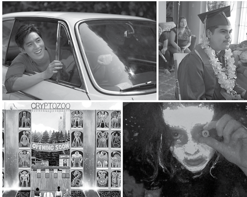
Photo courtesy: (From top left, clockwise One For The Road , Homeroom , We're All Going To The World's Fair , Cryptozoo )

This documentary follows the lives of Oakland high school seniors navigating college