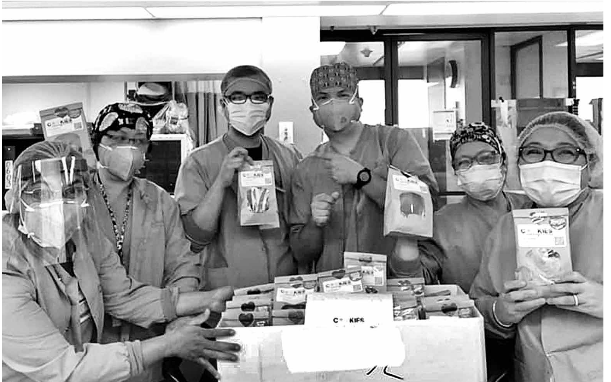
Showing their support to our Healthcare Heroes, Cookies for Caregivers Los Angeles baked up a storm of love and appreciation for the brave. It really makes a difference to know that the community supports our healthcare team, especially during this time.