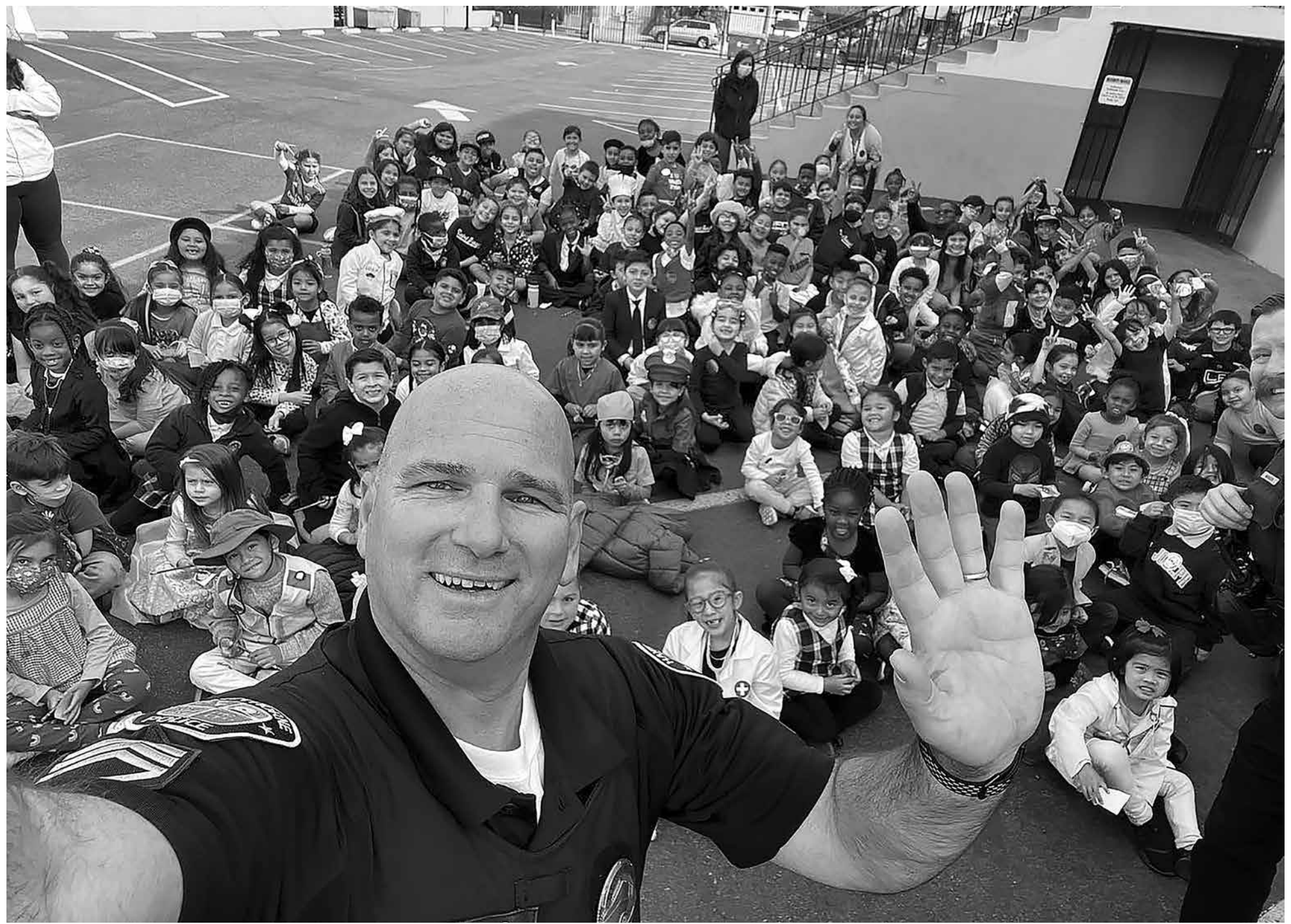
Saint Joseph School invited the Hawthorne Police Department to their career day. They had an awesome time talking with the kids and Gabby the Talking Police Car was excited to see the students again.