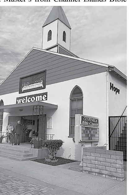
Centinela Bible Church