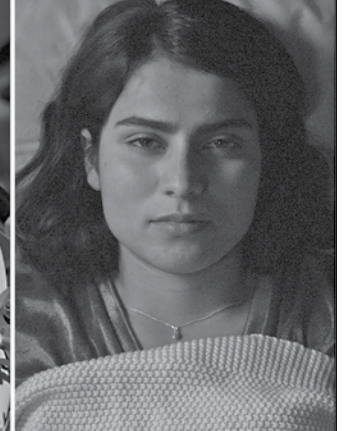
(From L-R): Fair Play, Going Varsity in Mariachi, Fremont.

streaming for attendees again this year - a model they did exclusively for the past two years – so that I could stream films from my home in Los Angeles. While most of the films are still awaiting distribution, here are three titles that should be on your radar.