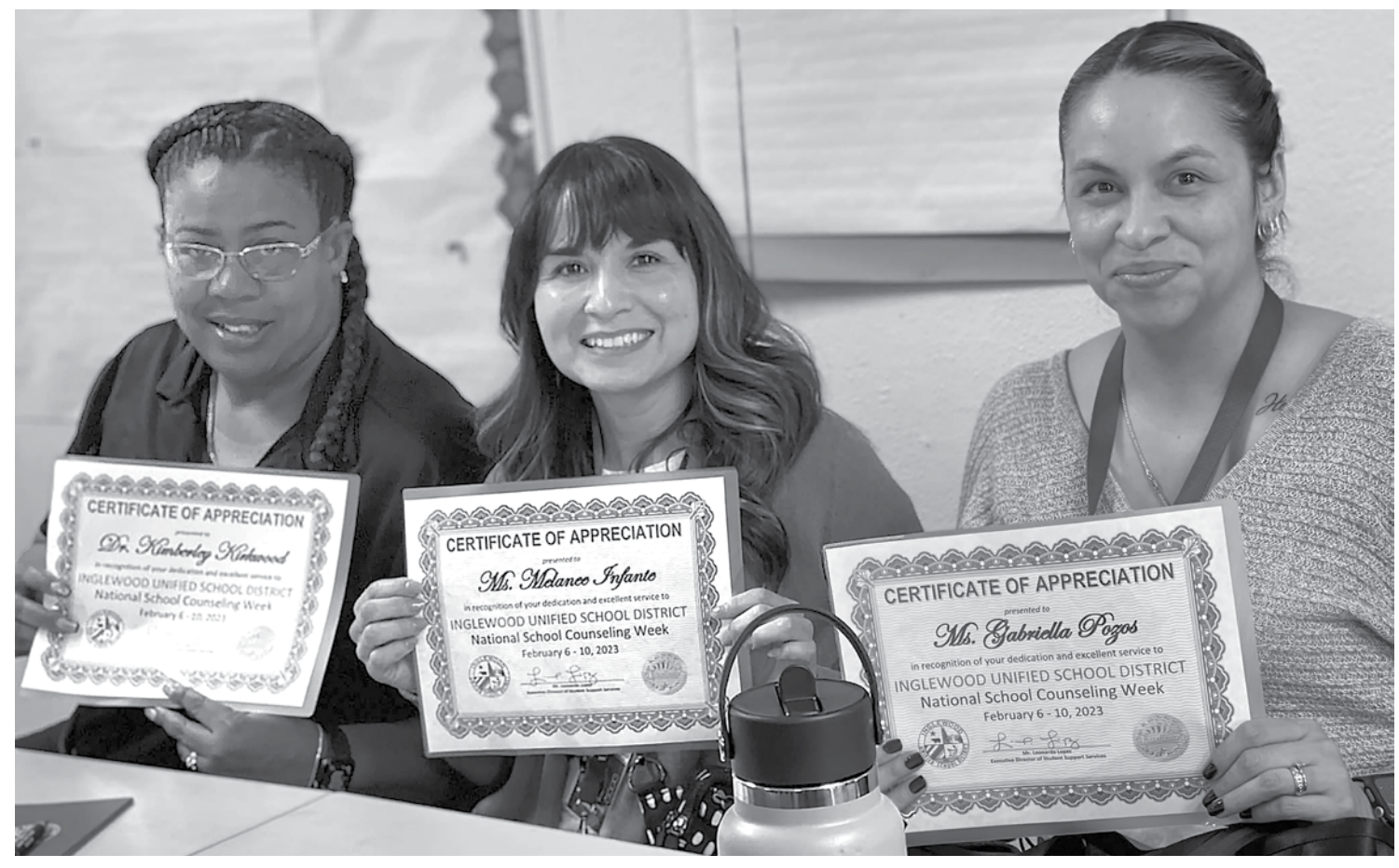
In honor of National School Counseling Week, our Student Support Services department recognized our amazing school counselors. We are extremely grateful for the significant impact they make in the lives of our students every day.