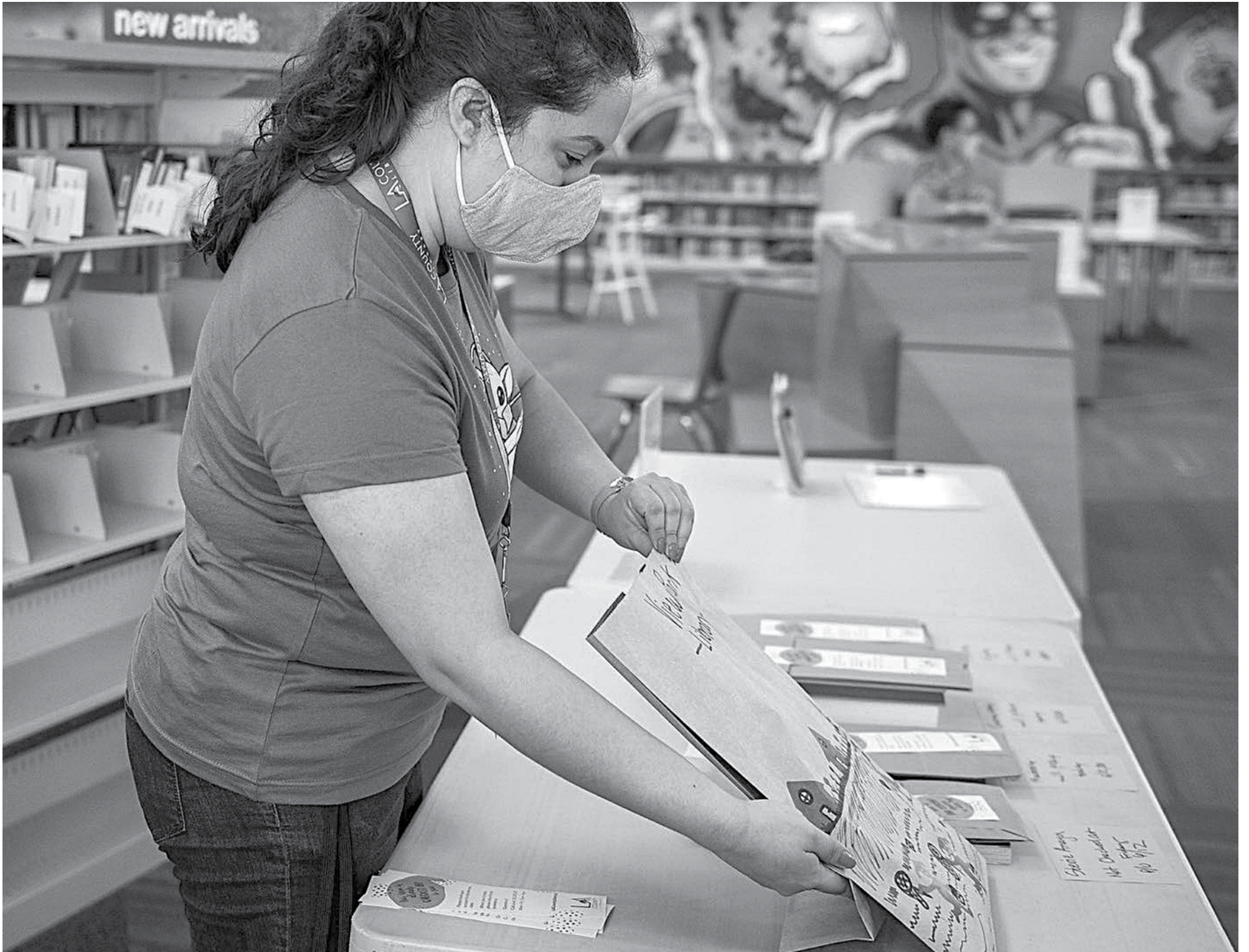
No printer at home? No problem! Use our wireless printing service and arrange to pick up your documents at any of our Sidewalk Service locations. Print jobs will be immediately placed in an envelope for confidentiality. For more information, please visit: https://lacountylibrary.org/print/ .