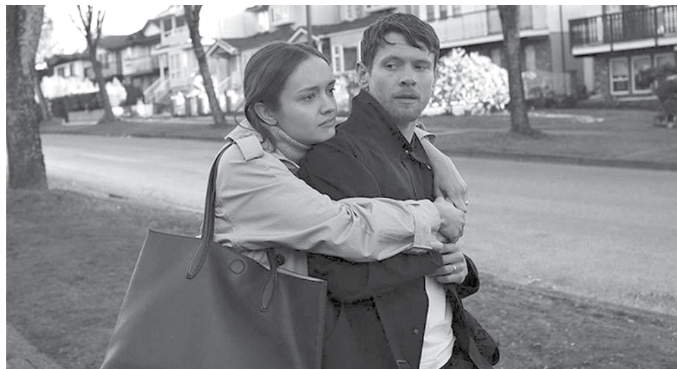
Little Fish