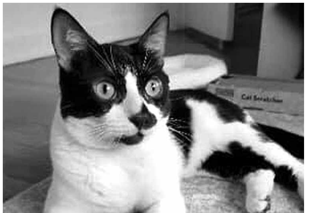
Happy New Beginnings for Pooh and his new family.

When you adopt a "pet without a partner", you will forever make a difference in their life and they are sure to make a difference in yours. •