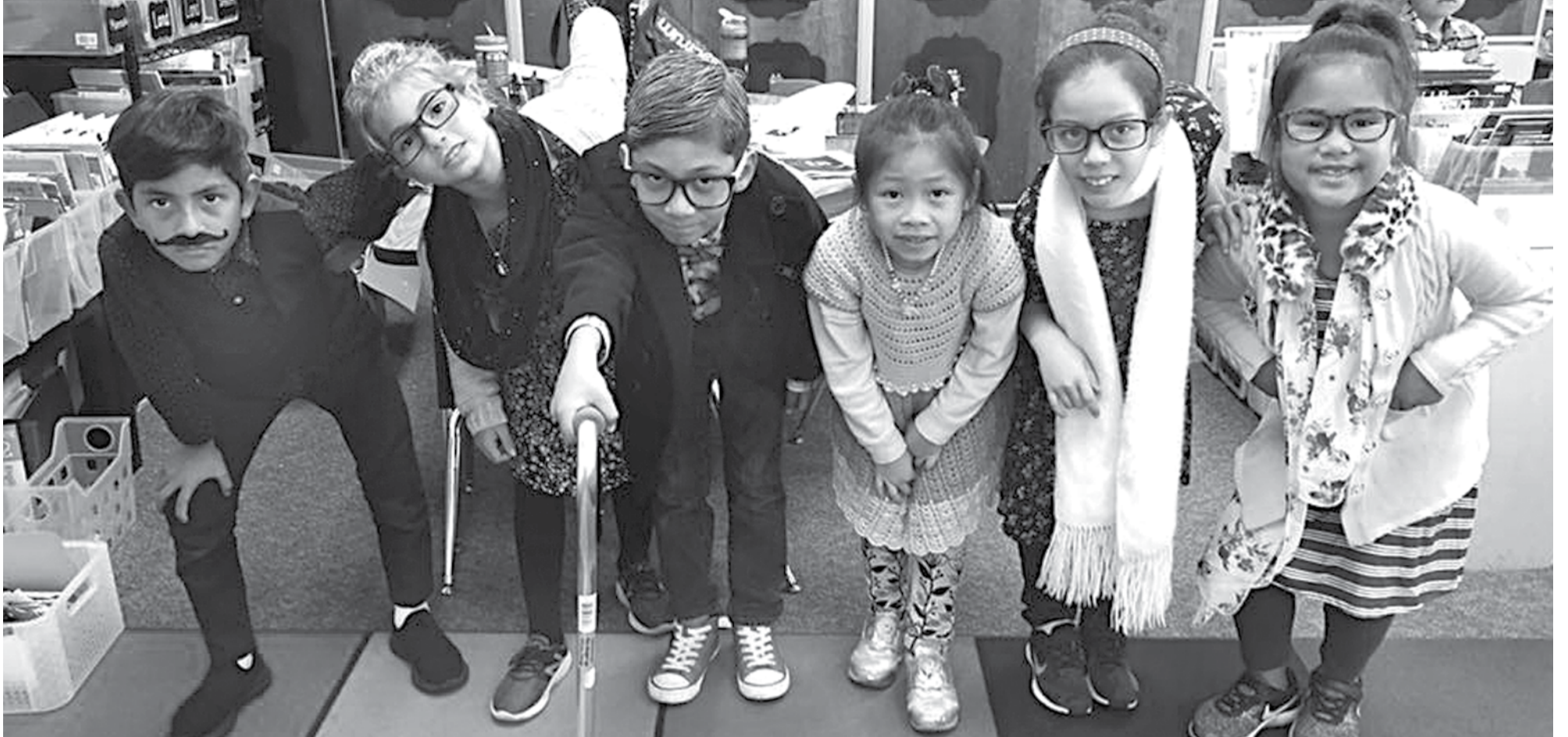
The 100th day of school! Lawndale students celebrated by dressing up as one-hundred year olds. I wonder what they will look like on the 180th day.