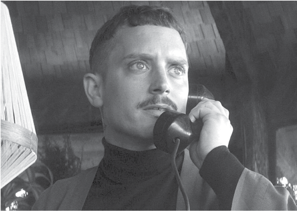
Come to Daddy.

After receiving a letter from his long estranged father (Stephen McHattie) asking to reunite, young electronic artist Norval (Elijah Wood) agrees to reconnect despite having been abandoned by him as a child. But when Norval arrives at a secluded beachside cabin with the intention of impressing his father with stories of his LA successes, he finds his father – grizzled and gruff – curiously unwilling to reunite. After a few questionably unsafe moments arise, it feels to Norval that his dad is actively trying to inflict danger to him. And that’s when things go from weird, to outright insane.