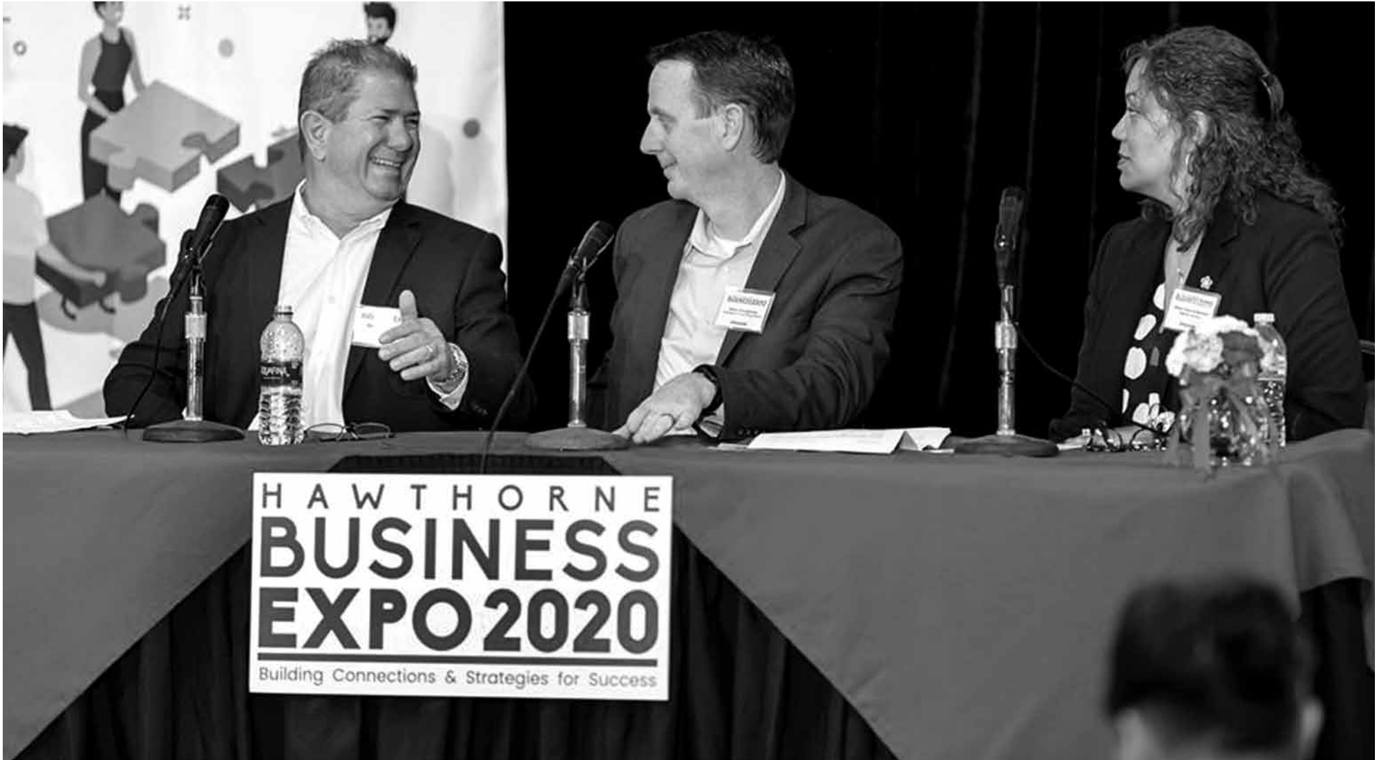
The Hawthorne Business Expo 2020 was held January 29th at the Hawthorne Memorial Center. Local businesses and professionals gathered for inspiration, education and connections. Product lines of many local businesses were on display.