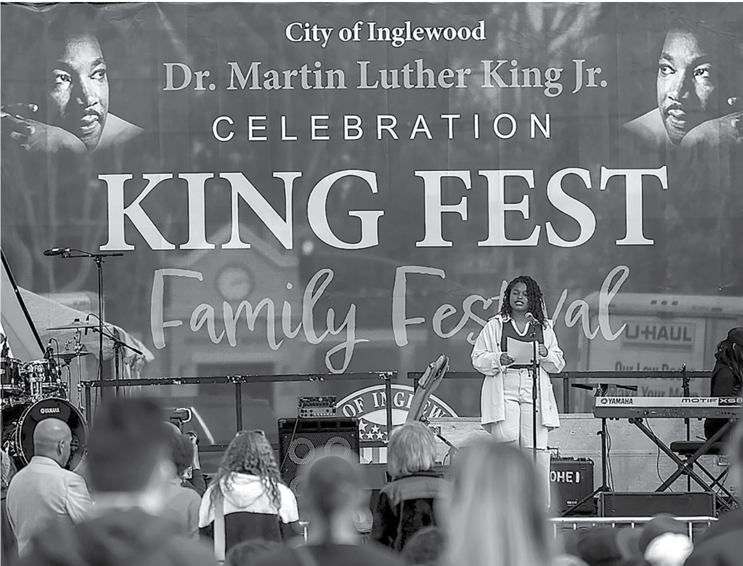
The City of Inglewood's 40th Annual King Fest was an amazing event. From the food to the music, it was such a great time. Thank you to everyone who came out to honor Dr. Martin Luther King Jr..