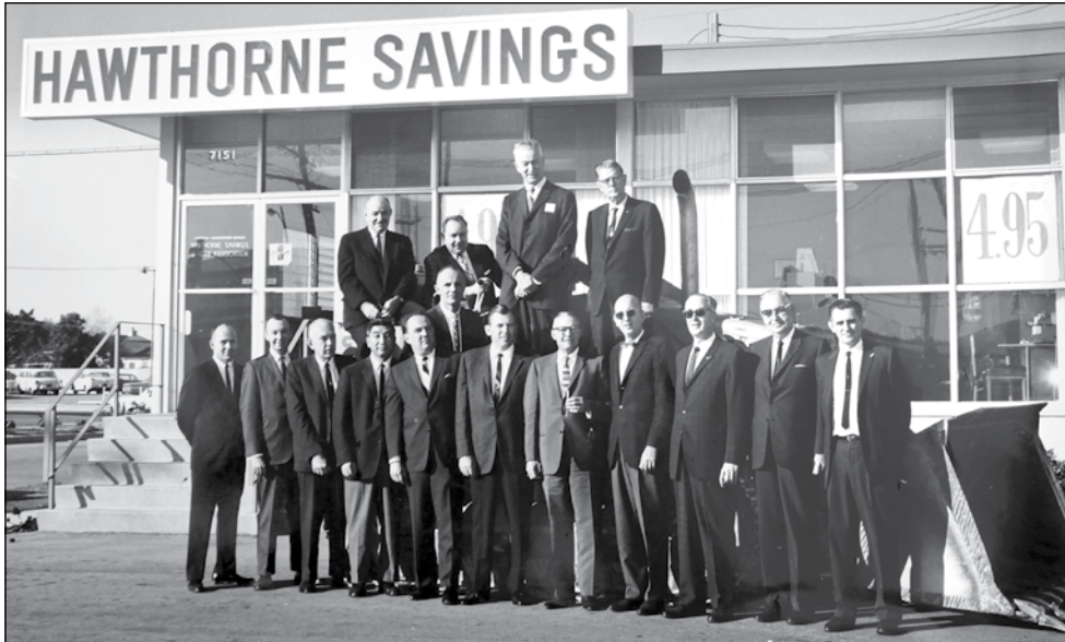
Hawthorne Savings: The Early Days.