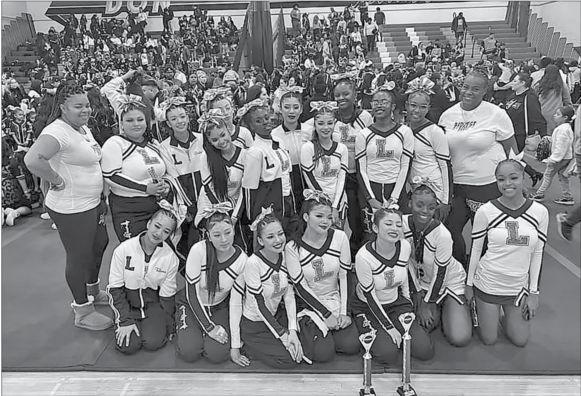
Congratulations to our Olympian cheer team for placing first in the novice category at SHARP Cheer Competition.