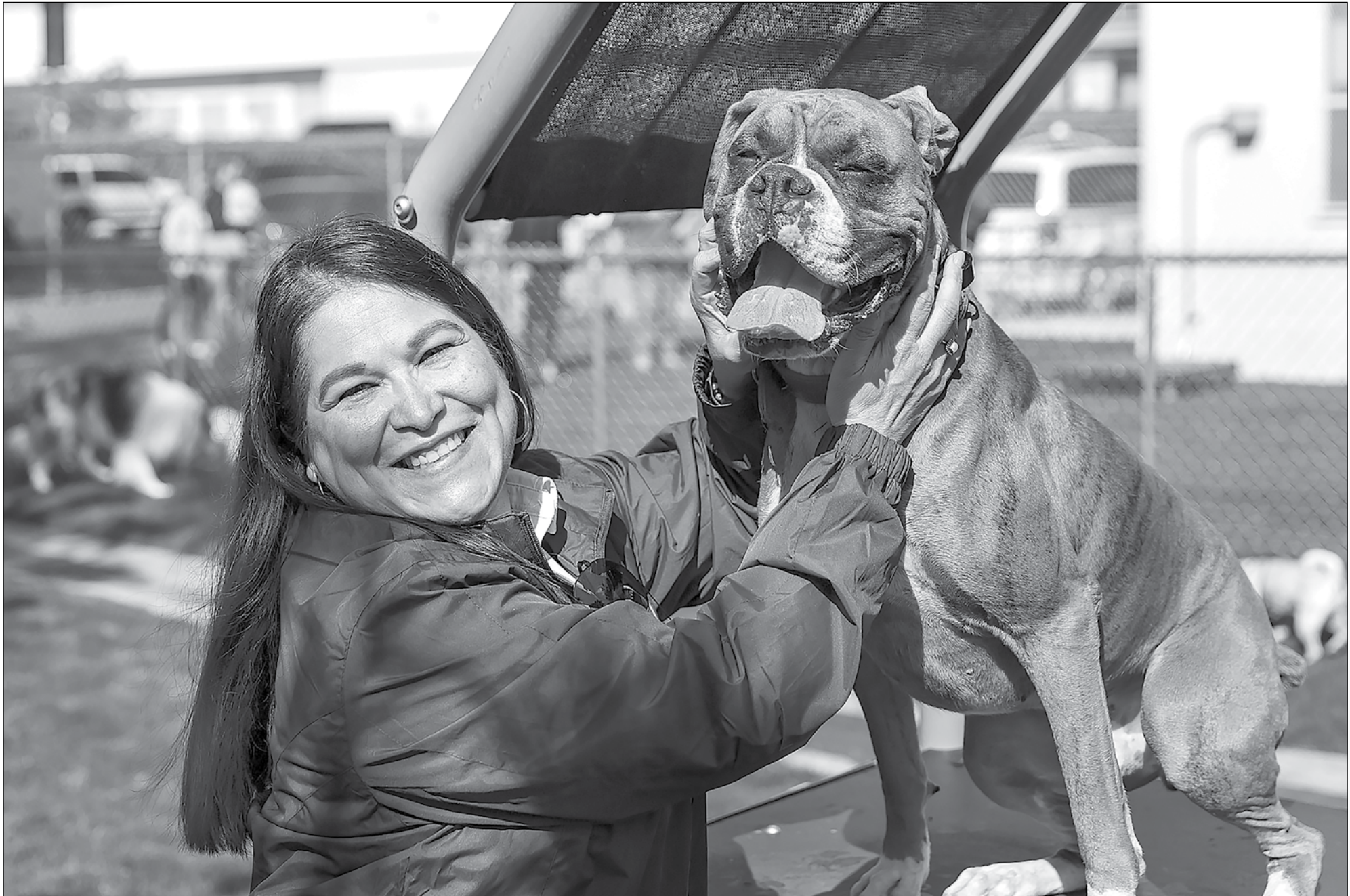
The City Of Hawthorne held a ribbon cutting ceremony to unveil Hawthorne's first ever dog park. This park is located at 3901 W. El Segundo Blvd. It features two different areas, one for big dogs and another for the smaller dogs. Bring your furry friends over to the dog park, and remember to please pick up after your pets.