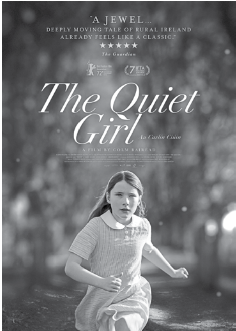
The Quiet Girl, courtesy Cinemacy.com.

Being neglected and denied affection and love is a tragedy that can keep a person from becoming, or even knowing, their best self. But having the fortune of receiving love is a gift that allows us to grow tall and full like a beautiful forest of trees.