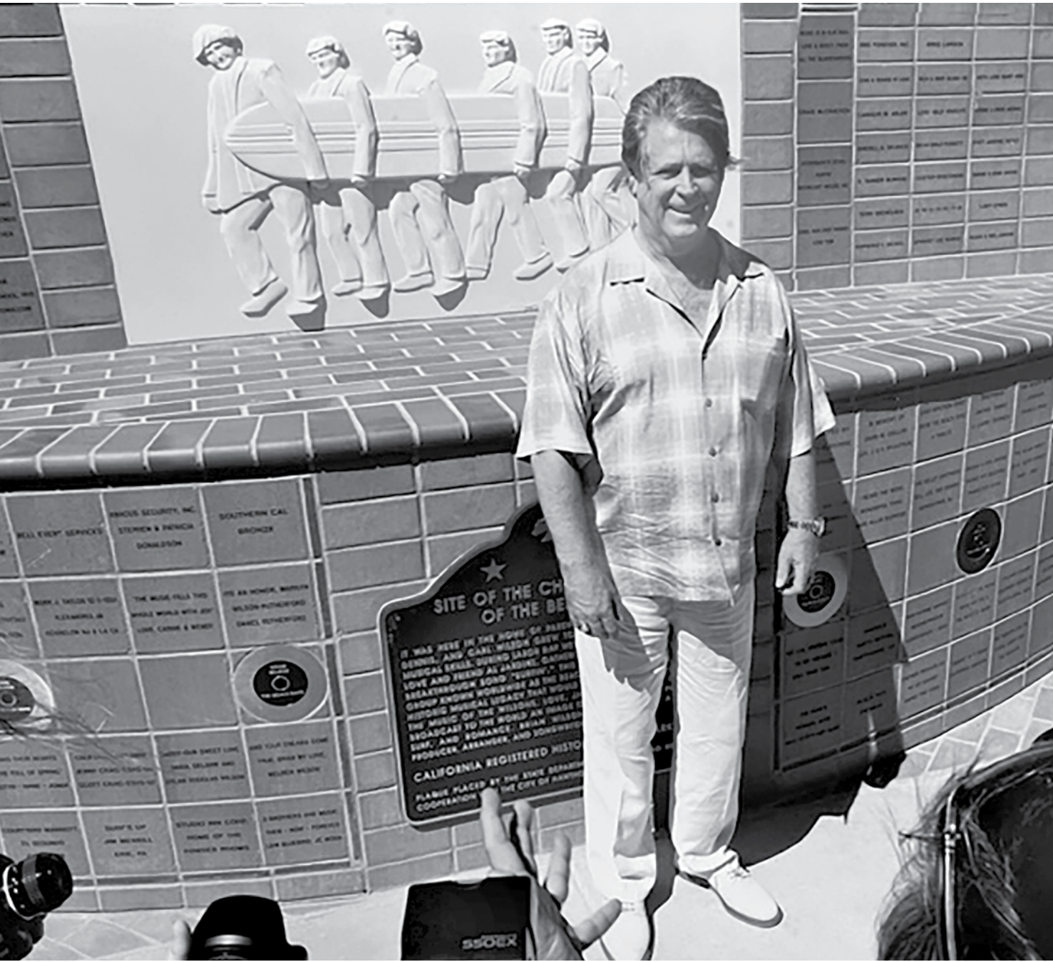
Brian Wilson at the Beach Boy Monument. To find out more about the monument see story below.