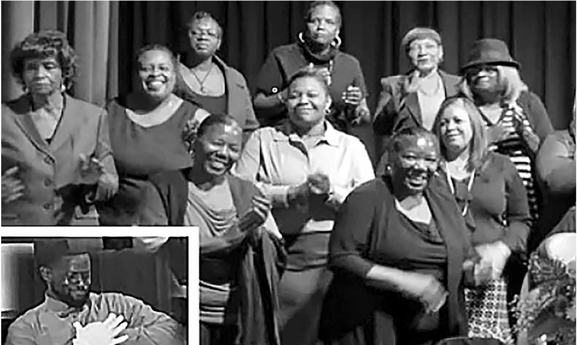
Lutheran Social Services of Southern California (LSSSC) - a leading provider of social services programs in Southern California – announces its first-ever Banding Together to Build Community Concert Series through April. The second of three concerts, featuring a wide range of musical styles, is on March 19 at Holy Trinity Lutheran Church in Inglewood. The concert starts at 3:00 p.m. with food trucks following at 5:00 p.m. Concert tickets are free but seating is limited so attendees are advised to register in advance. For more information, registration and donations visit https://www.lsssc.org/BandingTogether/, or call 714-621-5845. Holy Trinity Evangelical Lutheran Church is located at 9300 S Crenshaw Blvd in Inglewood.