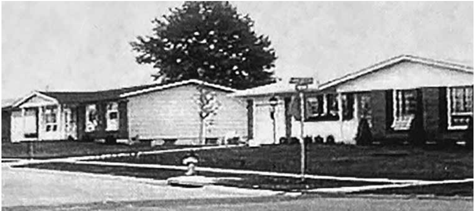
The Wilson House