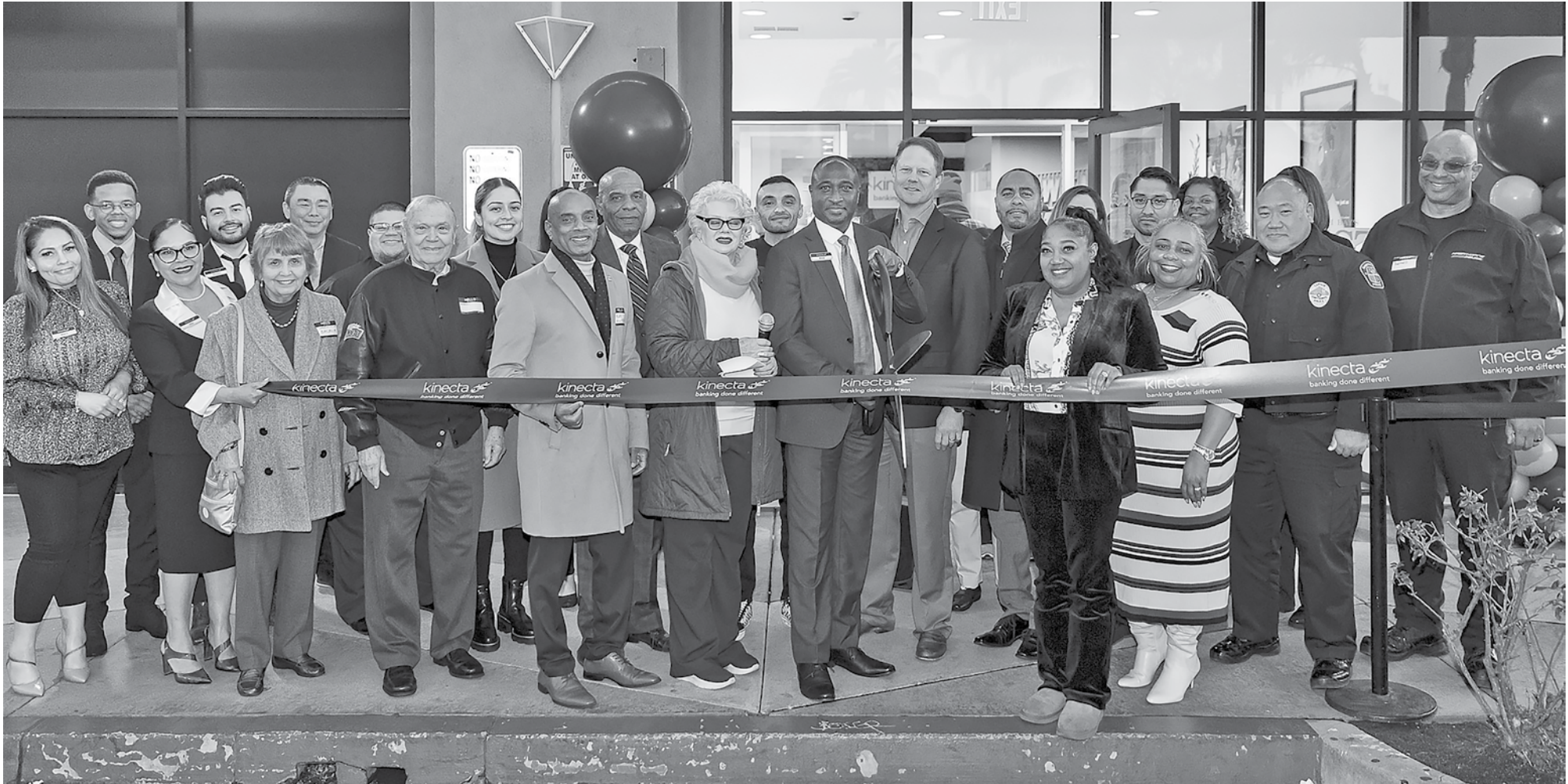
Kinetca held a Ribbon Cutting Ceremony to showcase their remodeled interior in their Hawthorne branch. Dignitaries, residents and customers, along with Kinetca employees were in attendance. The remodel took around 5-6 months for completion while the bank remained opened throughout the process. Kinetca Credit Union always goes out of their way to lend a helping hand.