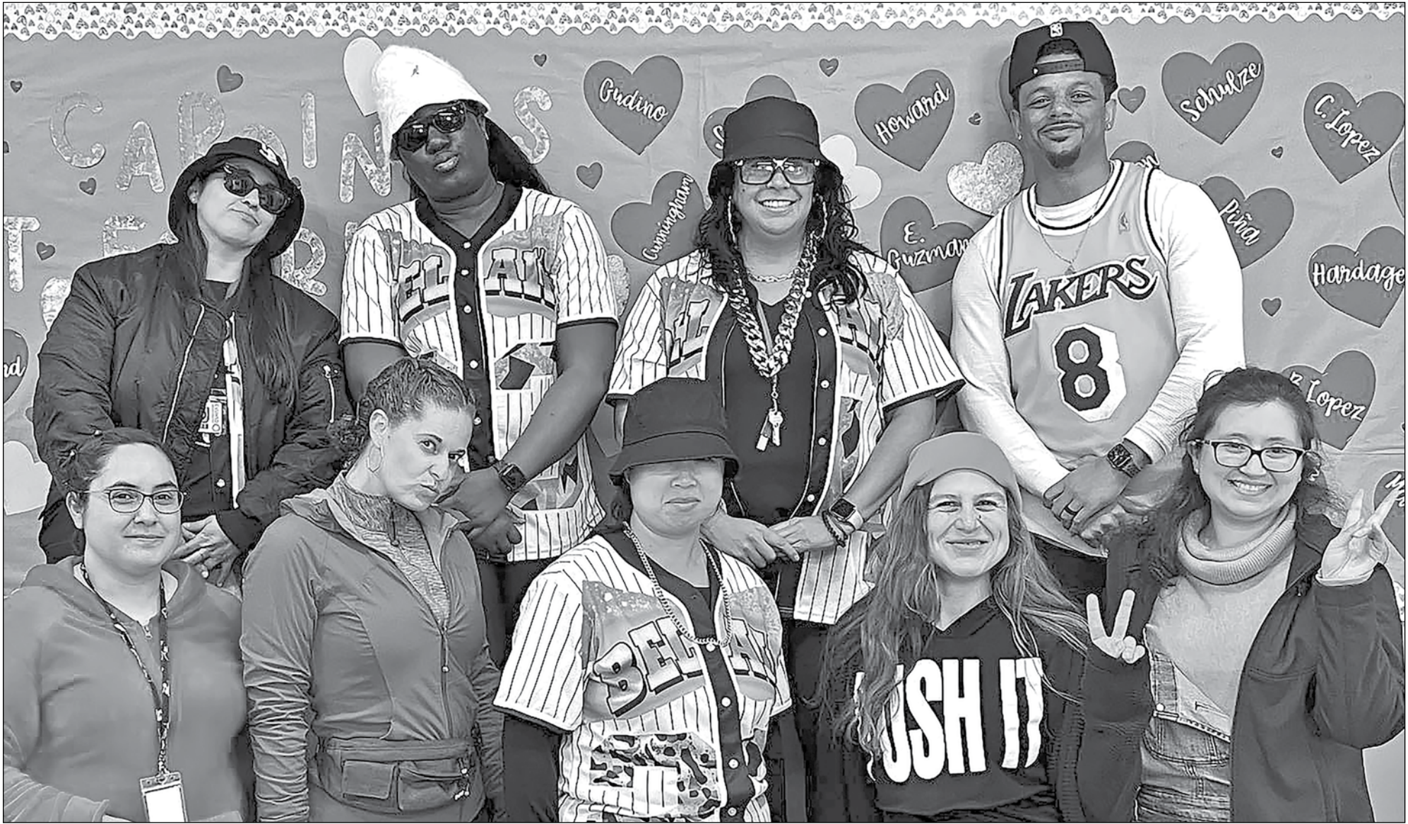
It's a Throwback to the 90's and 00's for Black History Spirit Week.