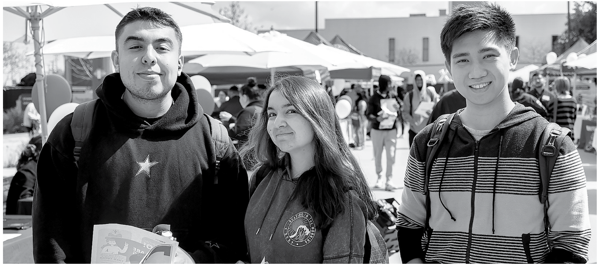
Thank you to all our Warriors who attended the Student Support Expo. We hope you enjoyed the free coffee and lunch. And a big thank you to the ECC support staff who helped students find resources on and off campus.