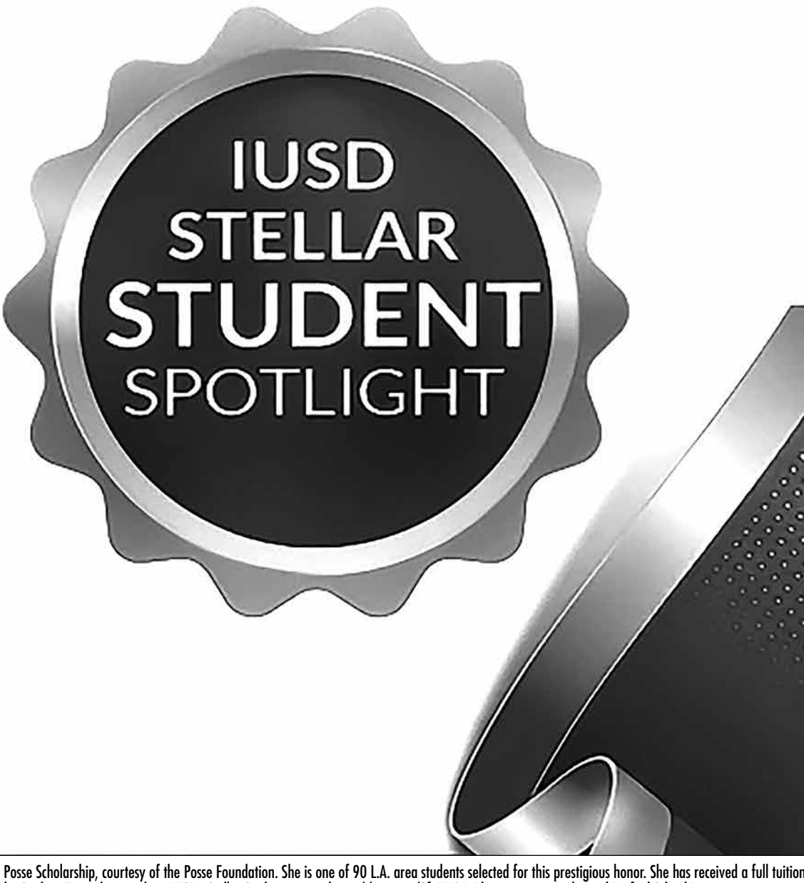
This City Honors International Preparatory School (CHIPS) senior boasts a GPA of 4.5, and is a proud recipient of the Posse Scholarship, courtesy of the Posse Foundation. She is one of 90 L.A. area students selected for this prestigious honor. She has received a full tuition scholarship to Kalamazoo College in Michigan where she plans on majoring in art or English with a concentration in Film Studies. To read more about IUSD's Stellar Student, go to: https://conta.cc/3faUU06.