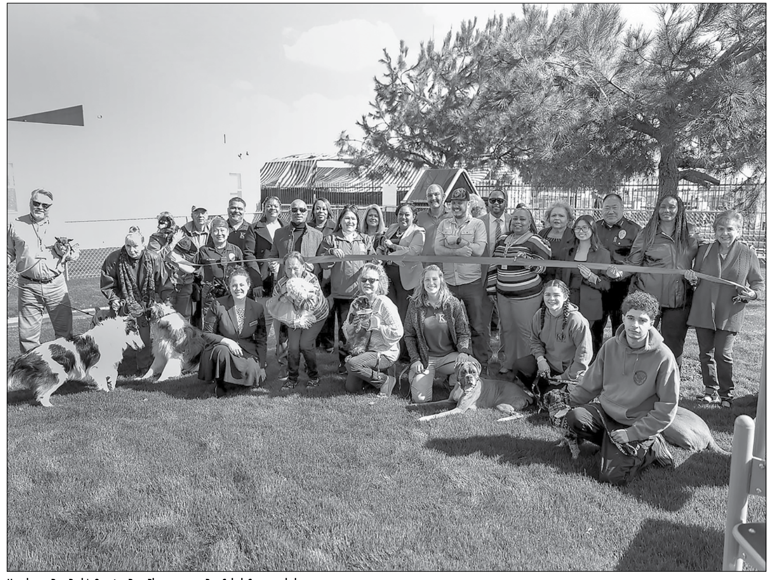
Hawthorne Dog Park's Opening Day. See story below.