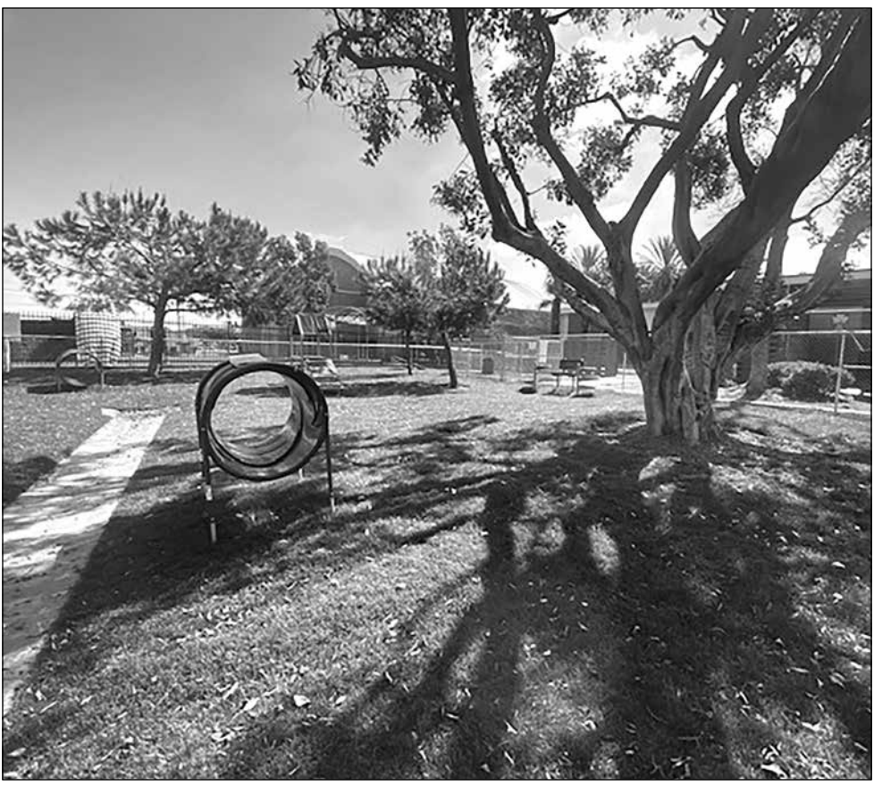
Large Dogs Area