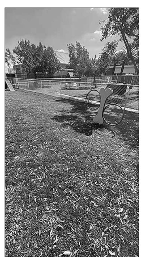
Small Dogs Area

All those who approve, please bark! Oh, gee, sorry, that could have just awakened the whole neighborhood! •