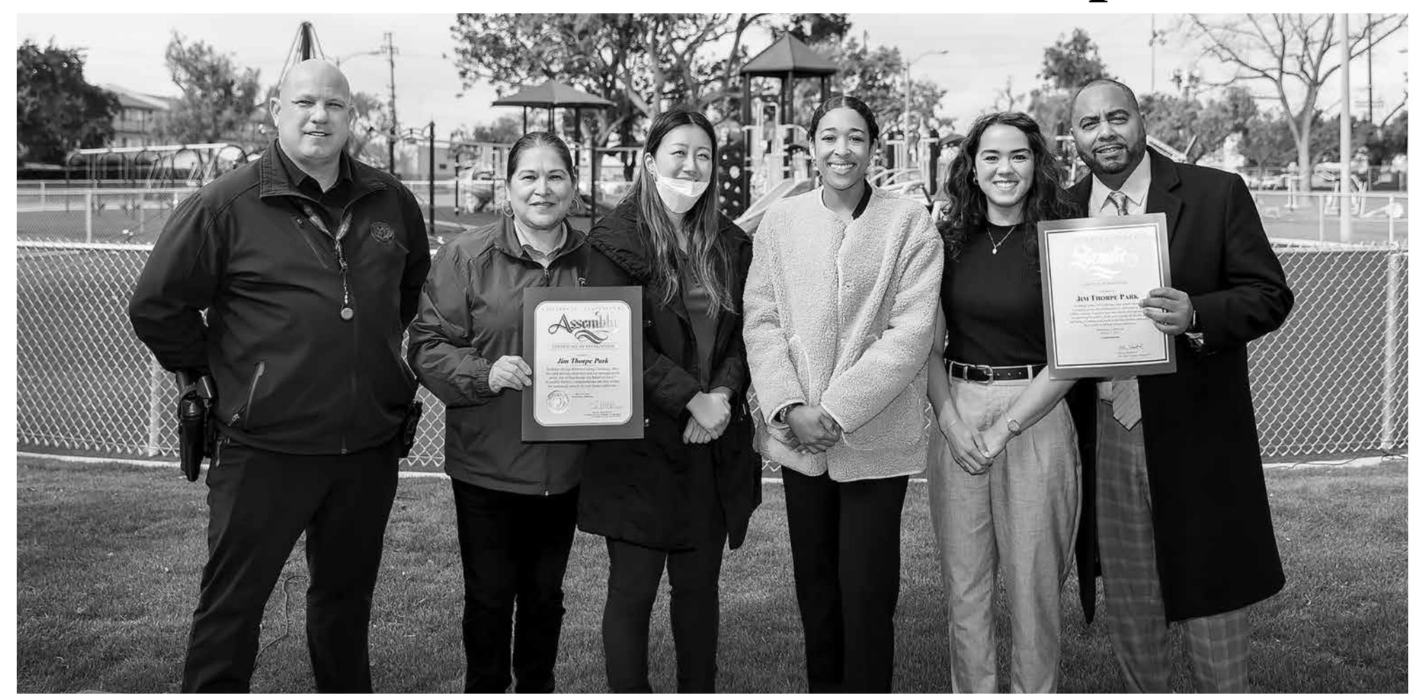
The remodeled park includes playground equipment for the kids with rubberized turf, new basketball courts, exercise machines, new BBQ pits with a giant sun shade and benches and so much more. This project was funded by prop 68, Measure A and Development Impact fees. Total project cost was about $1 million dollars and took 8 months to complete.