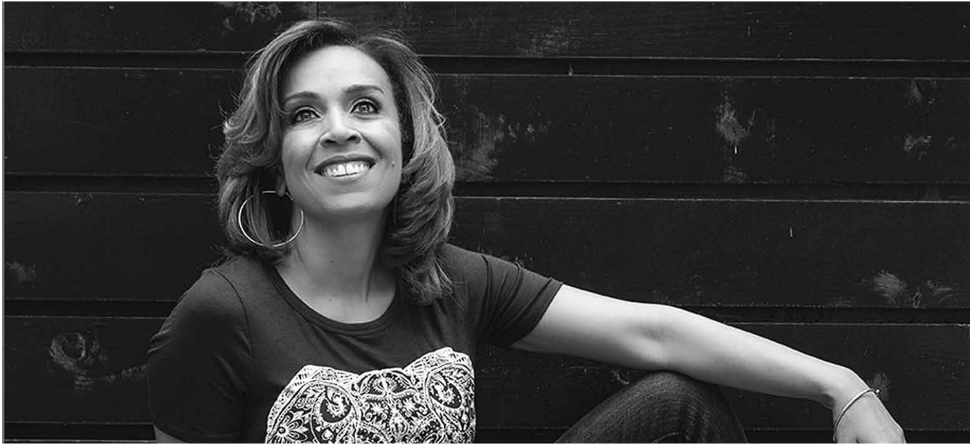
Dominique, from KJLH's Front Page with Dominique DiPrima, spoke with Inglewood Mayor James Butt about his plans to help out the city of Inglewood during the coronavirus outbreak. The interview can be heard on the City of Inglewood's Facebook Page.