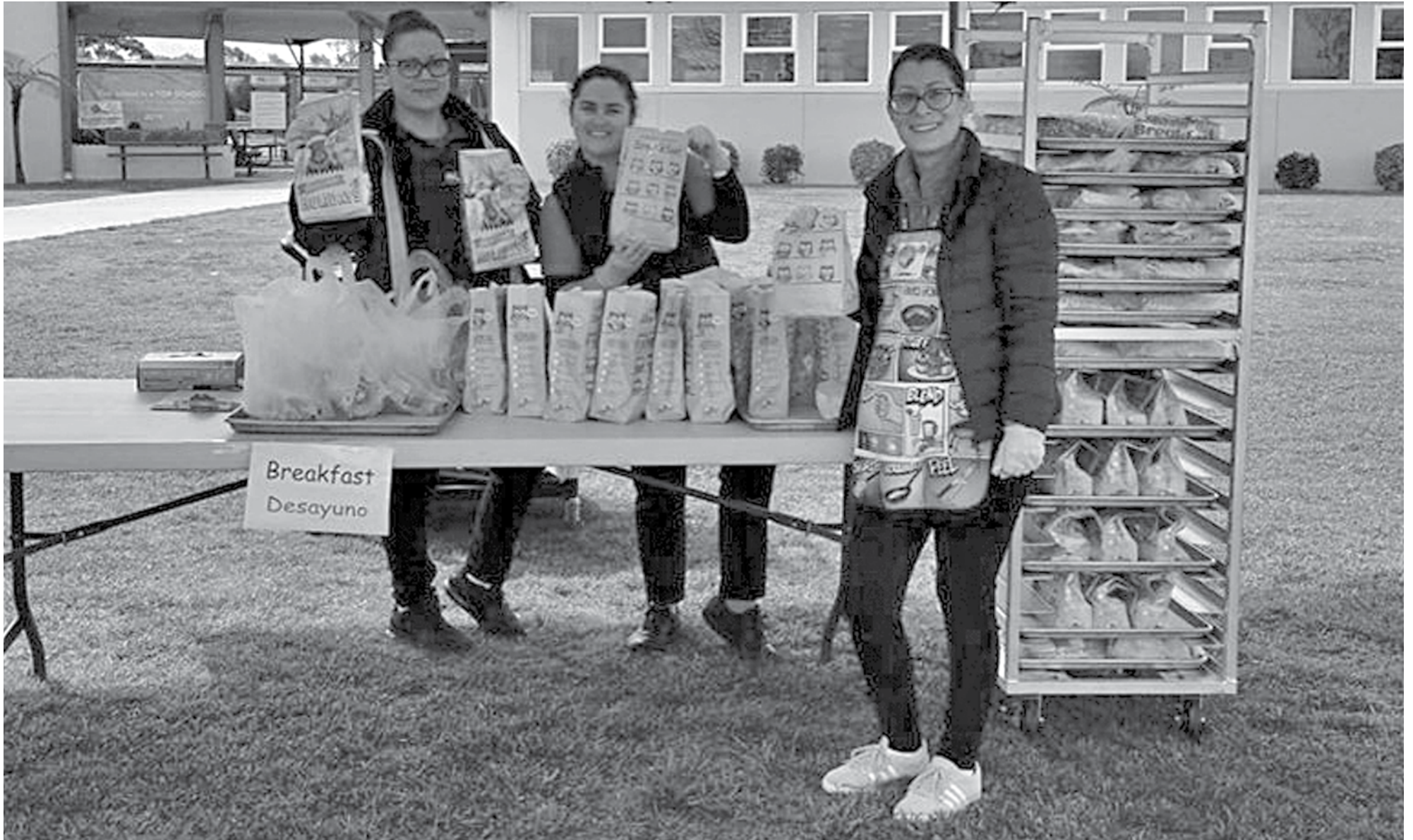
8,506 breakfast and lunch meals were served last week to the community. We are so grateful for the wonderful school district staff who helped prepare and distribute meals.

"We want kids to value real food and understanding that it isn't just about feeding people but about nourishing the body, the community and the planet."