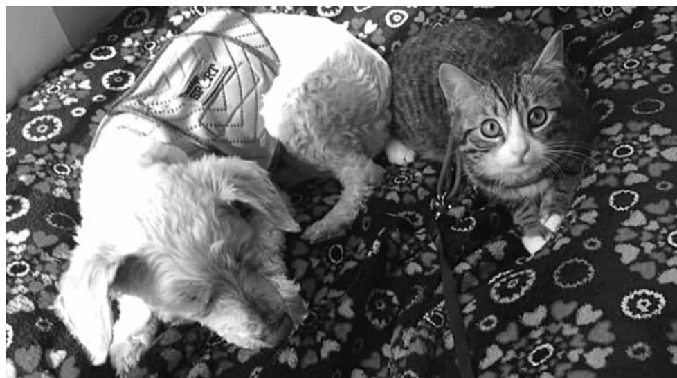
Birdie (left) and friend

Leonardo da Vinci is an awesome little boy. He is the perfect combination of playfulness and affection. He enjoys playing with his siblings and his toys. Leonardo also likes to lounge on your lap, climb up your shoulder and just hang out there to be close to you. He gets along well with other kitties and is good with children too. After being rescued from a high kill shelter, Leonardo hopes his luck continues to find his forever home where he receives lots of love and happiness. Being