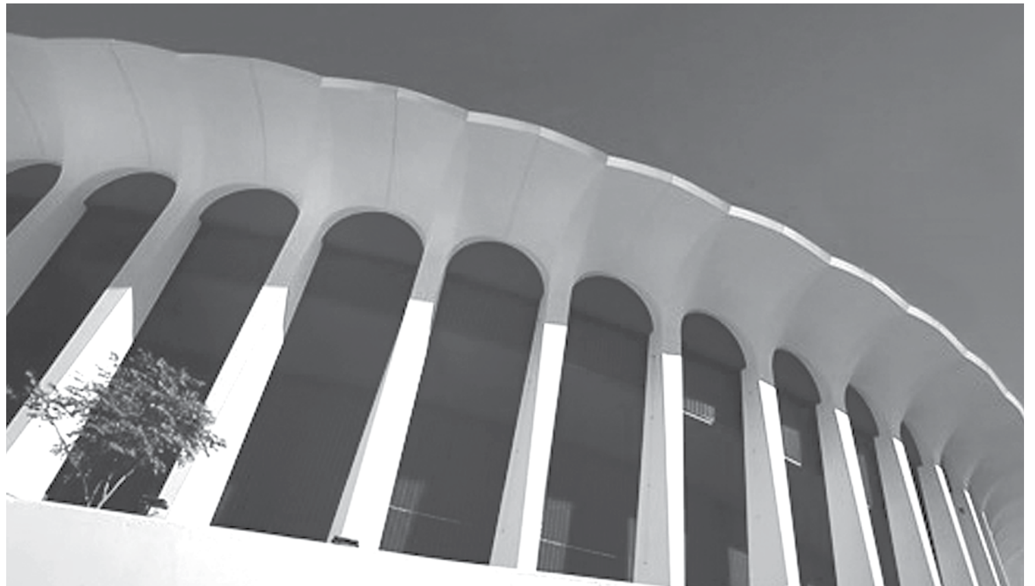
In a deal that ends a long-running legal war with an opponent that had long fought to block construction of a Clippers arena in Inglewood, team owner Steve Ballmer on Tuesday reached an agreement to purchase the Forum from Madison Square Garden Co. for $400 million in cash.