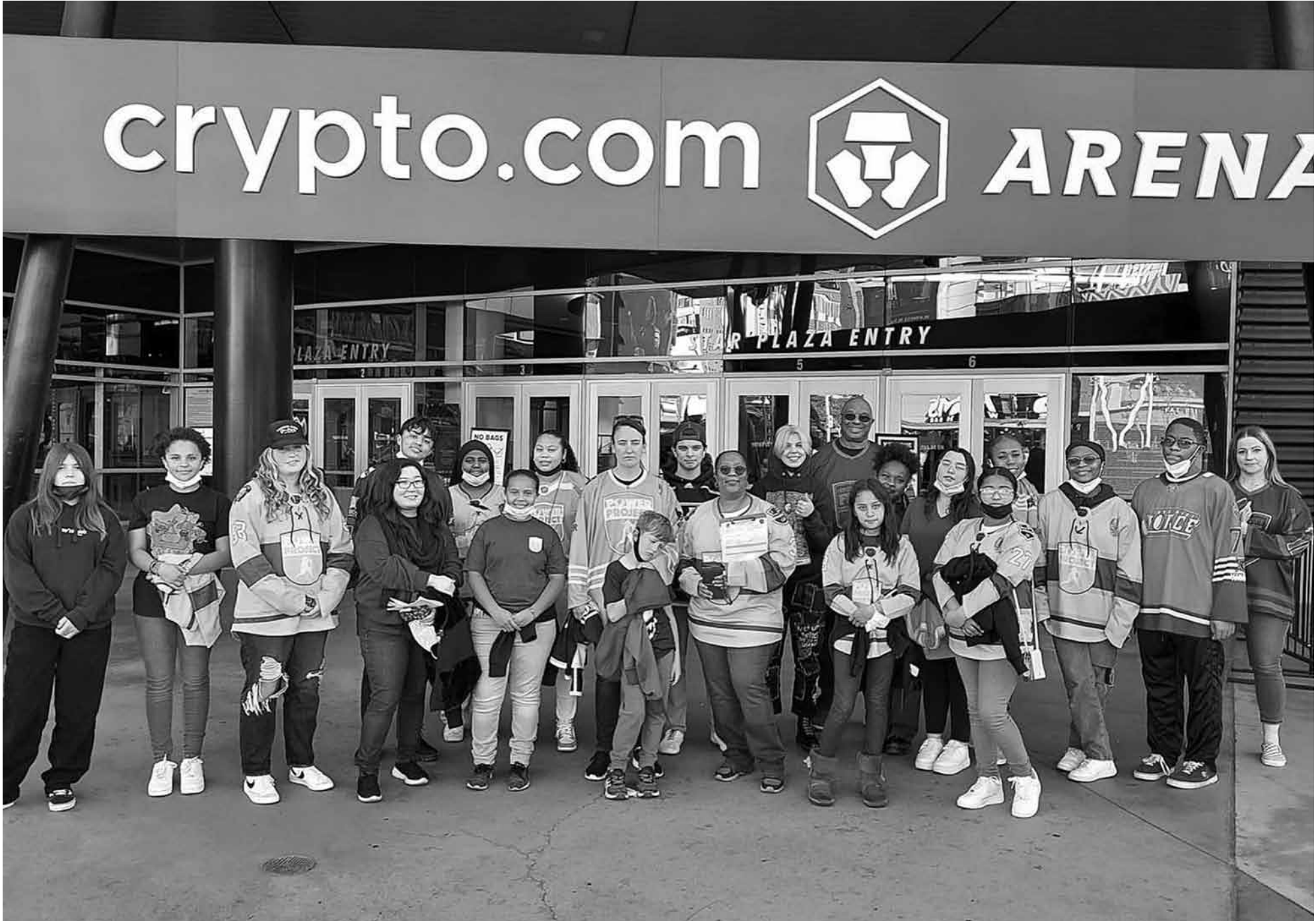
The Power Project had the privilege to celebrate gender equality month with the LA Kings. They got to hear a panel of trailblazing women speak about their pathway to achieving success in their careers.