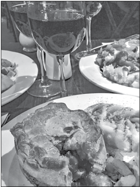
Steak and Ale Pie at Ye Olde Cock Tavern on Fleet Sreet.

You should never hold a country’s institutional food against it, but after four years of boarding school, we can certify the English version as downright horrifying. We won’t go into detail, but take the dismal British reputation, multiply it out several times, and you start to approach the twilight zone on the other side of a culinary wilderness. An allowance of £5