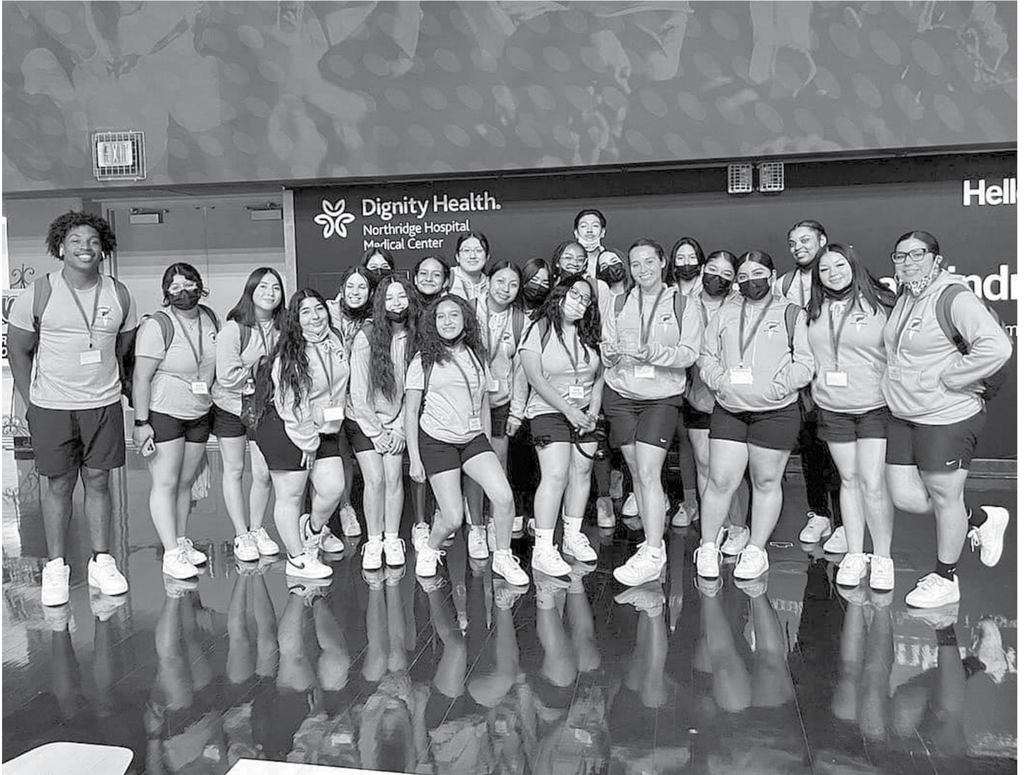
Congratulations to our Lawndale High School Biomedical Careers Academy (BCA) Sports Medicine students for winning 4th place in the AACI California Regional High School Sports Medicine Competition. Great job.