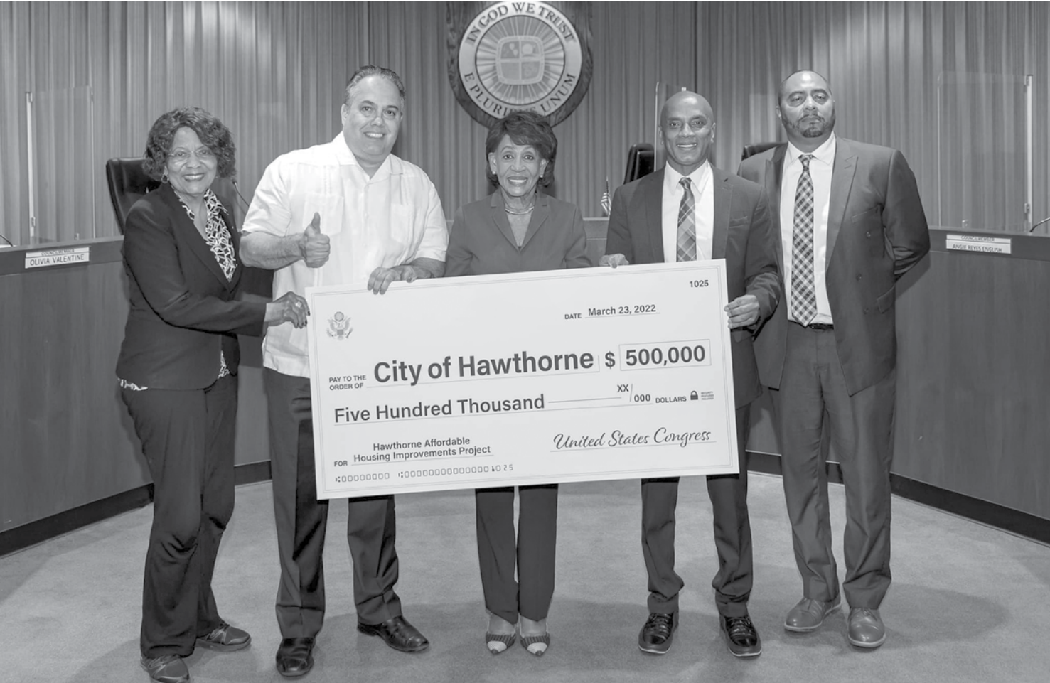
Congresswoman Maxine Waters came to Hawthorne to deliver over $1 million dollars to the City of Hawthorne. $500,000 went to the Hawthorne affordable housing improvements project, $500,000 to the South Bay Workforce Investment Board - SBWIB and over $235,000 went to the VFW Post 2075 rehabilitation project.