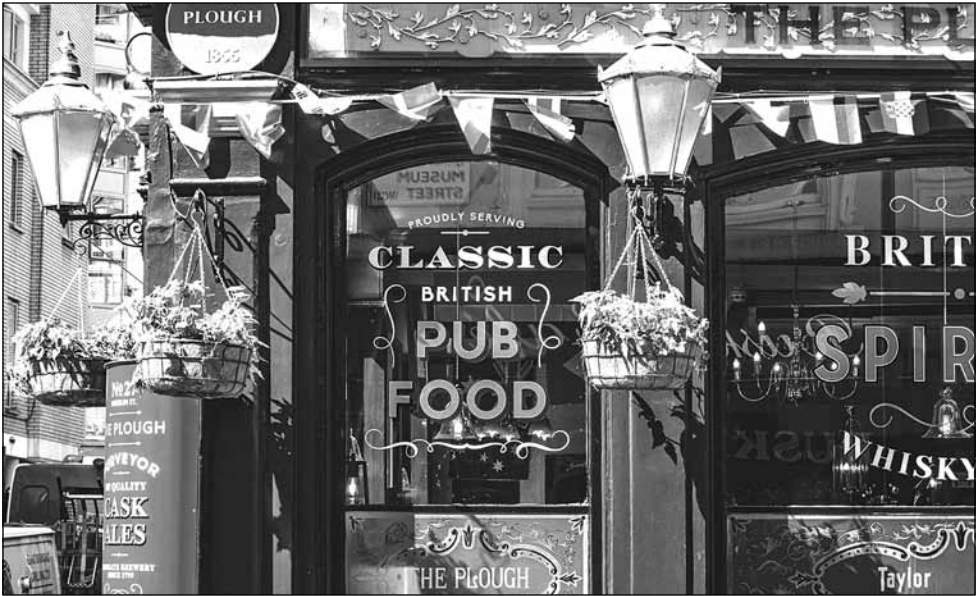
Don’t believe the “Classic”. If they served it, you wouldn’t eat it.