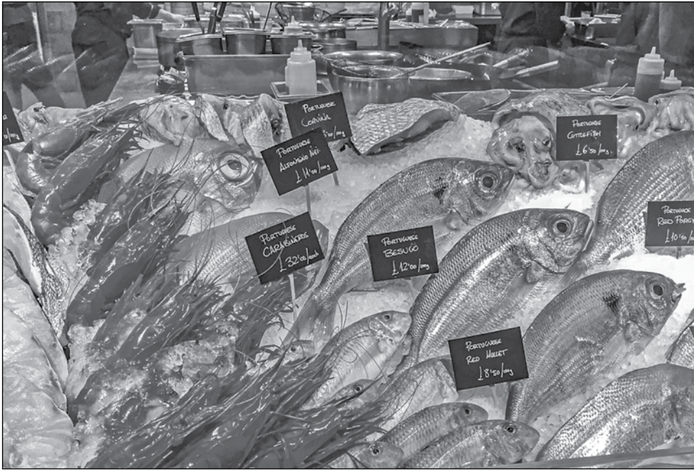
The fish at Novikov in Mayfair.