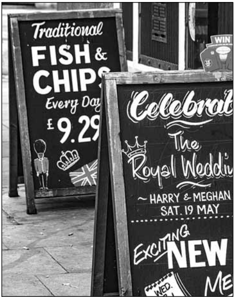
Oops! But at least the Fish and Chips are tasty.