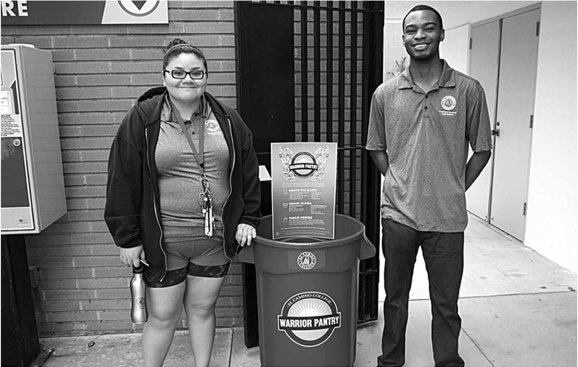
The Warrior Pantry is now offering drive-through and “Grab & Go” Service on Tuesdays and Wednesdays from 11 a.m. – 2 p.m. to eligible students. Pre-packaged bags will be filled with food items and toiletries. Sign up for more info: https://bit.ly/3biimp5