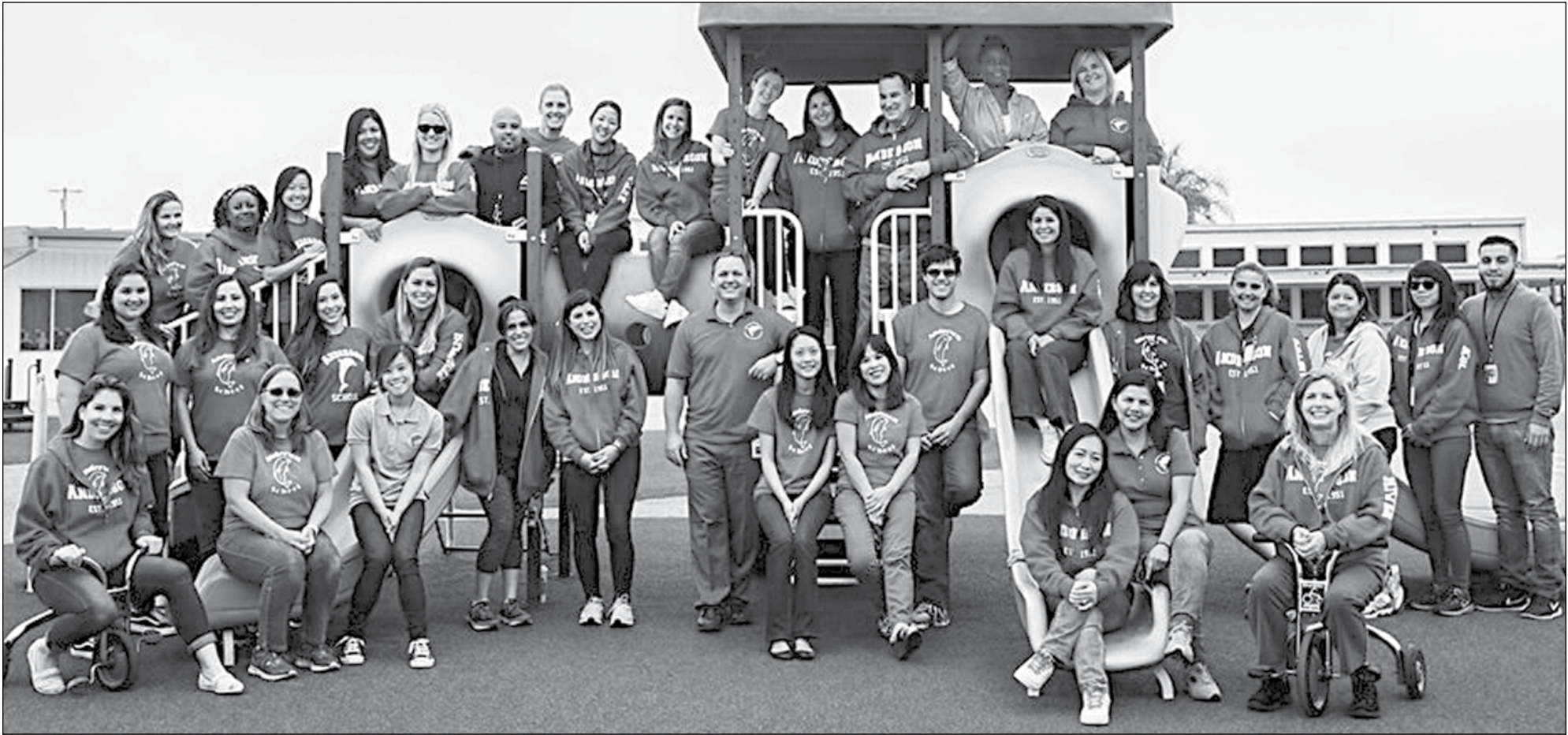
William Anderson Elementary continues providing instruction through distance learning to students at home. The school uses a variety of platforms and tools, such as Zoom, Google classroom, YouTube and Class Dojo to help students stay on track with their education.