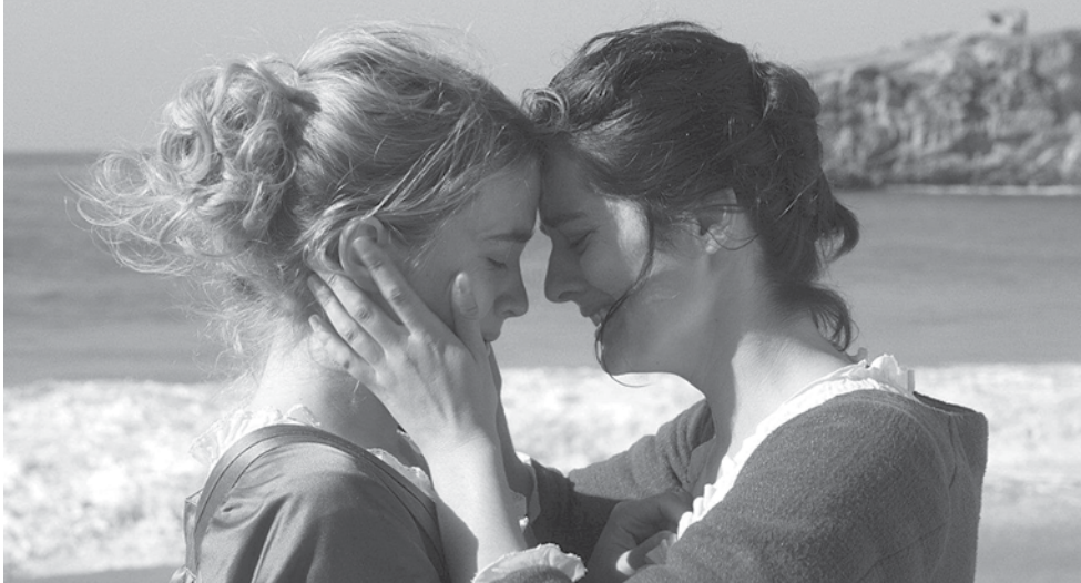
Portrait of a Lady on Fire

only has four characters, which in some interpretation could align with each element. Like great visual art, there is a clear story to be told upon first glance, but with further scrutiny, more significant themes continue to bring themselves to the forefront. Fire is the most ostensibly visible element, especially given the title. In this pre-electricity era, nearly every shot has some fire lit, and Marianne’s arrival on the island sparks both a literal and metaphorical flame that burns through the rest of the movie. There is a visual warmth here that absorbs us for the entire runtime. And yet, I would