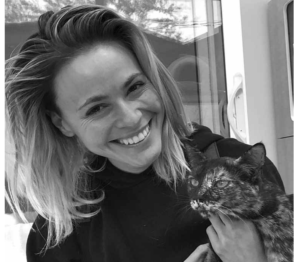
Minerva with her new mom

When you adopt a "pet without a partner", you will forever make a difference in their life and they are sure to make a difference