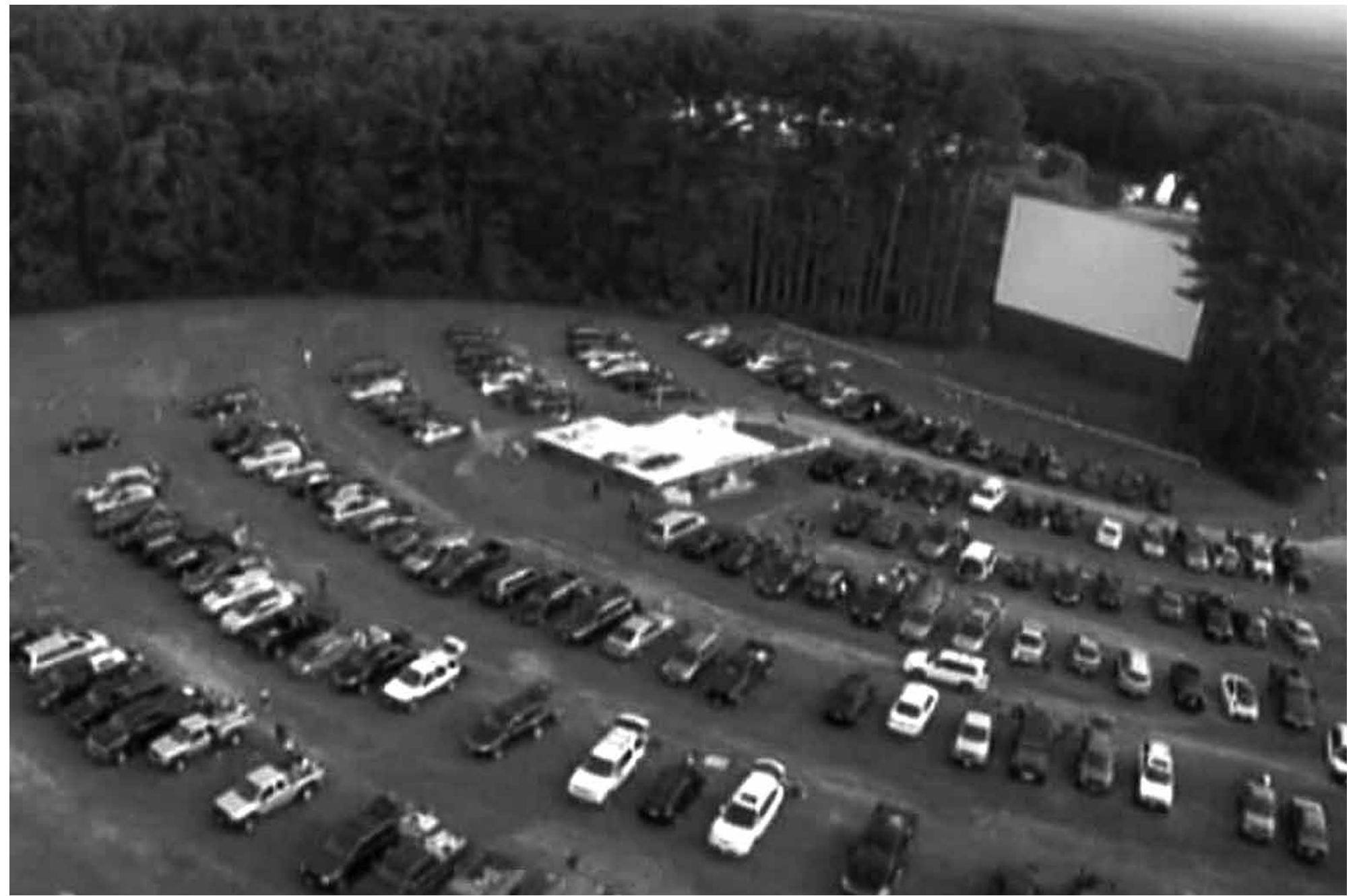
This might sound crazy, but... instead of canceling Graduation Ceremonies why not hold them at a Drive-In, separate families can stay in their car and not possibly infect others, and use the large screen to project videos, the names of the graduates and other pertinent information. Just an idea.