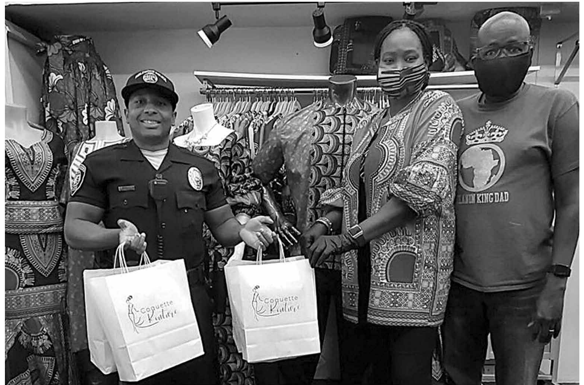
Thank you CoquetteKouture for your donation of 100 masks. You are helping keep our officers safe while serving the community.