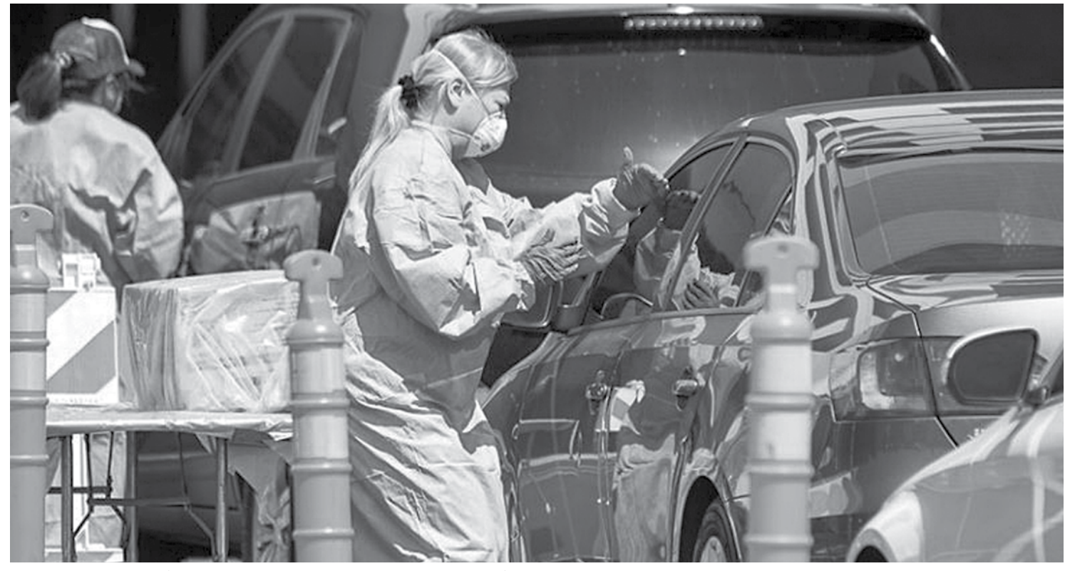
A drive-up mobile testing site for COVID-19 opened at the South Bay Galleria on April 3, one of three locations that opened, bringing the County's total to 10. Los Angeles County residents who scheduled an appointment online were administered oral swabs to test for COVID-19.