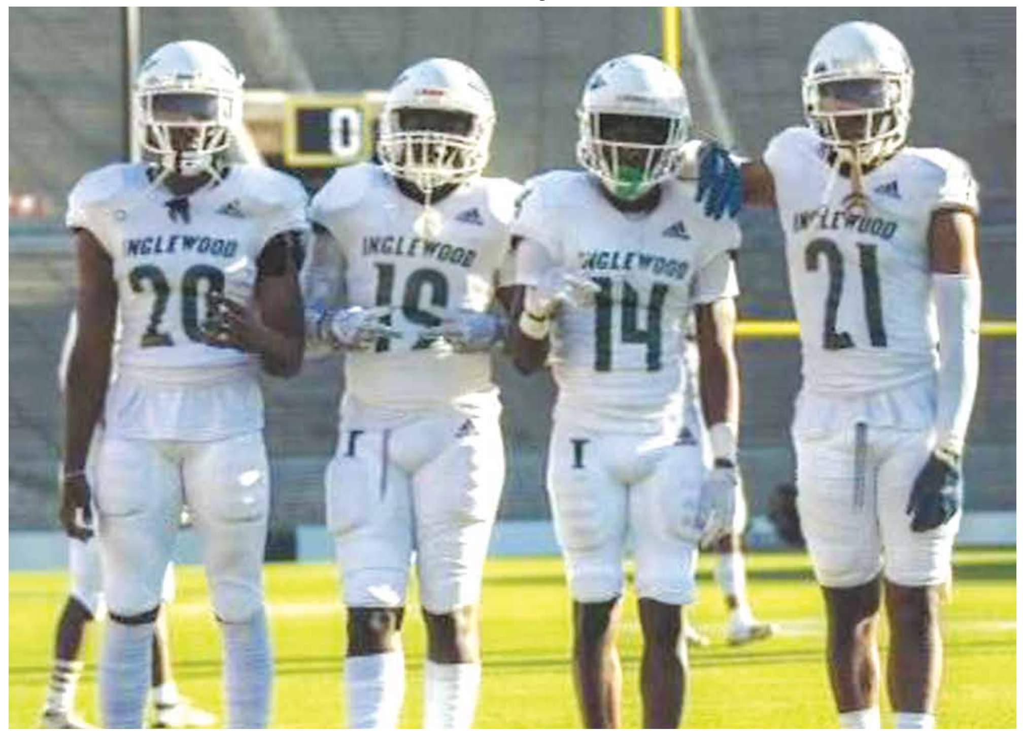
As Inglewood Unified School District continues to prioritize safety and wellness, they are so proud to highlight Inglewood High School (IHS) Sentinels Varsity football team as they dominated the field during the game at the Rose Bowl in Pasadena against John Muir High School. The Sentinels lit up the scoreboard, defeating John Muir High School with a final score of 70 to 14. Go Sentinels.