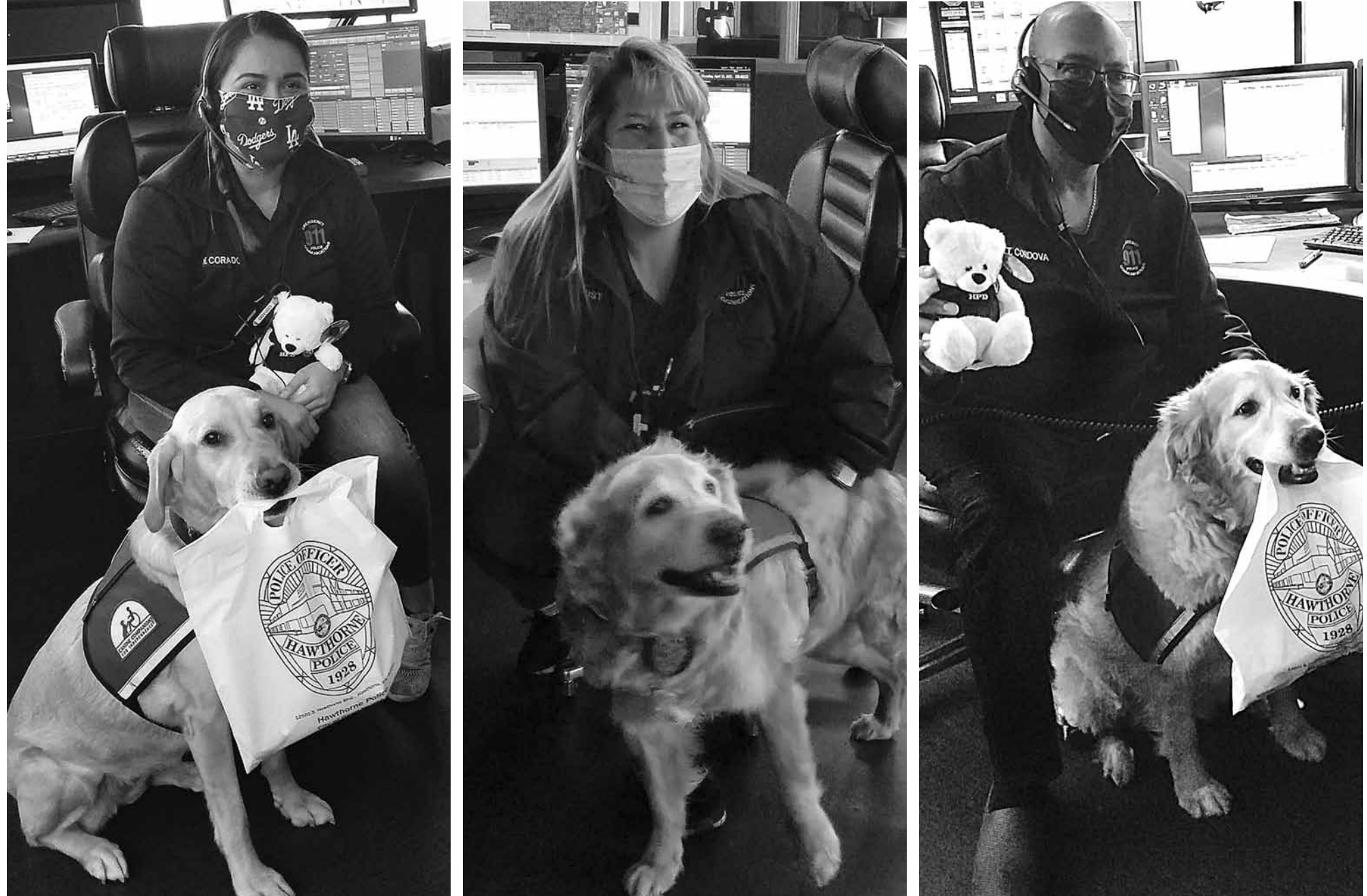
Breakfast, gifts and huggies for our dispatch family, from K9 Scottie and Thyme during National Public Safety Telecommunications Week. Our Public Safety Dispatchers are the first line of contact for many Hawthorne residents and help create the positive reputation and image the Department enjoys. We would like to honor the men and women who perform telecommunications duties and serve as an essential link between our officers, the public and vital support services. Thank you to all Public Safety Dispatchers.