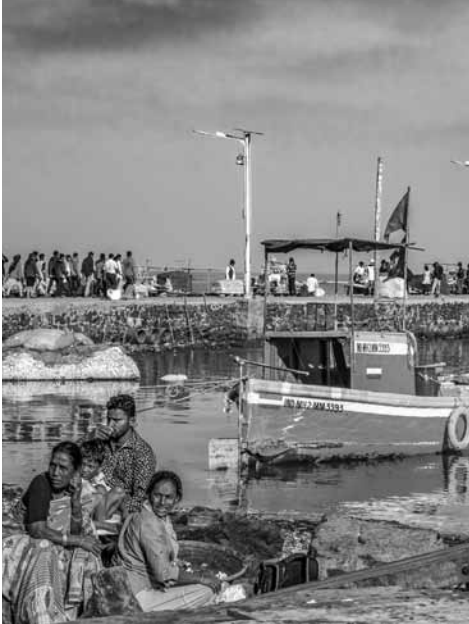
A visiting family rests at the foot of the Haji Ali Dargah. day, those domestic tourists naturally want to take pictures with the most exotic sights in town—and often that happens to be you. On a bus or a boat, in a crowded Muslim market or an exotic Hindu slum, in a cinema or on a monument, people check quickly for a

petals strewn across your floor every night. Outside the hotel gates lies an entirely different world, and yes, you do need to pay attention there. We usually arrive at New Year's, and so do more than a million celebrants from the Maharashtra countryside. At night, in the darker streets, colonnades, and arcades, you have to tread carefully, lest you trip over a sleeping family. During the