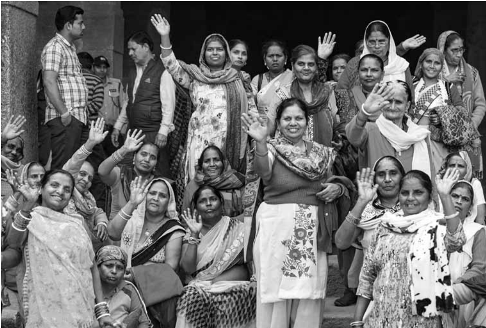
Best friends forever on Elephant Island. westerner's reaction. Long gone are the days when Memsahib could get away with a sniff of disdain or a whelp of disapproval. You're a guest in these parts, and the last thing anyone needs is your opinion on anything—even if they seem to be asking. When they don't find a hint of judgment in your features and body language, people go back to what they're doing and ignore you. A few experiences bear relating in the context of East-West cultural exchanges: One morning on the crowded Sassoon Docks—which double as a key fishing depot

the street. Eventually, we let her take us to a local tailor, where they did indeed make us a beautiful custom linen shirt in two hours. She squatted in the entrance until we paid up—ridiculously cheap by American standards, outrageously expensive by Indian—and she received her commission. The point being, that this was not a scam. It was just a different and very common way