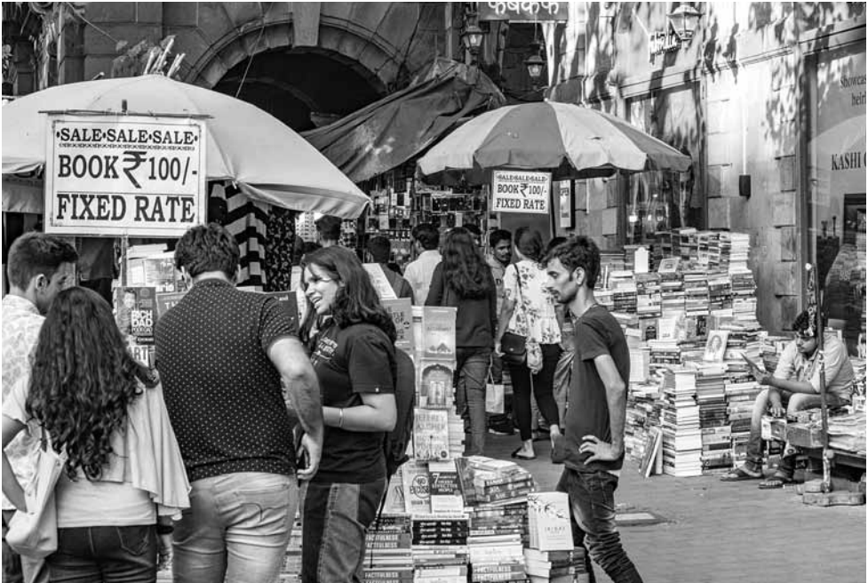
Fort District—how many cities still boast an overcrowded book market? And then, on our last day in Mumbai, we had three hours before heading out to the airport, so we went to a Colaba restaurant for lunch. On the way, a very sweet old woman heaved off a step and started a conversation. Like most Mumbaikars, she was plainly, but immaculately dressed, although she had an issue in one eye that was a bit disconcerting. She started out with general conversation, then insisted that her “son”, a local tailor, could make us a shirt for almost nothing before we took off. We refused and went on to lunch, but when we came out, she was still working

every Indian car we'd seen, they had their windows locked and hermetically sealed, and looked quite horrified at the depths of the Asian poverty they imagined they were experiencing. The rest of us found it both humorous and embarrassing, and we felt sorry for them. They reminded us of a man who once told us he'd never visit the third world because of the target indelibly printed on his American back. We couldn't have agreed more—in his case anyway. From the Docks, we headed out onto the Colaba Causeway and got in line at a bus