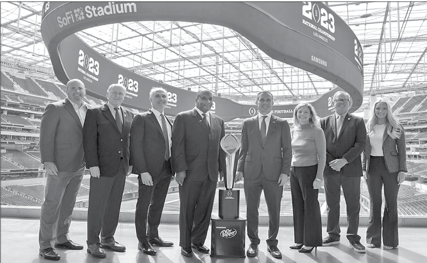
The game, on January 9, 2023, will be the 5th college football title game in LA in the last 20 years. Any projections of who will be playing in the big game?