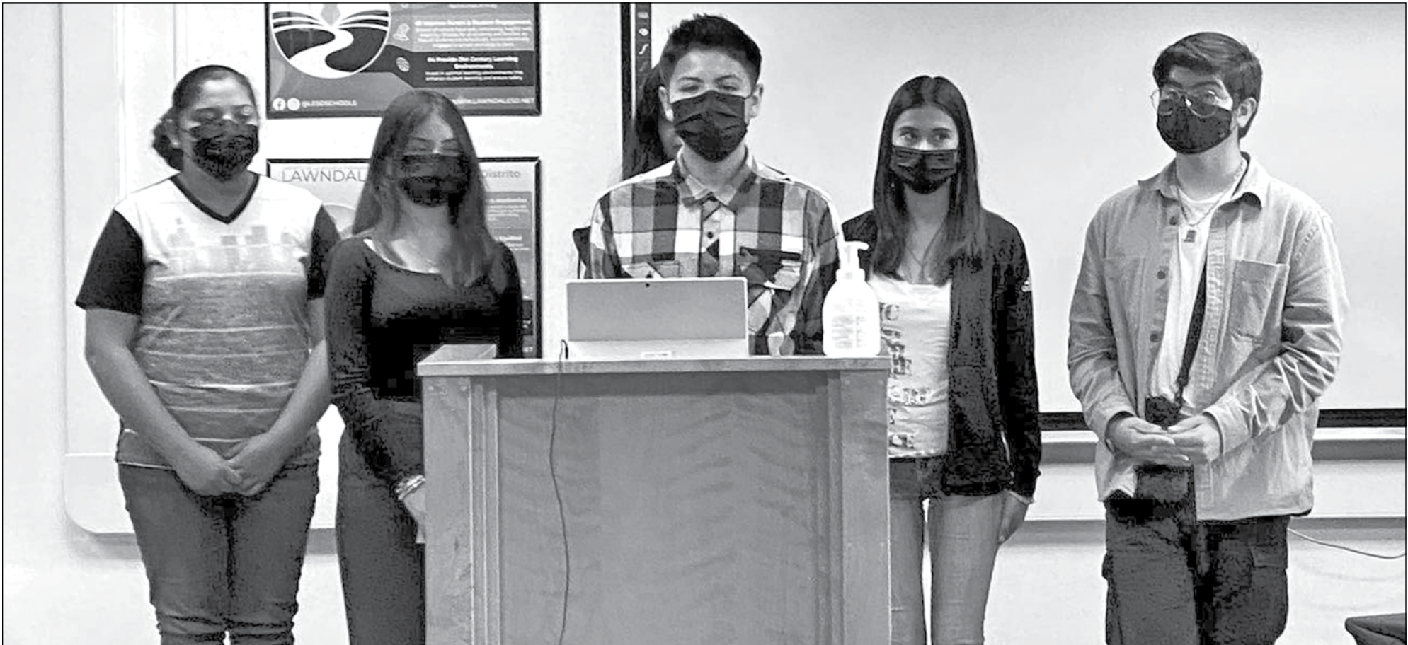
Let's celebrate our students who gave a presentation to the Board of Trustees. Students shared how they encourage peers to use the water stations and the benefits of water consumption. The future is environmentally conscious and we are here for it.