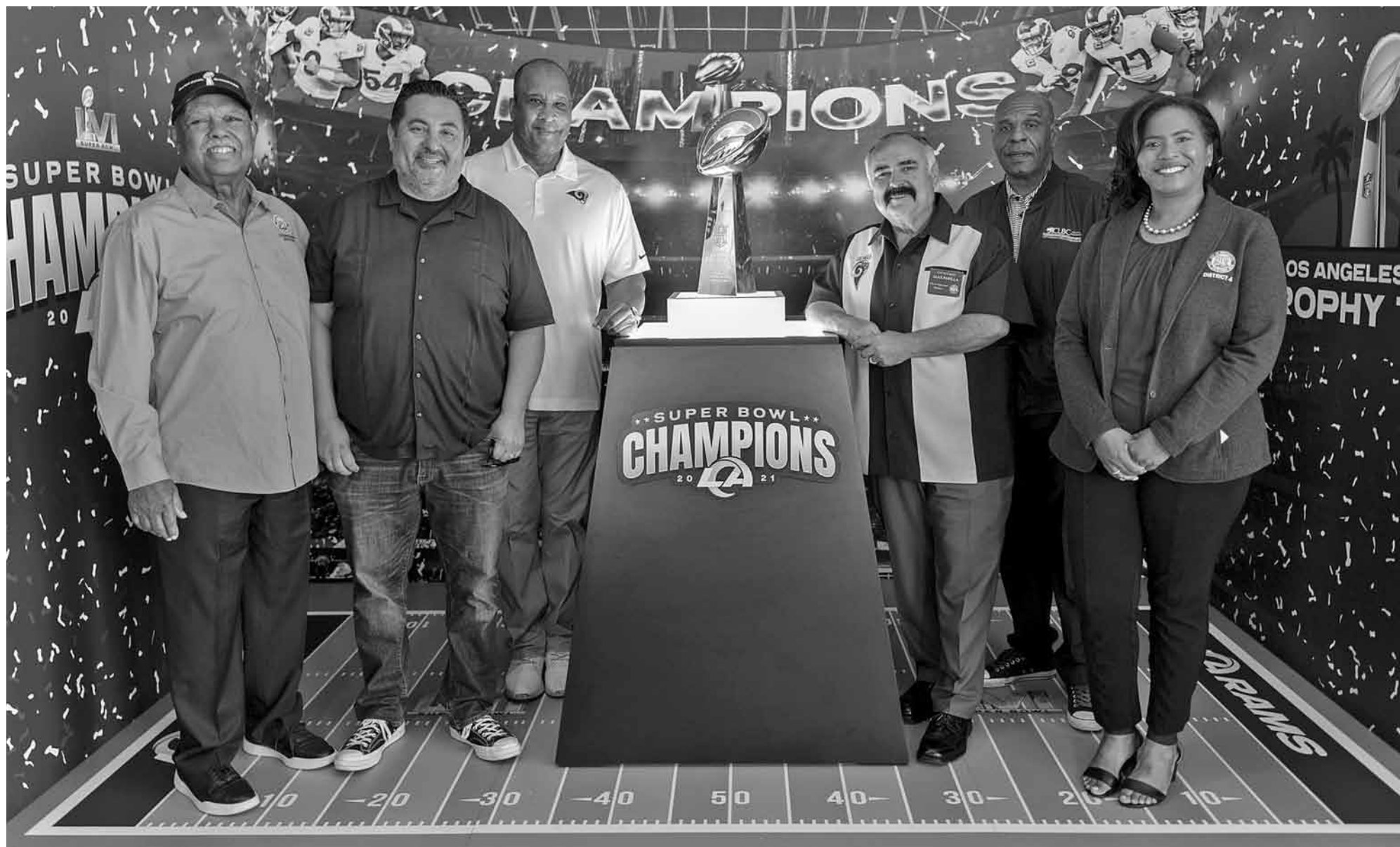
Over the weekend, the Lombardi Trophy visited the Inglewood Center and fans were offered the opportunity to take photos with it in celebration of the Los Angeles Rams taking home the championship during Super Bowl LVI. Still pretty unbelievable.