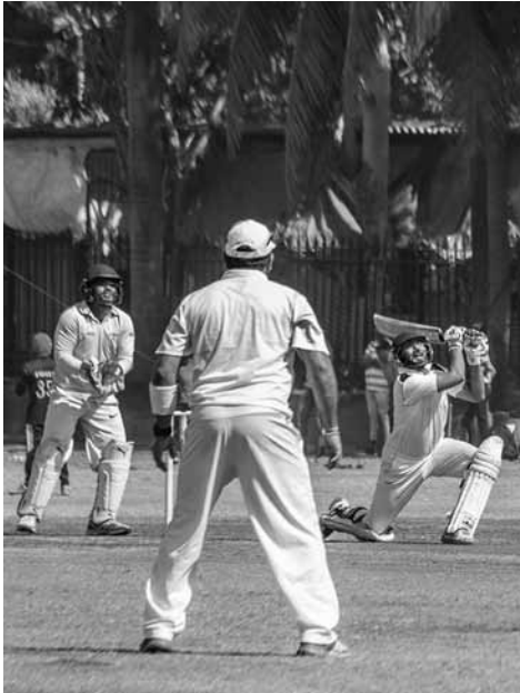
Cricket on a sunny January day on the Oval Maidan. of them stayed with us, jabbering helpful hints and pointing out photo ops in Hindi, while pretending to understand our English replies. Halfway through our walk, a Land-Rover appeared with a load of American passengers we recognized from our hotel. In contrast to

and home for around 1,000 souls—we acquired a flock of children cheerfully demanding 10 rupee (roughly 13 cents). Indians give each other alms and expect Westerners to do the same, but these children were immaculate, and the begging was clearly more sport than necessity. We tried negotiating them down, but they were quite adamant about the 10 rupee limit. After we finally caved in, a few