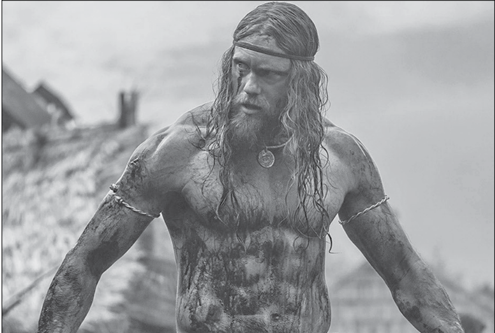
The Northman