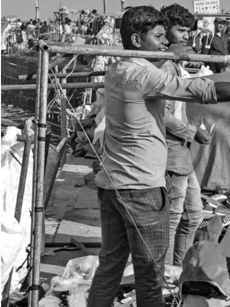
Anything and everything for sale on the causeway along Marine Drive. weren't prepared. The conductor demanded the fare, and we fumbled with a fistful of bills—something we never do in front of people—until a grumpy old gentleman told us to give him 16 rupee. That was 21 cents for two crosstown fares.

stop, planning to cross the city to the Haj Ali Mosque on the Arabian Sea. A passing taxi driver spotted us, screeched to a halt, and grew quite outraged when we turned down his cheapest fare. Mumbai taxi drivers can be a rude bunch, and no one in the uber-polite Indian crowd was surprised when we turned him away and climbed onto the rickety bus. But this was our first bus-ride, and we