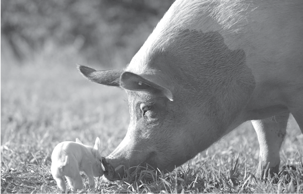
Gunda

it. It’s not really comparable to the beloved David Attenborough BBC documentaries because there is no dialogue whatsoever here. It stands apart from the nature docs on Disney+ because of its drastic black &