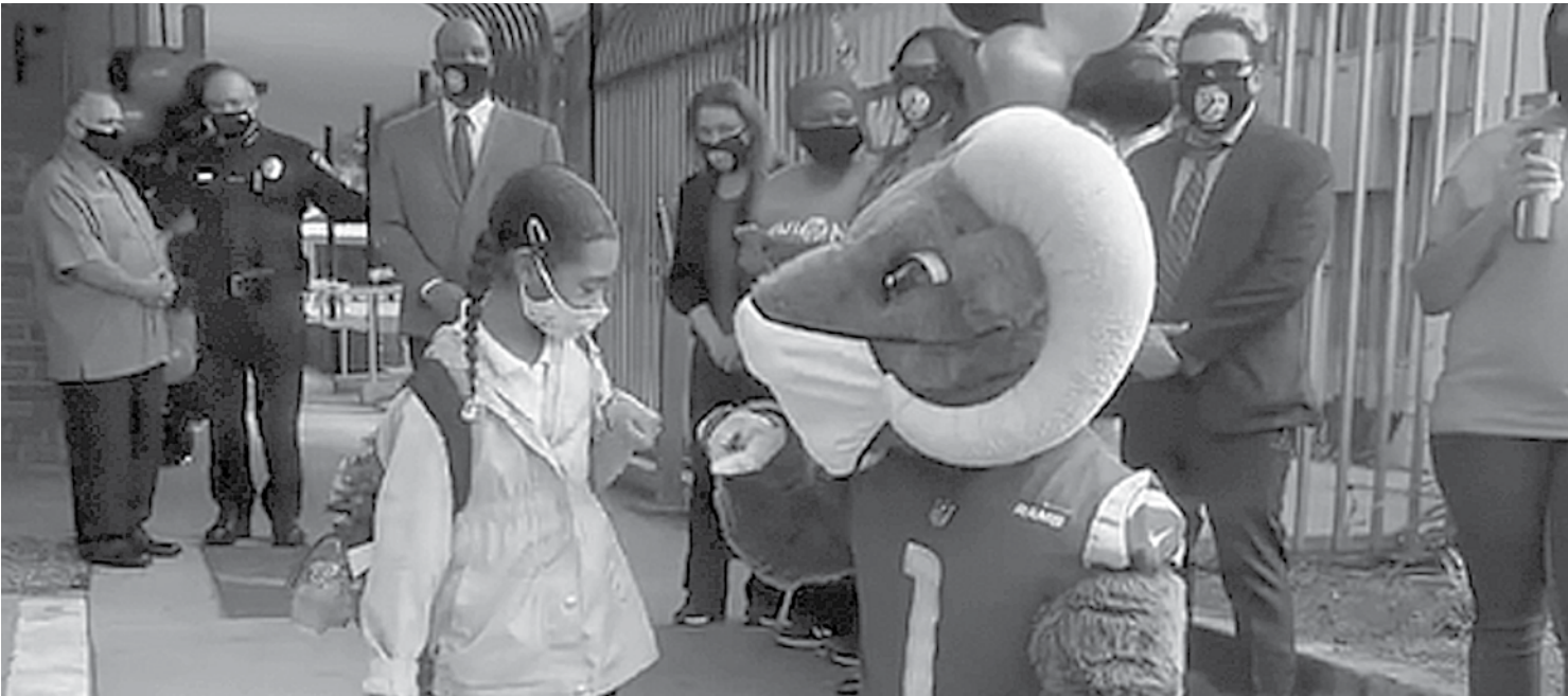
Inglewood students get an exciting welcome on their first day back to school from Los Angeles Rams mascot Rampage, Inglewood Police Department and Inglewood community members. What a great way to start your first day.