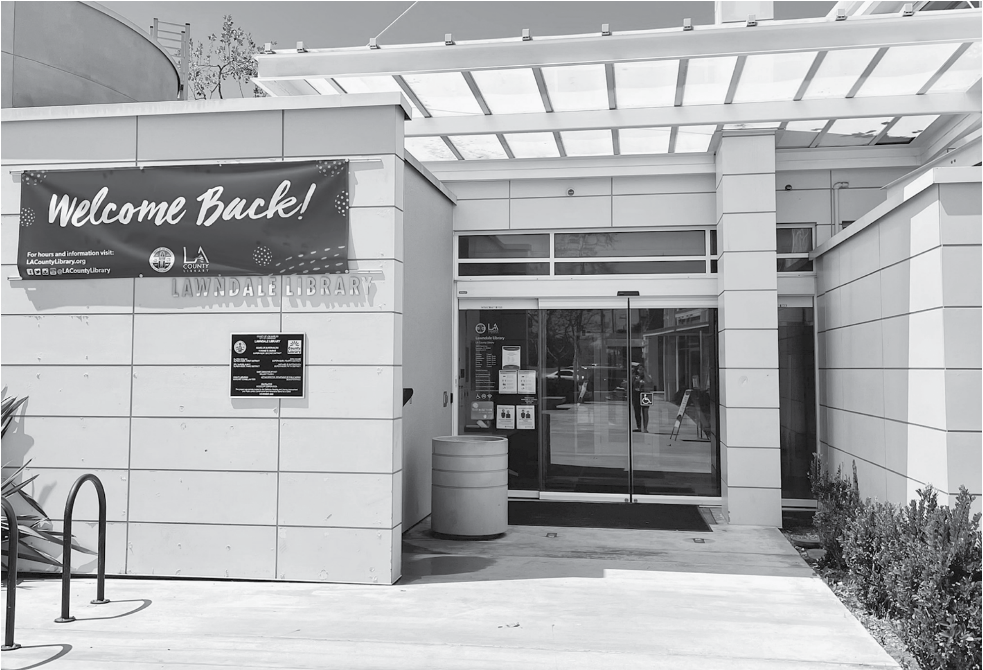
Lawndale Library in-person hours are: Tuesday: 1 – 8 pm; Wednesday – Saturday: 11 am – 6 pm. Sidewalk Service will be available Tuesday from 12 – 1 pm, Wednesday – Saturday from 10 – 11 am, and by request only for the remainder of our operational hours. Call us at 310.676.0177 for more information.