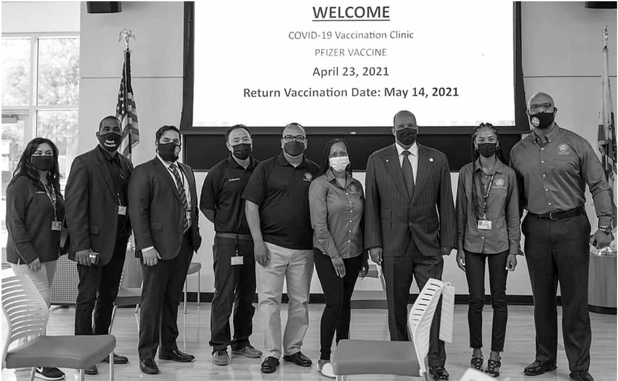
The Office of Emergency Services and Parks and Recreation staff facilitated a successful community vaccination clinic at the Inglewood Senior Center. Members of the community received their first dose of the Pfizer vaccine and will return for their 2nd dose on May 14, 2021. Thank you to the City of Inglewood for all your hard work in order to keep us safe.