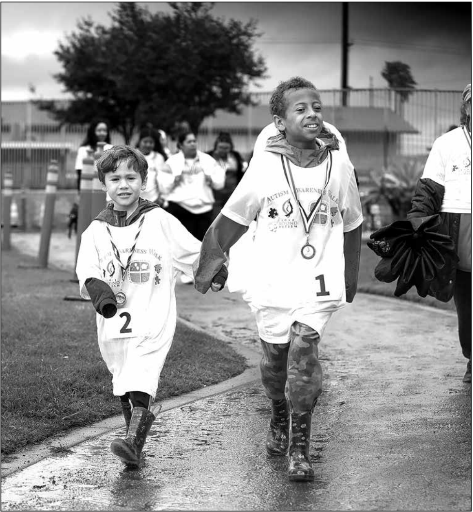
The Autism Awareness Walk took place at Eucalyptus Park through a collaboration between the City of Hawthorne and Love Beyond Autism. The weather was not cooperating with the walk, but that didn't stop over forty participants from braving the cold winds and rain to bring awareness to Autism. Thank you to all who braved the weather for this important event.