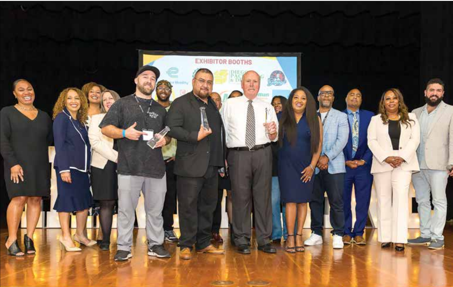
Thank you to all the businesses that participated. Between exhibitors, job recruiters and sponsors, over 75 business came together to make this event possible. Your support has been invaluable in making this event a success. Congratulations to South Bay Ford for winning “Most Supportive Business”, The Cypher Spot for “Community Partner” and The Safe House Barbershop for “Small Business of the Year”.