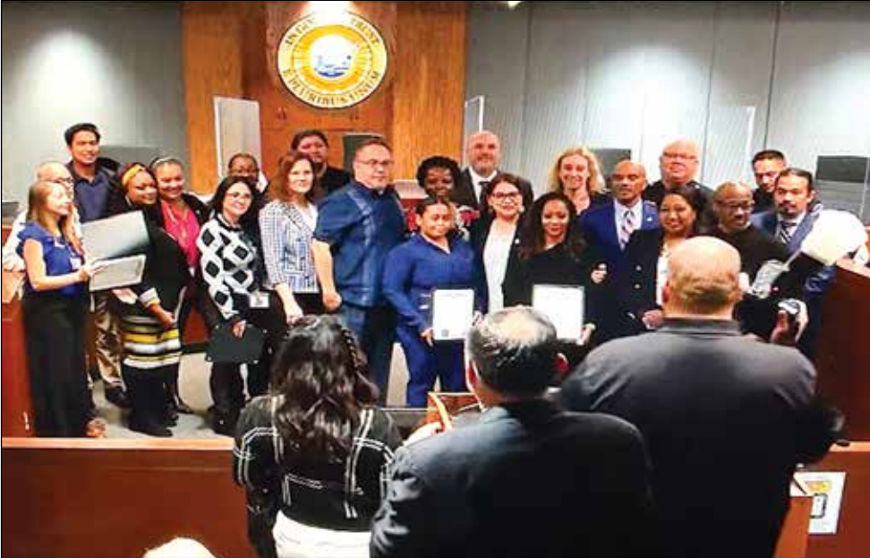
City Council Gives Thanks!