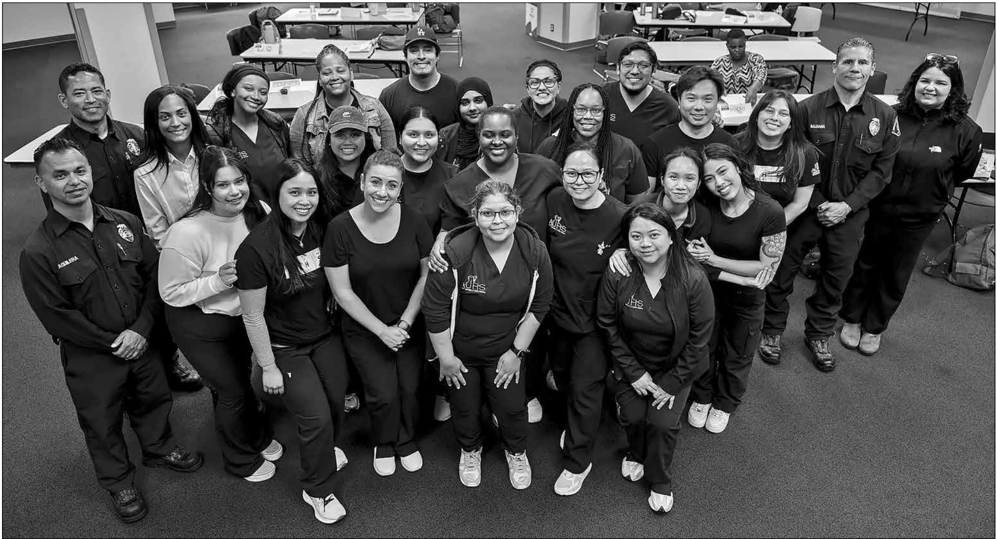
Neighbors came together to learn life-saving skills like fire safety, rescue, disaster medical ops, and more. When emergencies happen, it's the people next door who make the biggest difference and now, our community is more prepared than ever. Proud to see Inglewood stepping up for each other.