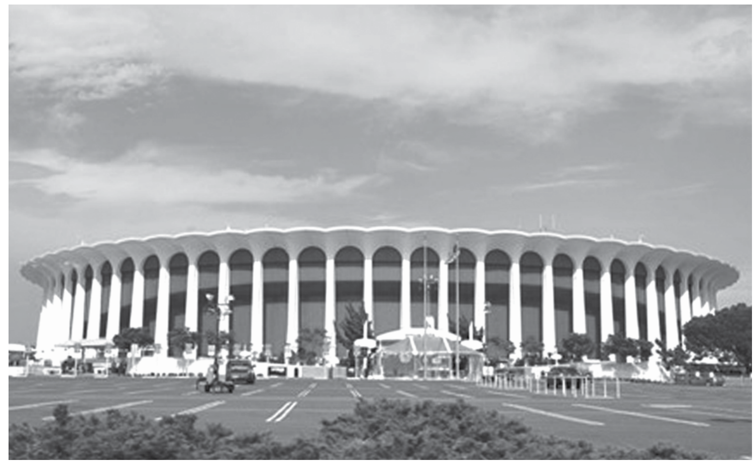
Steve Ballmer completed his purchase of The Forum from Madison Square Garden Entertainment Corp. for $400 million on Monday, clearing the way for the LA Clippers to build their new arena nearby in Inglewood.