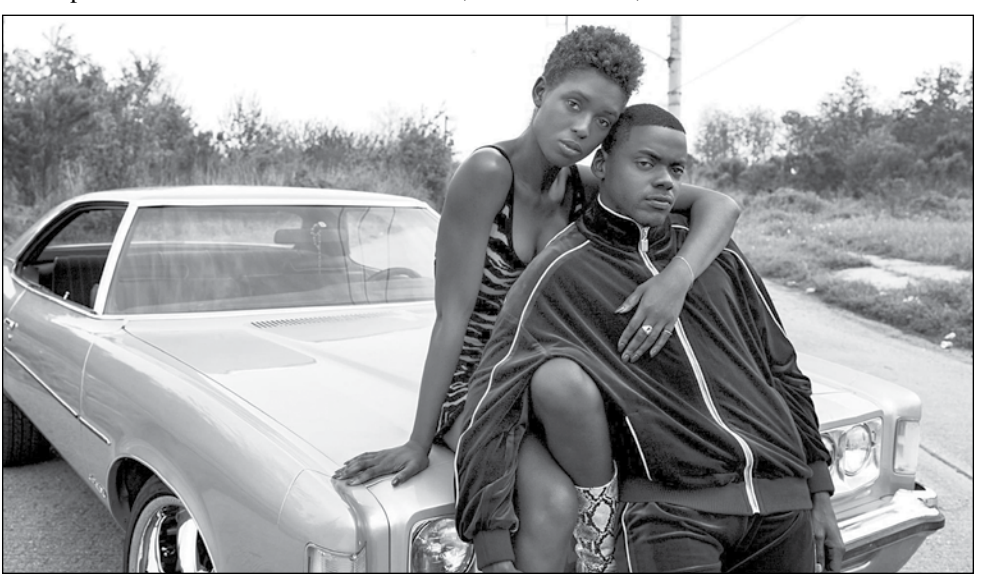
Queen and Slim, courtesy of Universal Pictures

There are times where the film's pace lacks the sense of urgency established by the premise. The nature of stopping along the way means that at times, the movie's momentum is slow.