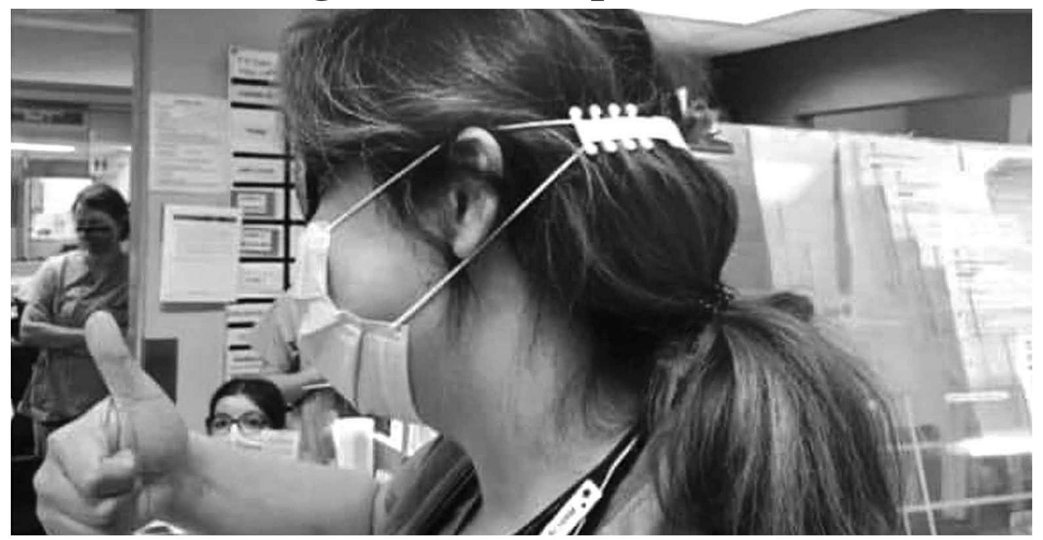
Surgical mask ear savers created by our very own school of manufacturing and engineering. 165 were delivered to Long Beach Memorial, 100 to Kaiser and 65 to Centinela Hospital. Coming soon face shields.