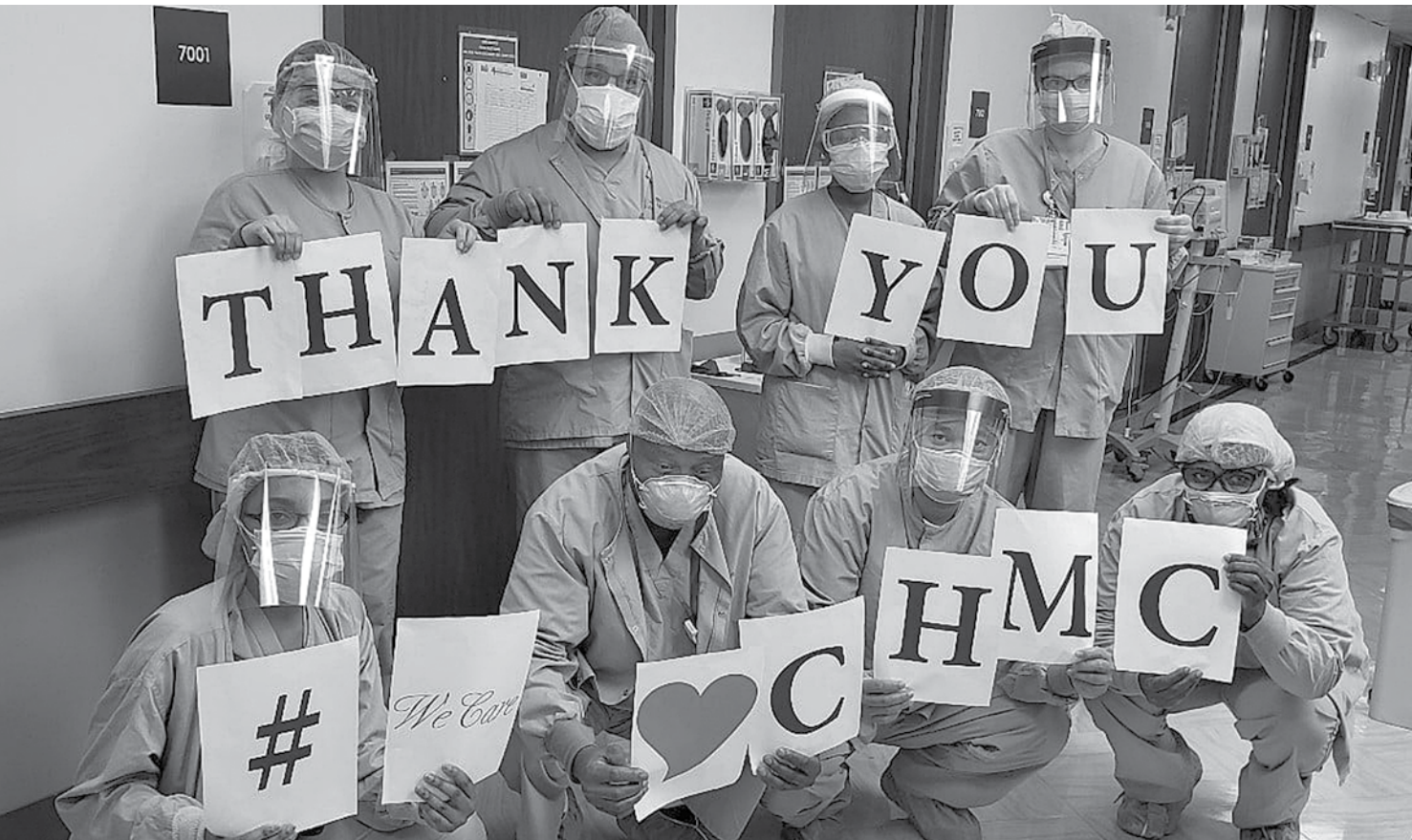
To say that we love our nurses is an understatement. We truly honor them and acknowledge all of their tireless sacrifices they make for patients and our community every day. Thank you so much.