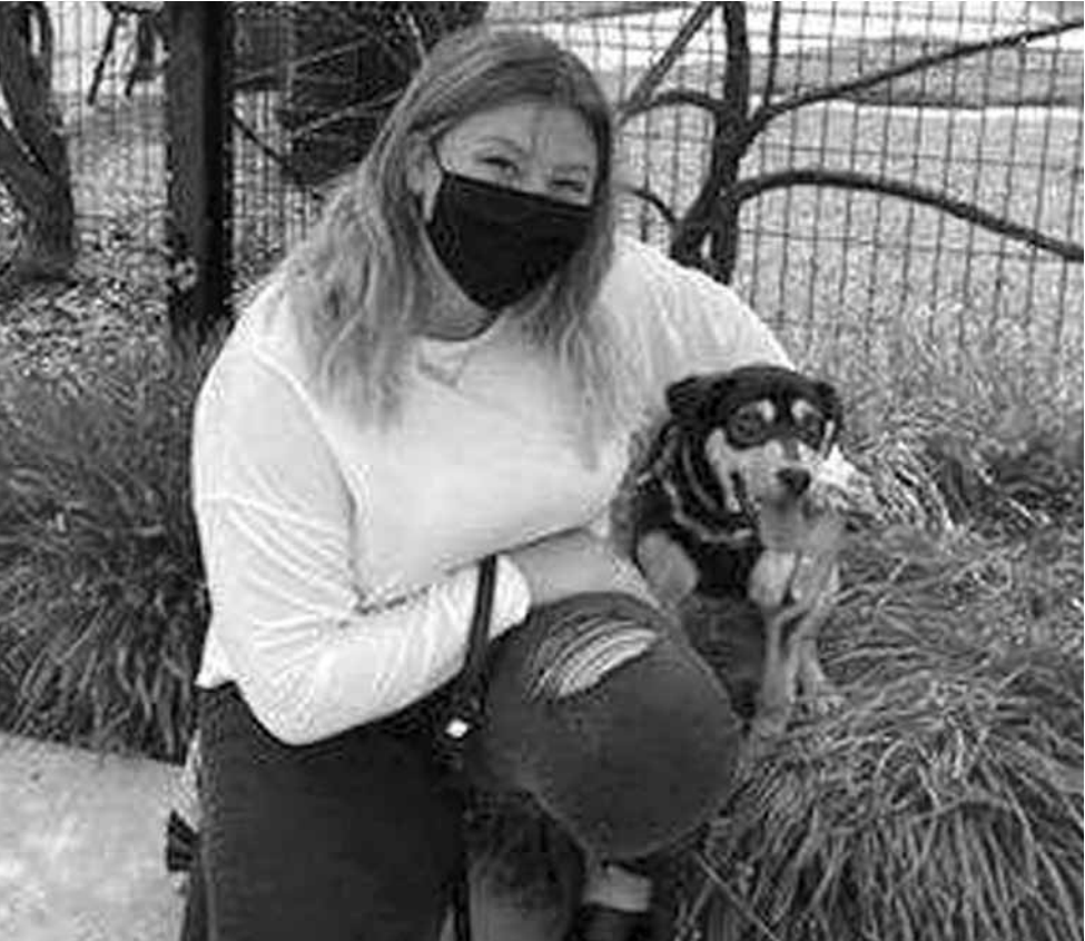
Congratulations to Scout and his new family.

spcaLA. She was so excited to adopt him and went shopping at the spcaLA Marketplace beforehand. His adopter sent an update and said he is so smart and goofy. spcaLA is very thankful to all our adopters and the updates they send us! •