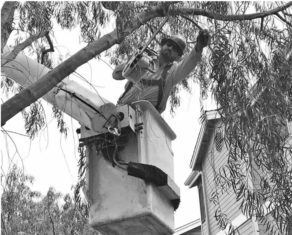
Keeping a tree trimmed in the South Bay.

If you have questions regarding a tree on your property or anywhere in the city, the parks department can help. Trees are an integral part of El Segundo, thanks to its certified arborists and their hardworking teams. "The Parks Department takes great pride in the care of their trees, as much as the residents love having their trees." •