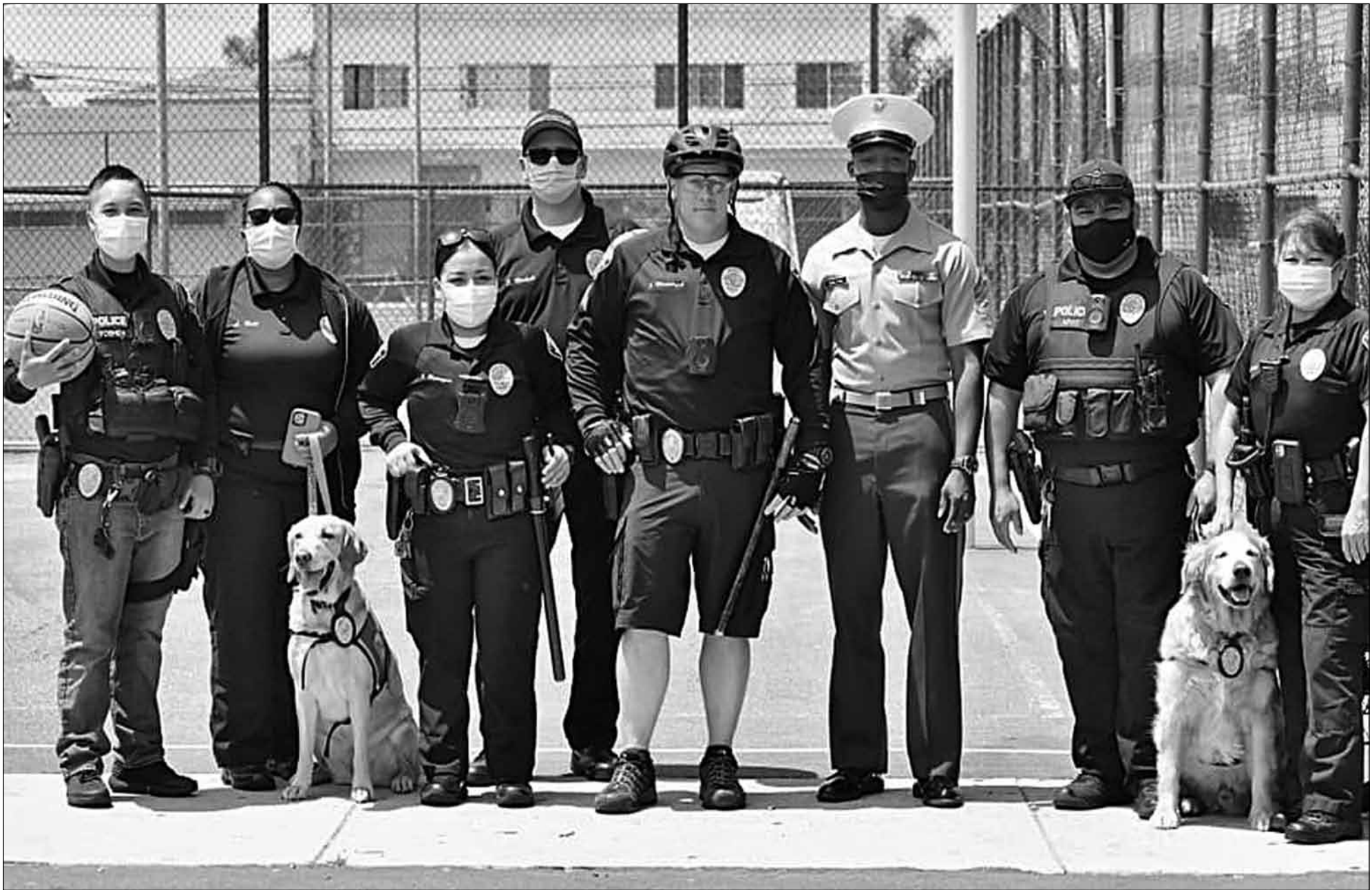
Thank you to our neighbors and friends for coming out to Memorial Park yesterday and hanging out with the Hawthorne Police at their RV Trailer. They had a ton of fun and can't wait to see you all at the next one. Stay tuned for the future dates.