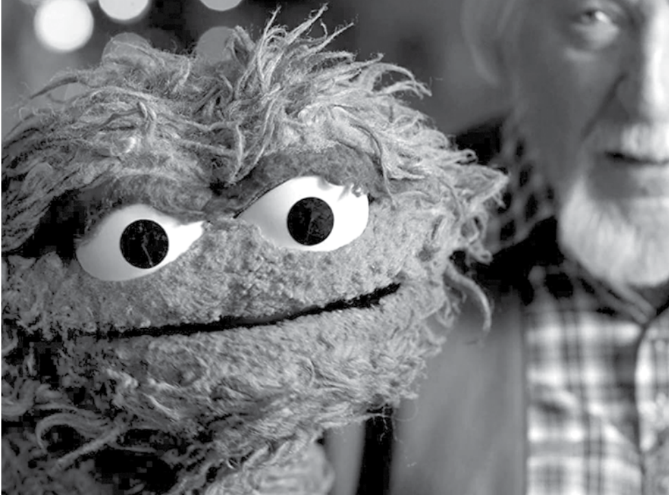
Sesame Street , courtesy of Screen Media Films.

The biggest debt that Street Gang wishes to pay here is to Jon Stone, who we learn was the visionary and central force for what “Sesame Street” the show would become. Motivated