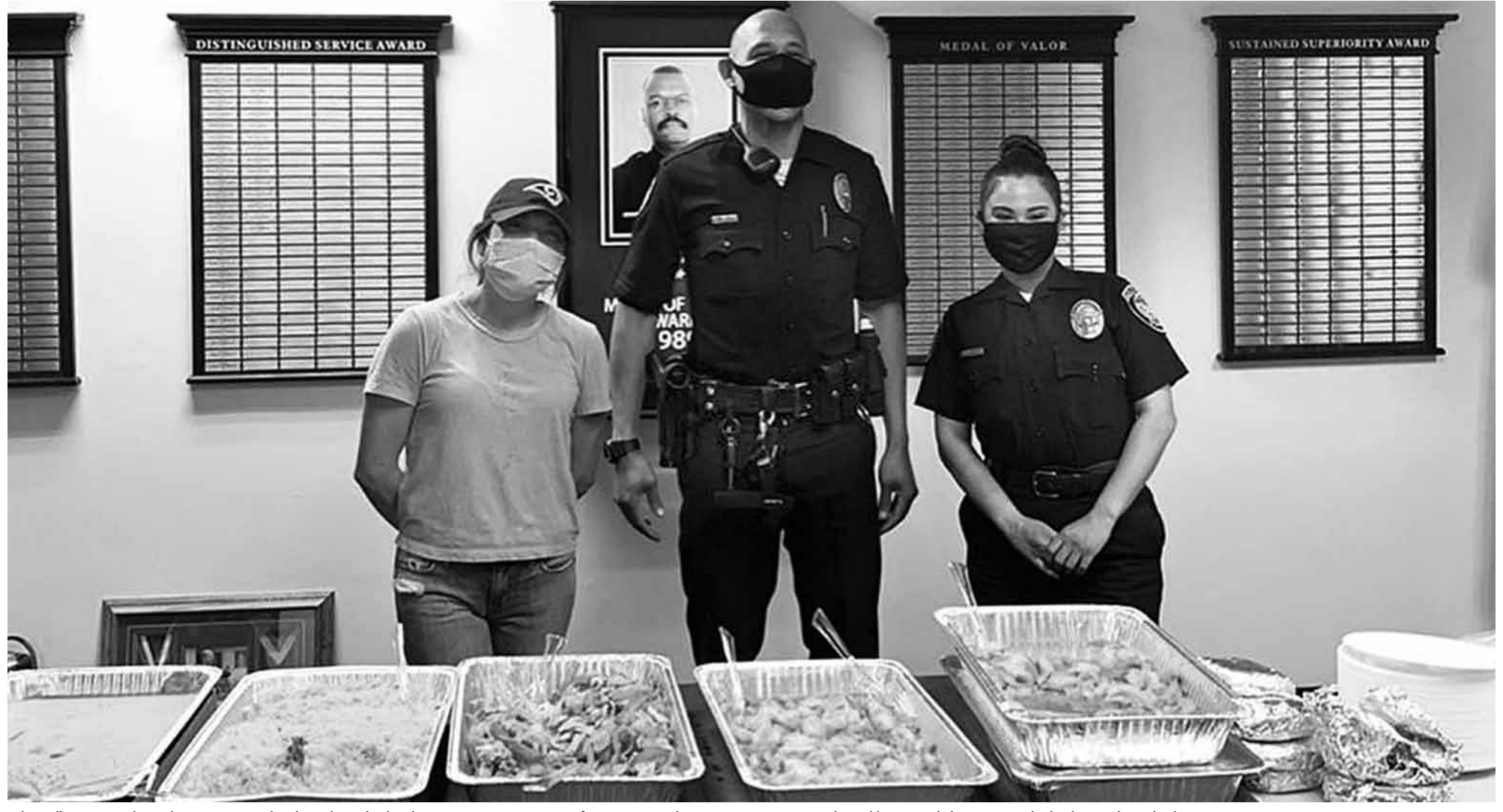
Lalos Grill Restaurant donated an amazing meal to the Inglewood police department as an appreciation for protecting and serving our community. Inglewood businesses believe in giving back.