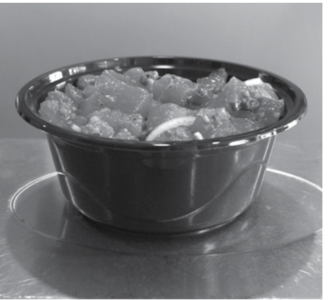
A traditional garlic and soy poke bowl at Ali'i Fish Co.

To learn more about Ali'i Fish Co. or to place an order online, visit aliifishco.com. •