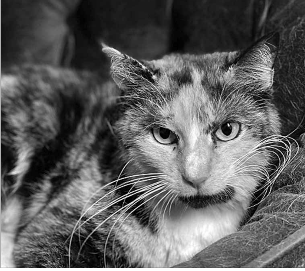
Kit Kat 20-02858