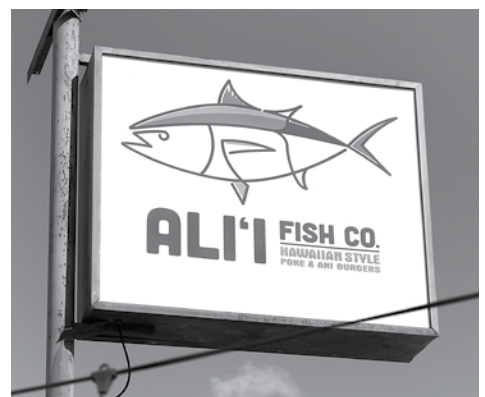
Ali'i Fish Co. is located at 409 E. Grand Ave. next to the El Segundo Teen Center.

of everybody that's been supporting us from the beginning, and if we're able to survive this, hopefully, we can come back stronger and better."