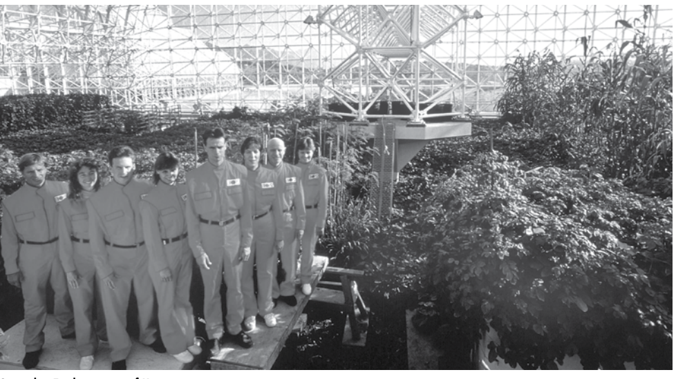
Spaceship Earth

Watching Spaceship Earth in these times feels a bit ironic. I found myself thinking, why would anyone willingly quarantine for years!? However, there are similarities here as we continue to isolate from the outside