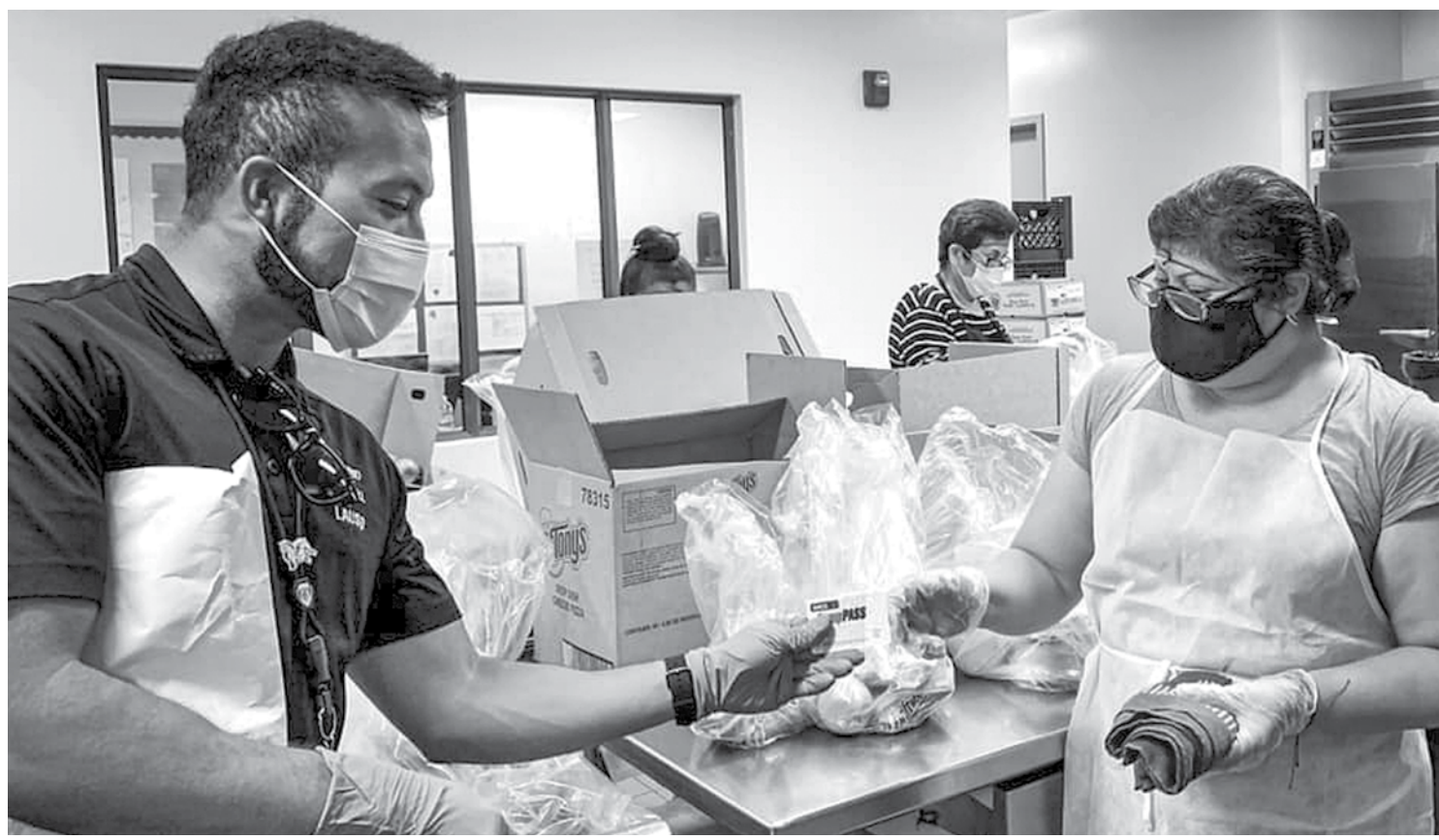
To show their appreciation for Los Angeles Unified School District employees, the Dodgers and Los Angeles Dodgers Foundation teamed up with ARCO to hand out gift cards to staff working at the grab-and-go centers throughout the city.