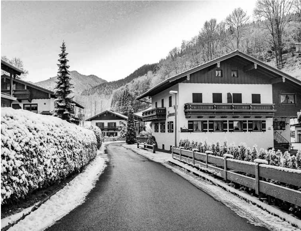
Idyllic SS barracks at Berchtesgaden.

done niche of hell. Today, all over Europe, the sentiments have clearly changed. Older generations have died off, reducing the guilt to second-hand