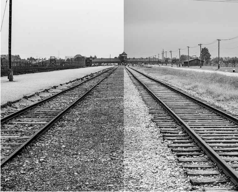
Then and now? Railroad tracks to the main gate at Auschwitz-Birkenau.

We don’t recommend that you travel to these places because you’ll enjoy yourself. Not to sound too smug or self-righteous about it, but we recommend that you go there because you won’t. •