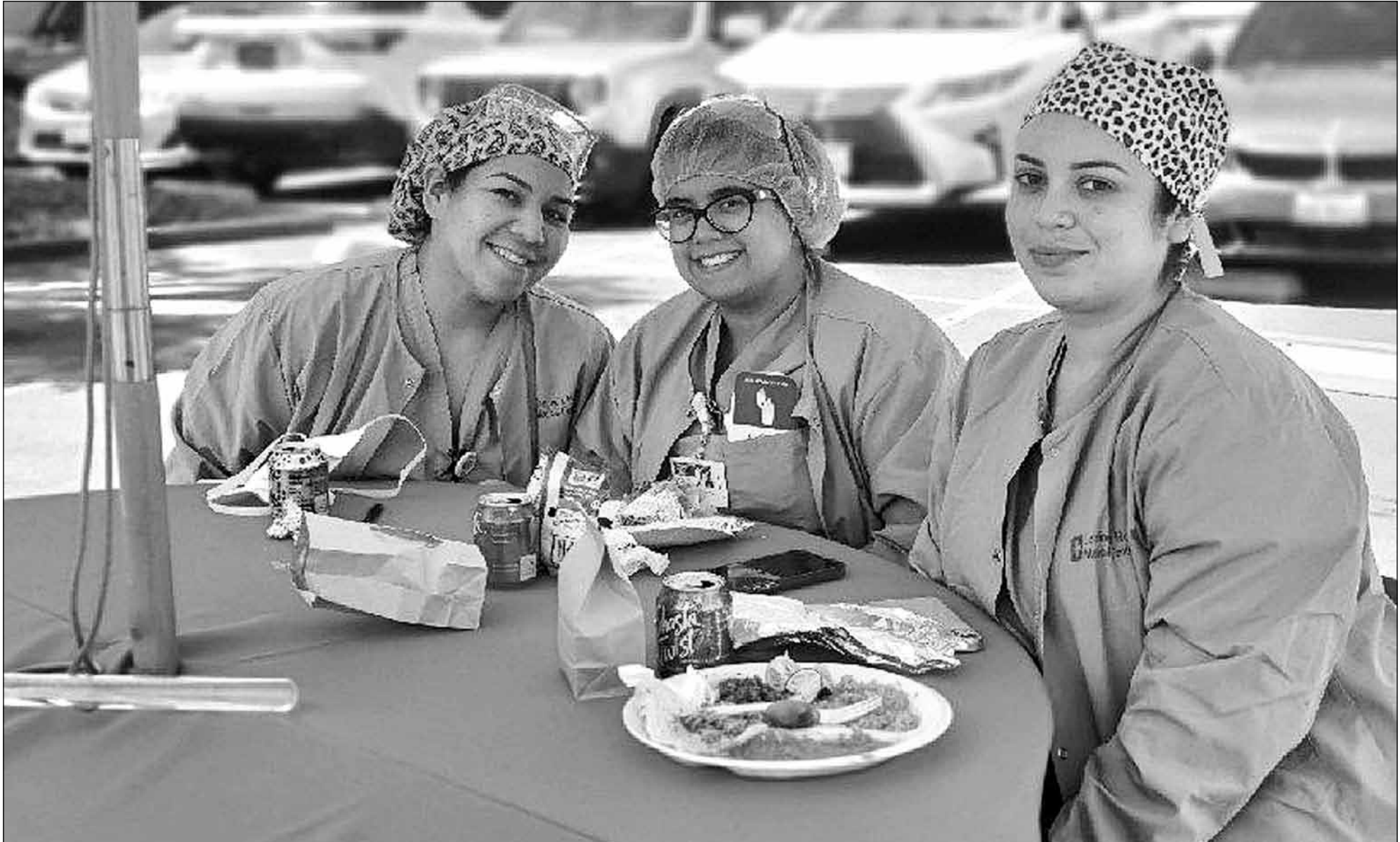
The last two years have taken a major toll on our community, as we responded to COVID-19. It has also been a time of amazing accomplishments. First and foremost, we are grateful to those who serve on the frontlines of providing care. Centinela Hospital took a moment to celebrate with its VIPs – our employees. And the best part about Taco Tuesday was seeing all these smiles. Thank you for taking care of our community.