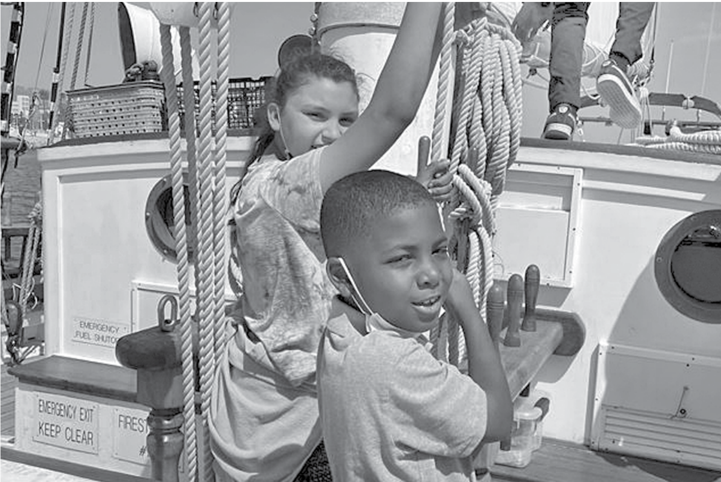
As part of the TopSail Youth Program at Highland Elementary, 5th grade students visited San Pedro, California and enjoyed a day at sea aboard a tall ship. On this adventure out at seas, students learned problem-solving skills, science, and technology through various activities. Students had the opportunity to assist with raising the sails, climbing the rigging, and taking the helm. Way to go TopSailors.