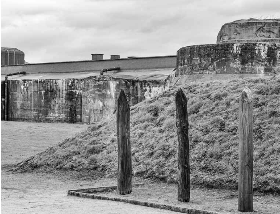
Shooting stocks at Fort Breendonck.

Later on, we asked the same questions in the Munich suburb of Dachau. This was after we’d figured out that the shortest distance between heaven and hell had to be exactly 187 km (117 miles)—or the precise distance between the Dachau main gate and Adolf Hitler’s chalet in the idyllic Obersalzberg paradise of Berchtesgaden. Dachau wasn’t just any old