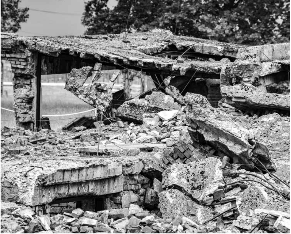
Half-demolished Crematorium III at Auschwitz-Birkenau.