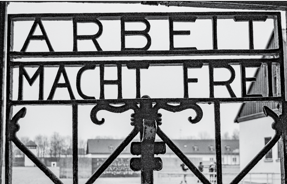
Advice for the lost and abandoned at Dachau.

occupied western Europe. The year was 1967, twenty-two years after the end of World War II, and the camp had been abandoned exactly the way it sat on the last day of the war. Years later, in Jerusalem, we visited Yad Vashem, the Israeli memorial to the Shoah. The central feature of the museum was a huge, concrete map of Europe that showed the location of every major concentration and death camp. And there, on the map, in one of the few western communities that had supported the German invasion, sat Fort Breendonck. Compared to the other camps, our version was See Travel, page 8