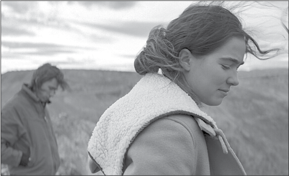
Montana Story