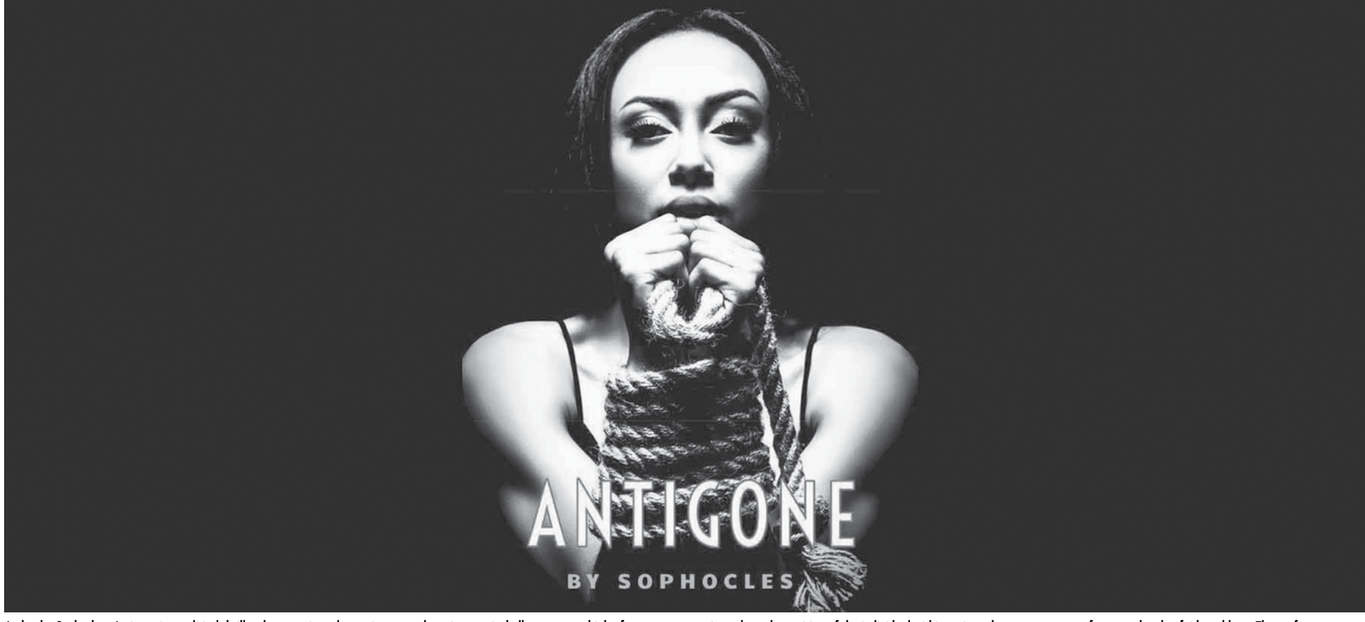
A play by Sophocles, Antigone is a political thriller that remains relevant in our modern times as it challenges us to think of answers to questions about the position of the individual within society, the empowerment of women, loyalty, faith and love. The performances run May 21-30. Tickets are on sale now at www.centerforthearts.org.