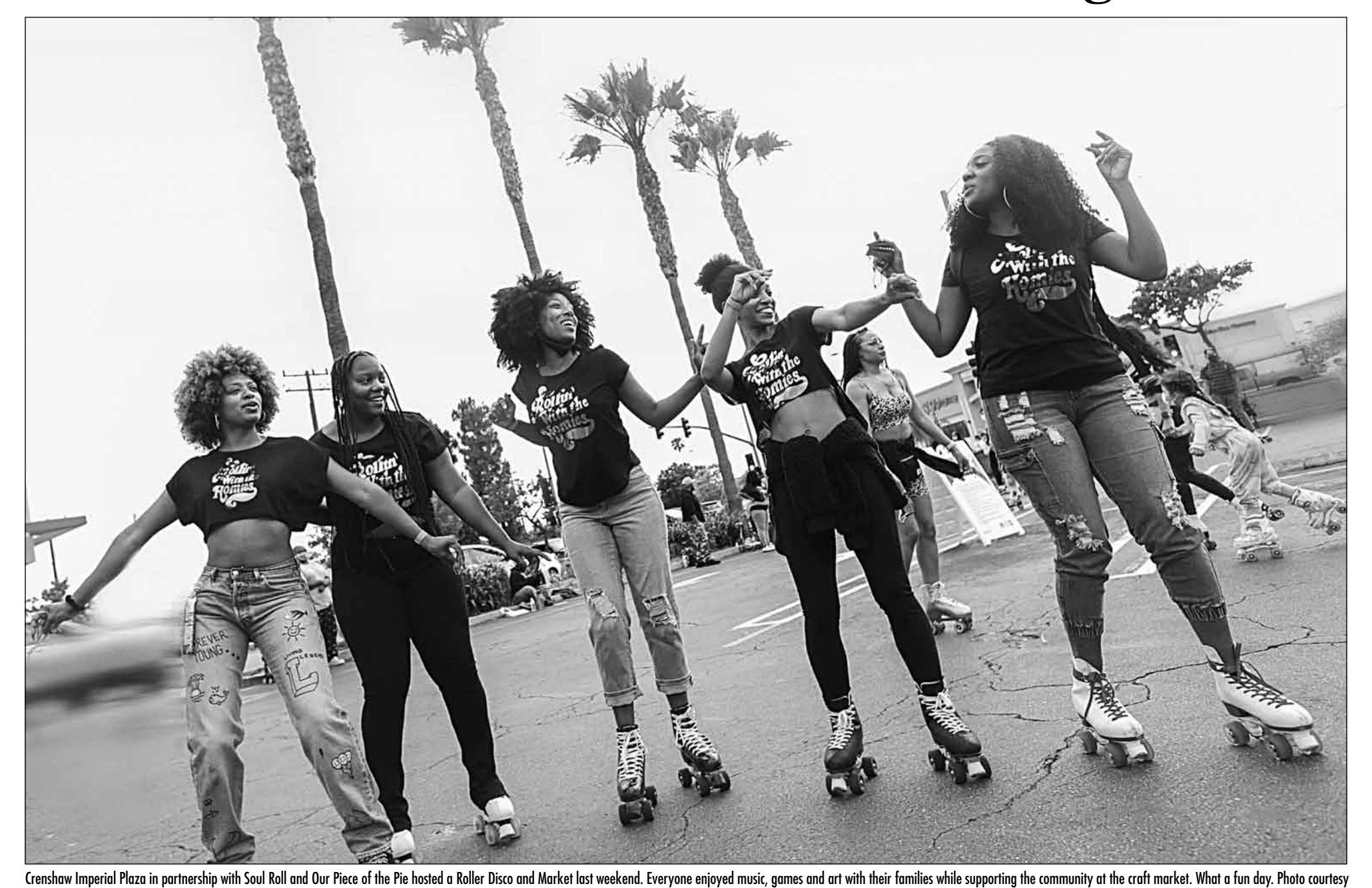
Crenshaw Imperial Plaza.