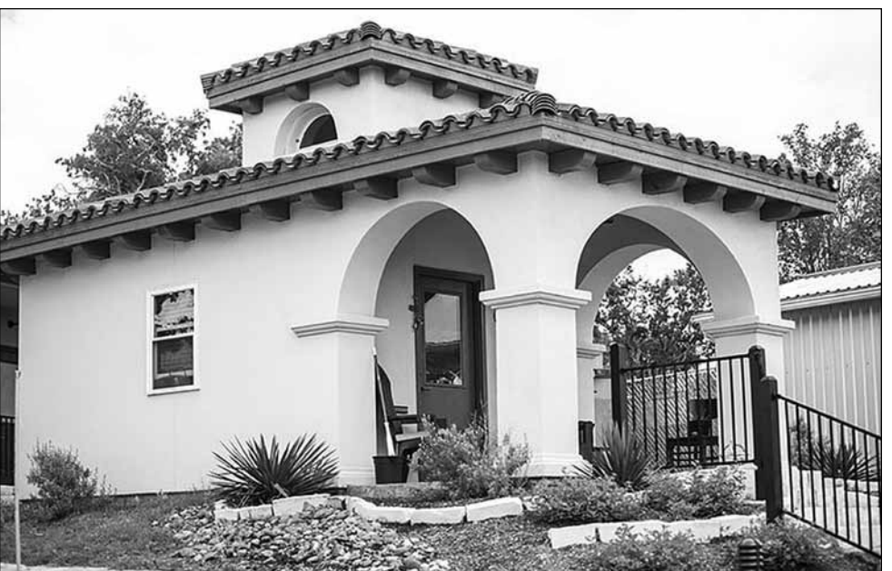
Another example of a tiny home located in the Community First! Village in Texas.