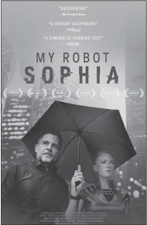
My Robot Sophia