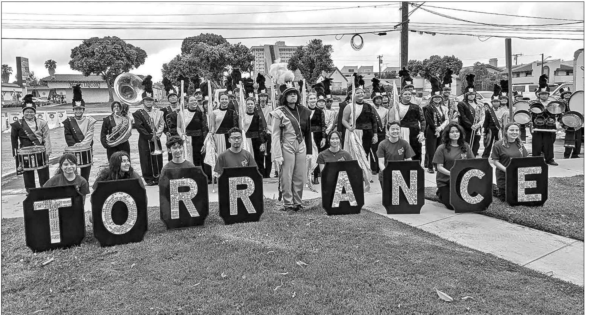
What a great day at the Armed Forces Parade. We are thankful for all the service men and women who serve this country. Great job Tartars.