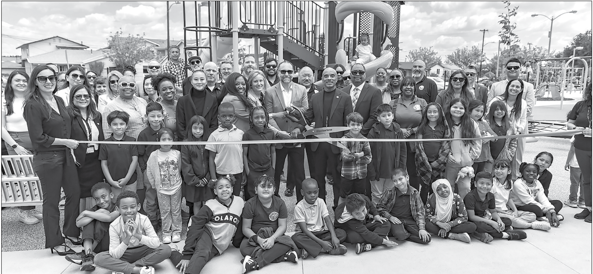
There's a brand new playground, a basketball court, restrooms that are now wheelchair accessible, new swings with some having seats catered to children who have physical mobility needs, gym equipment and much more. This project wouldn't have been possible without the $3.5 million in grants.