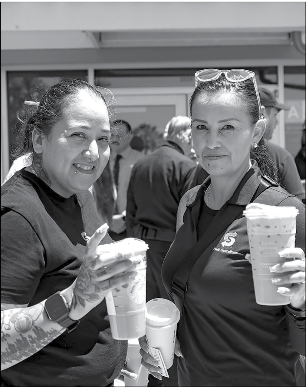
The mission is simple: break down barriers and build relationships between officers and the community they serve. It's always a good time when we come together, one cup at a time.

“The willingness of America’s veterans to sacrifice for our country has earned them our lasting gratitude.” — JEFF MILLER