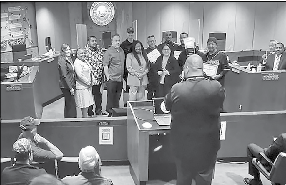
Good Neighbor Awardees.