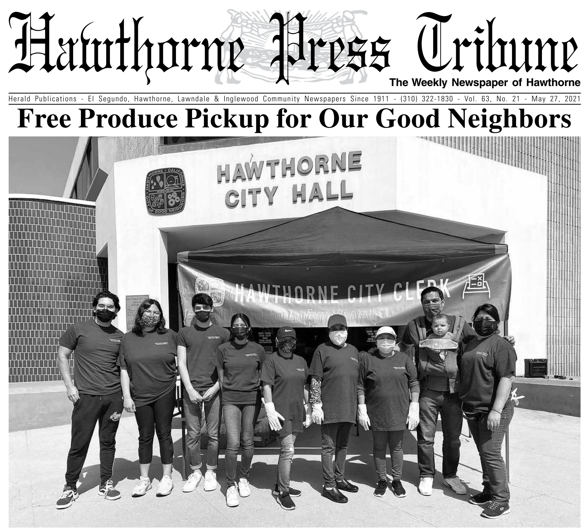
Thank you to all the volunteers that helped make the day a success and for those that showed up for their bag of fresh vegetables at City Hall. If you weren't able to make it don't worry, on June 5th there will be another give away, so save the date.