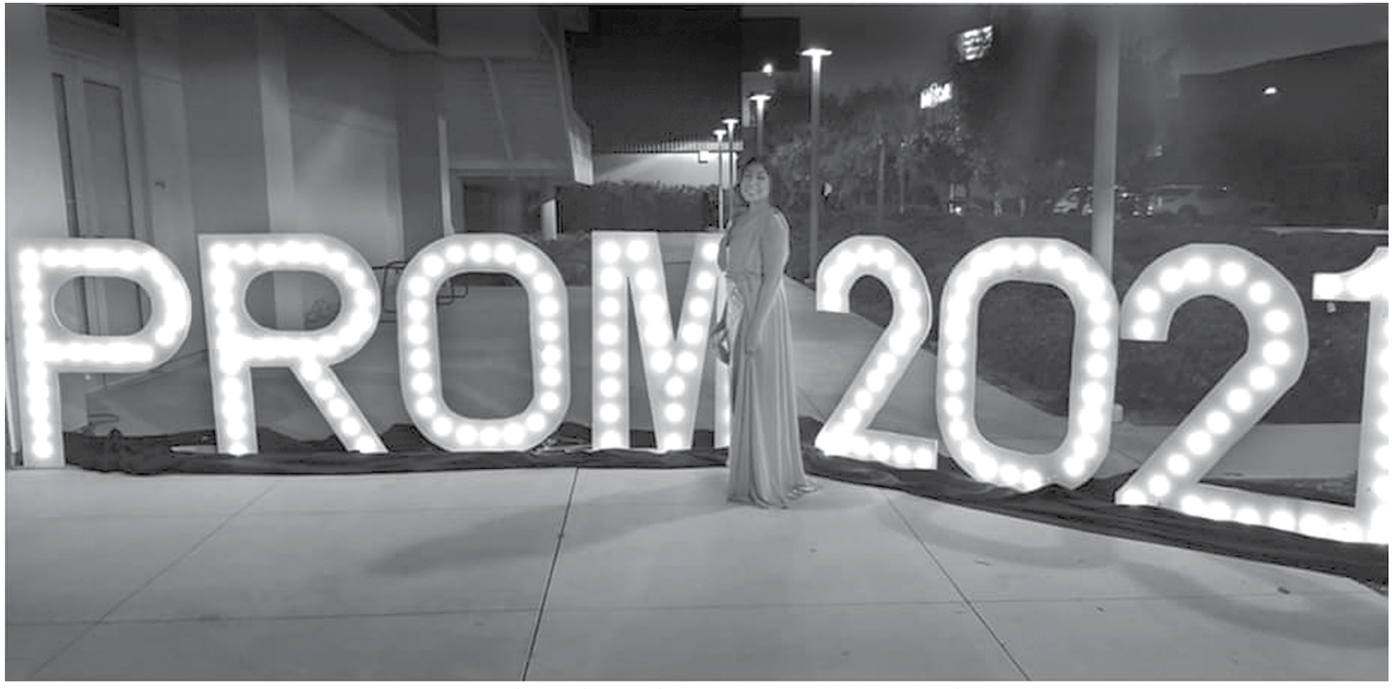
Centinela Valley Schools celebrated Prom 2021 with a virtual prom and drive-thru with a hundred foot tunnel of light and professional portraits to cherish the unique high school rite of passage. It took place on Saturday May 22, 2021 at Lawndale High School.

"Sometimes you will never know the true value of a moment until it becomes a memory." -DR. Seuss