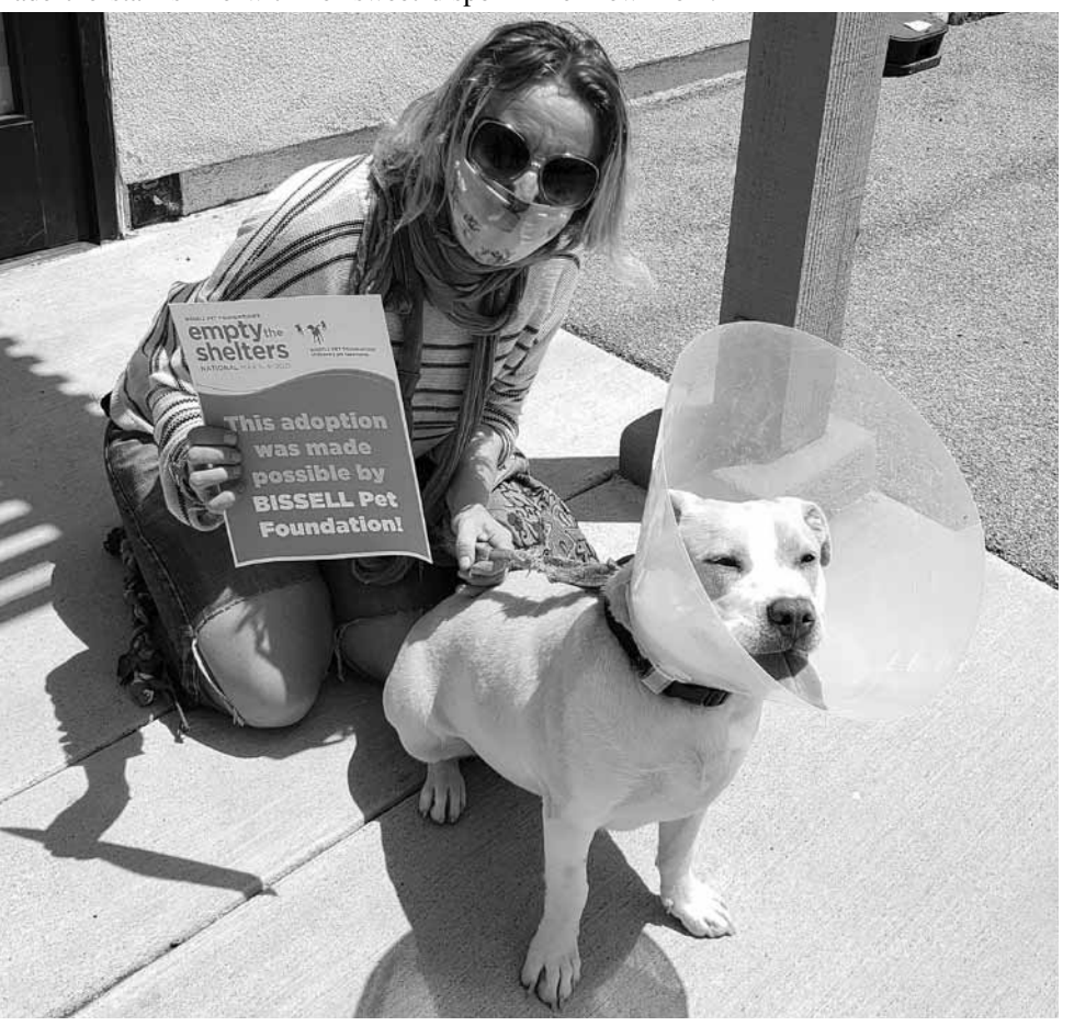
Congratulations to Pebbles and her new family.

sition and energetic playfulness. Her new mom was in search of a new dog. Pebbles will be training to become a service dog to her new mom. •