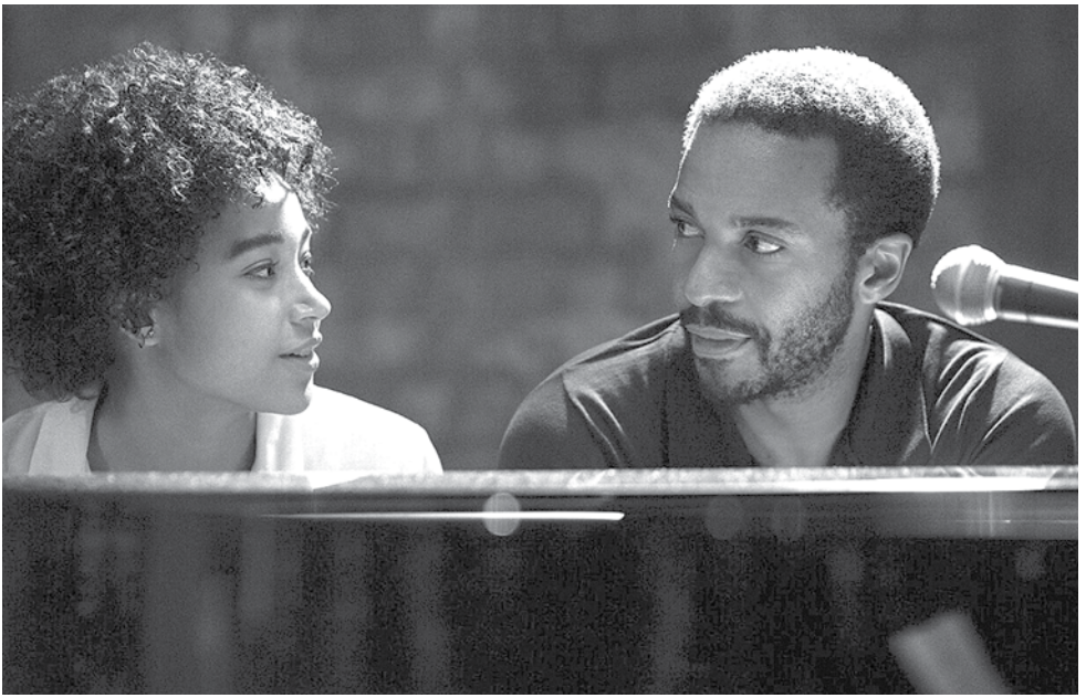
The Eddy, courtesy of Netflix.

episode follows a different character). But beyond all that, The Eddy is really at its best when the story builds to a musical sequence, at which point it stops to sink into the best jazz jams you've heard, and all from the walls of a real Parisian nightclub (and really, is there anything better than being transported to the heart of Paris while we're all locked down right now?). From the band's on-stage