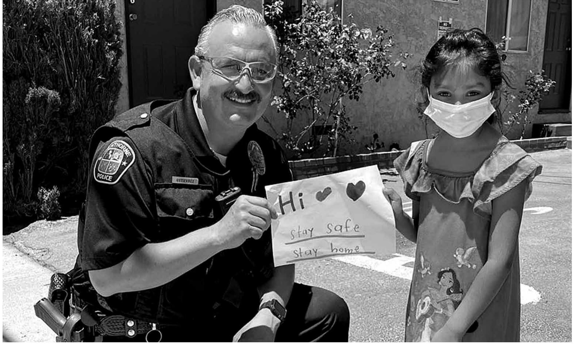
So sweet... this little Hawthorne resident waited for officers to finish with a call for service to hand over this cute note.