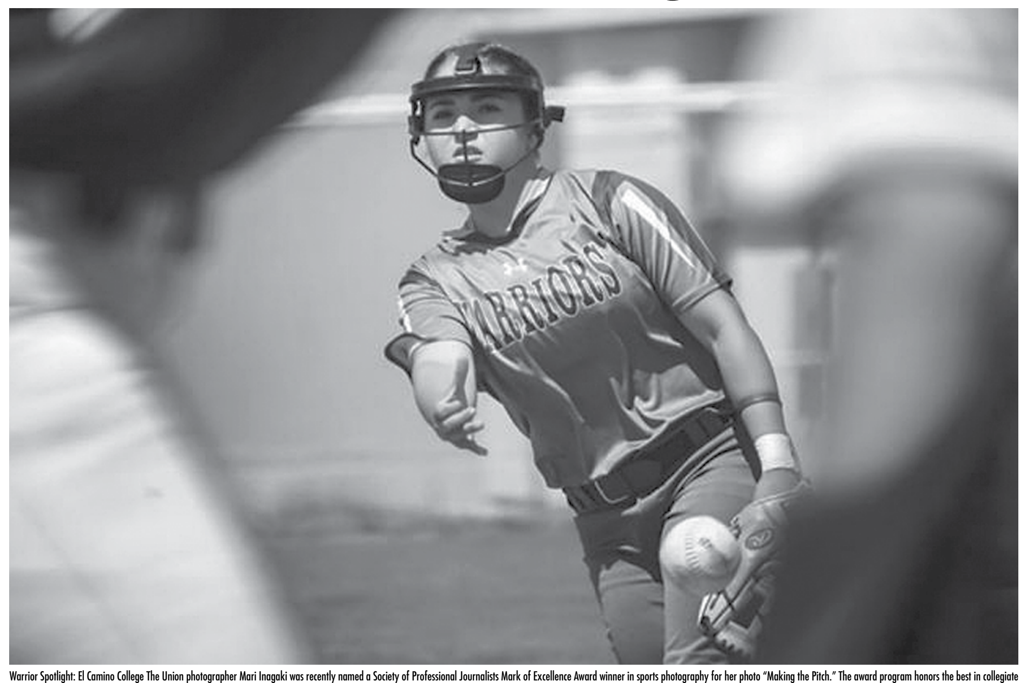
journalism across the country! Read her full story: https://bit.ly/3bVoJ1l.