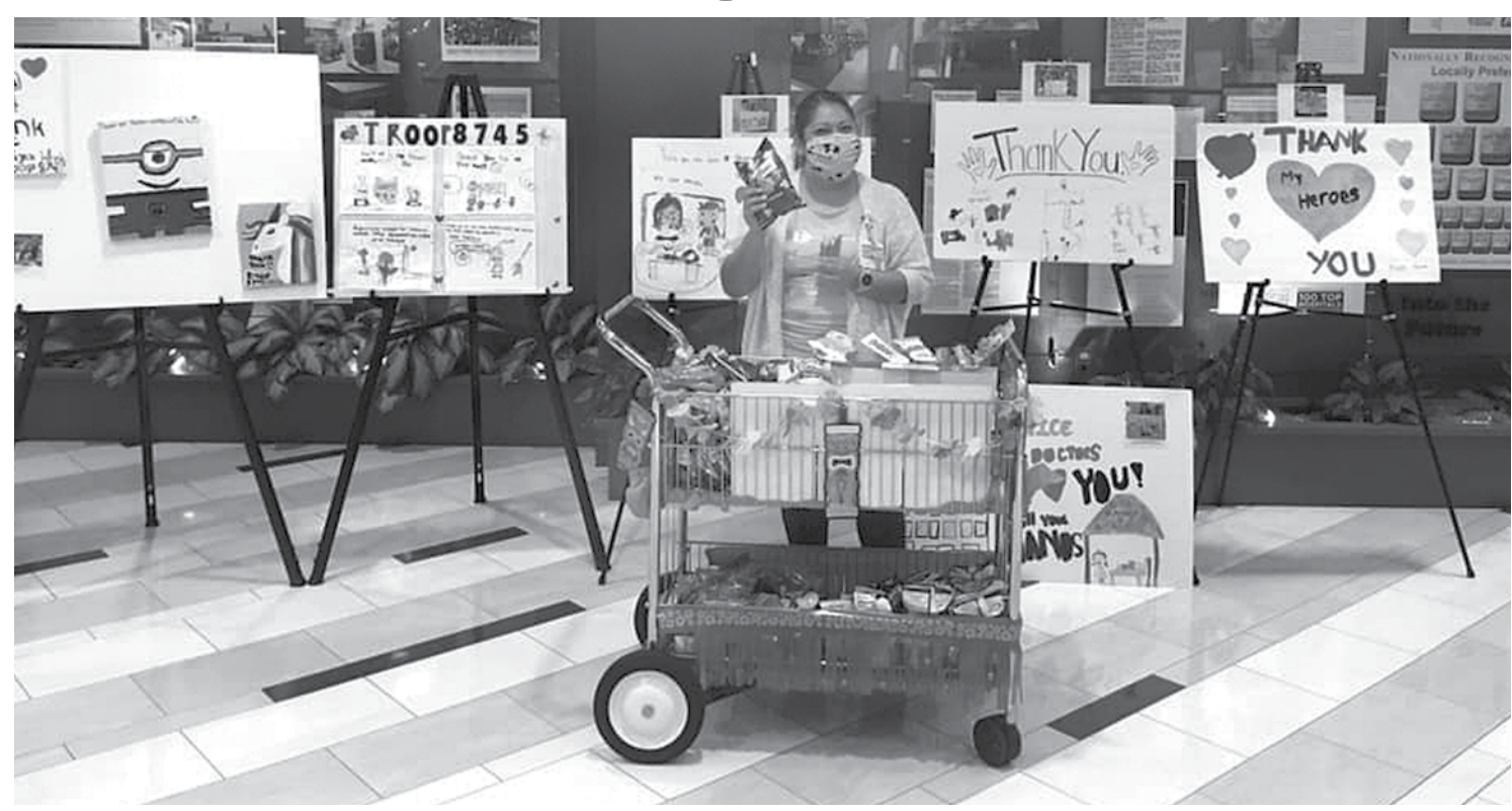
No better way to start your day than to thank those who come into work to save the day.