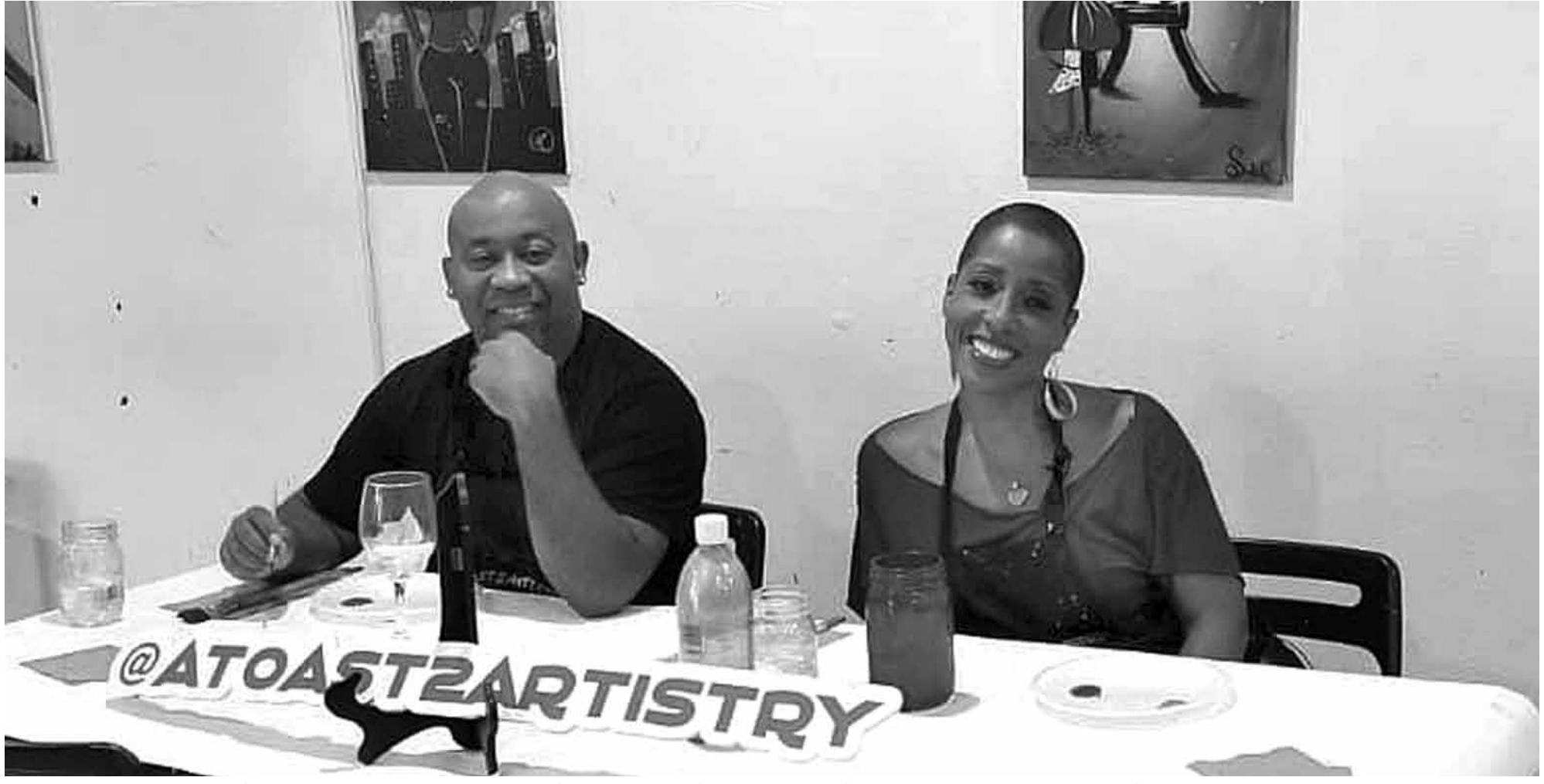
Virtual Art Classes coming soon courtesy of the collaboration with A Toast 2 Artistry and the City of Inglewood. For more information go to the City of Inglewood's Facebook page.