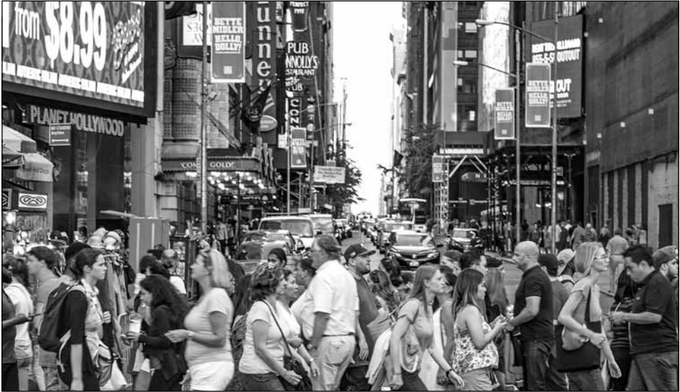
The tourist business is alive and well on Times Square.

up a small stairway into a darkened function room. When we inquired, he reminded us in a thick Russian accent that it was Valentine’s Day. When we asked if we could crash his private party, he took $140 from us and told us to show up at 10:30PM. We did, and found that the Russian underworld was alive and well in New York. A fabulous buffet—caviar, blinis, lobster, shrimp, ten kinds of salmon—but the main event was the mobsters in their tuxedos and shoulder bulges and the millions of dollars of bling on their gorgeous, shimmering molls. We were deciding what to drink, when the waiter strode up and dropped off a fifth of vodka and two glasses. Needless to say, we didn’t even think about a selfie. The dancing lasted until the sun came up the next morning. •