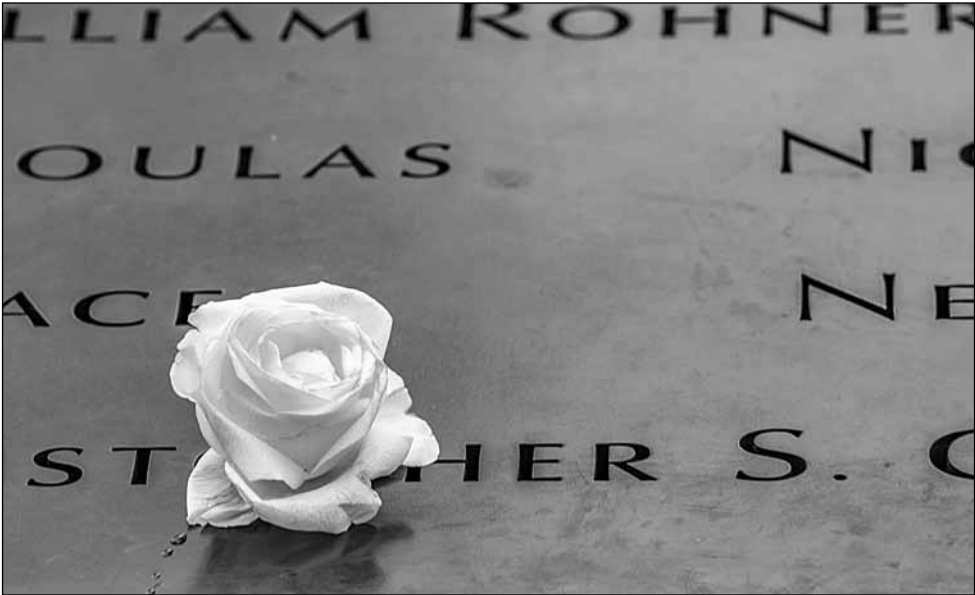
A yellow rose for one of the souls lost at the Twin Towers.

The Oak Room and the Palm Court used to be two of our favorite eateries in town, but then the Plaza lost its way, and the Oak Room