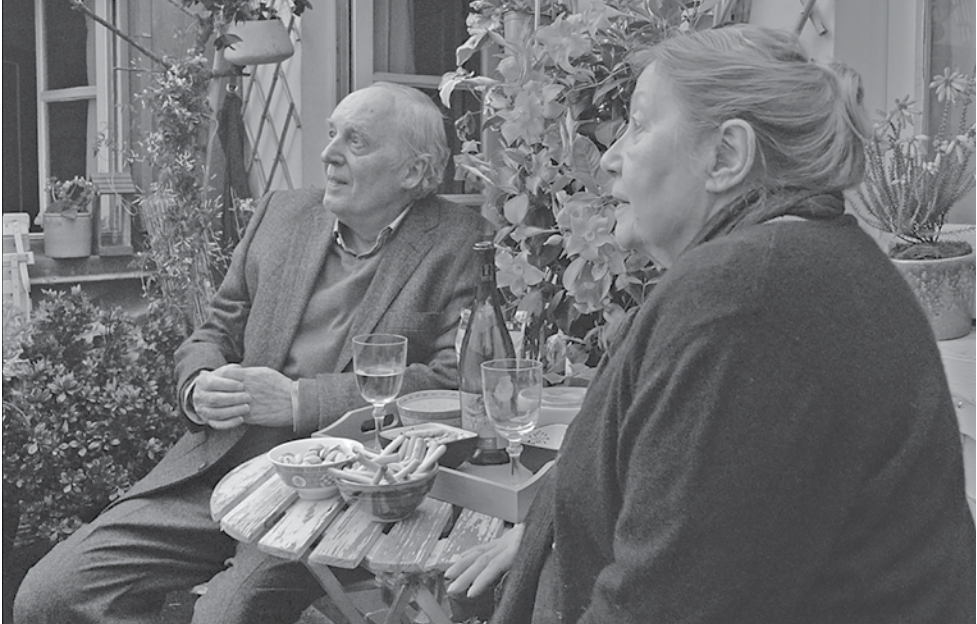
Vortex

In Vortex , we follow an elderly couple living in a cramped French apartment. Sharing a single frame together (an important note for now), they venture to share a meal on the balcony. Elle (Françoise Lebrun) asks him, “Life is a dream, isn’t it?” To which Lui (Dario Argento) agrees: “A dream within a dream.” And then, this painful dream begins.