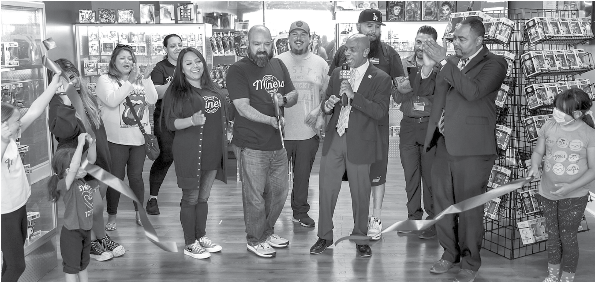
Minera Sports Cards and Collectibles held a ribbon cutting ceremony to welcome them to Hawthorne. You can find cards, Funko Pops, collectibles and much more. Welcome to the neighborhood. Please support our local businesses.