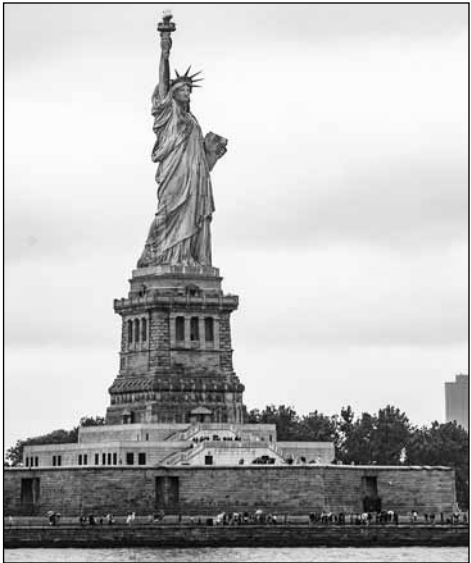
She awaits your tired, your poor, your huddled masses yearning to be free.

We turned a corner here one afternoon and came upon a dude unloading crates of vodka