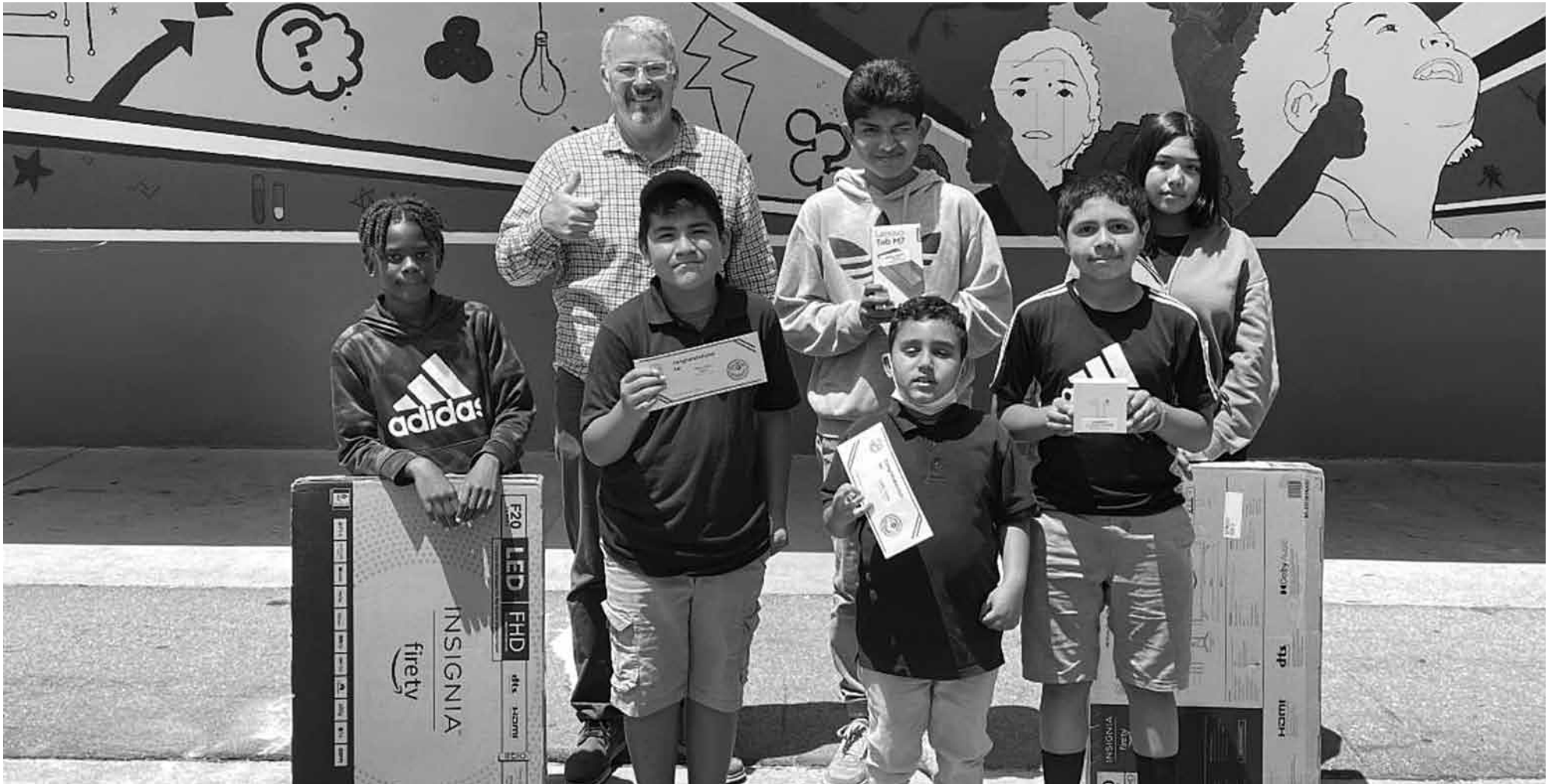
Inglewood School District values the importance of coming to school every day and the positive impact it has on our students. The campaign began in December of 2021 and for each day of the week that students were present, they were entered into a raffle. Congratulations to all of our winners and their commitment to coming to school every day. Good job on the attendance.