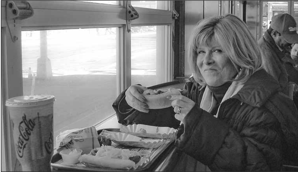
Nathan’s Coney Island, home of the International Hot Dog Eating Contest.

One bitterly cold January evening, we came out of the Tribeca subway into deep snowdrifts and stumbled onto Ideya. This tiny Jamaican treasure had opened just days before, so we snagged a window table to keep tabs on the blizzard over too many of their signature mojitos. Like so many New York gems, Ideya took off like a rocket and then, within a decade, crashed and burned. The point not being to recommend a particular restaurant, but to note how fabulous finds like this come and go all the time. You’ll