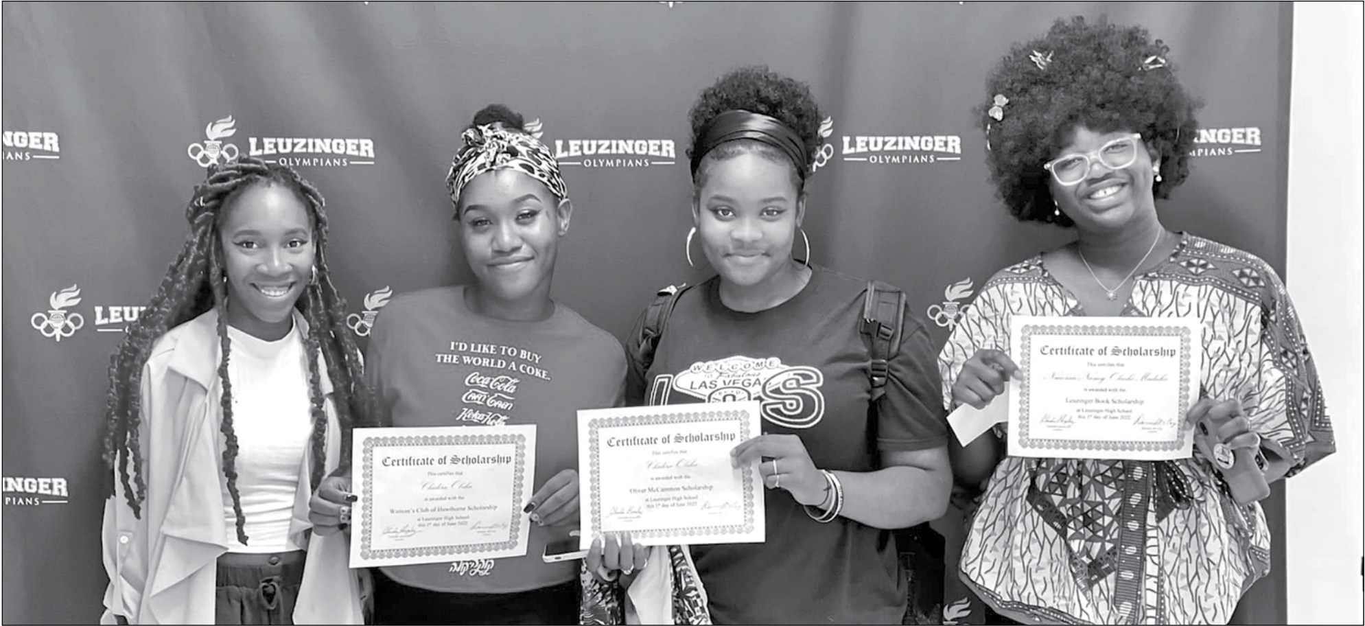
There were so many well-deserved recognitions at the Leuzinger High School Senior Awards Night. We are so proud of all your accomplishments. Thank you to all the donors who gave scholarships to our amazing students and to our counselors for putting on this wonderful event.