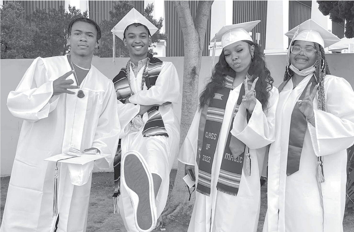
Hats off to the scholars from City Honors International Preparatory School who were honored at their graduation ceremony. A round of applause to all the other South Bay students who will graduate this year. We wish you the best of luck in your future endeavors.