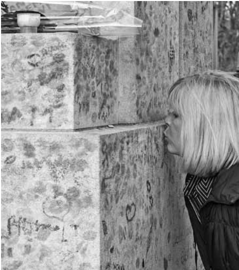
Kissing Oscar Wilde.

Slow-motion traffic jam every dawn. trek through the alleyways of French history. Along the way, some of the residents you'll meet: Héloïse and Abelard (1100-1163 and 1079-1142): The original Romeo and Juliet, more or less. Héloïse's uncle terminated their clandestine marriage by castrating Abelard. The lovers then ended their days cloistered apart as nun and monk. But their erotic letters (in Latin, of course—who would've thought?) outlived them. After their solitary deaths, their bones were dug up and re-interred together through all the chaos of French history. Oscar Wilde (1854-1900) and Robbie Ross (1869-1918): The great playwright and his lover were driven from London by nine parts bigotry and one part hubris. After dazzling Victorian society for more than a decade, Wilde picked a fight he couldn't win with the Marquess of Salisbury that landed him in Reading Gaol.