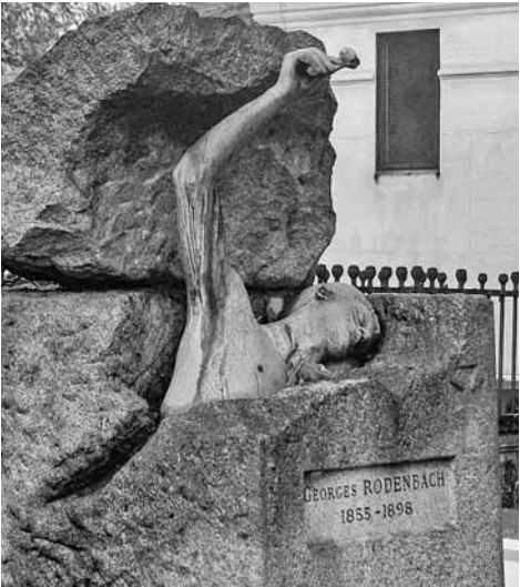
Wishful thinking — but the scarlet roses are always fresh.

stored Bourbon royals. His remains were exiled from France, but then the government relented and allowed just his heart to be buried here. Édith Piaf (1915-1963), Yves Montand (1921-1991), and Simone Signoret (1921-1985): Édith Piaf ("La Vie en Rose") and her protégé Yves Montand ("C'est Si Bon") hung on when the Germans invaded in 1940 and made a living in the invader's favorite night clubs. Afterwards, both national treasures were quickly forgiven. Montand found his hidden inner socialist and married Signoret, who was buried next to him. Signoret was a feminist and a gorgeous actress who specialized in portraying tough, sexy, sulky-voiced prostitutes. She won the 1959 Academy Award for "Room at the Top". We love the title of her memoirs, "Nostalgia Isn't What It Used To Be". Jim Morrison (1943-1971) Beware of the clutter. •