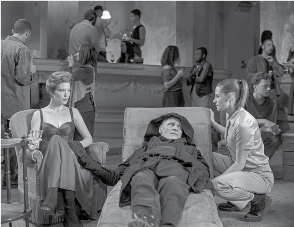
Léa Seydoux, Viggo Mortensen, and Kristen Stewart in David Cronenberg's Crimes of the Future.

It's clearly a wild premise. Those who are familiar with Cronenberg and his singular