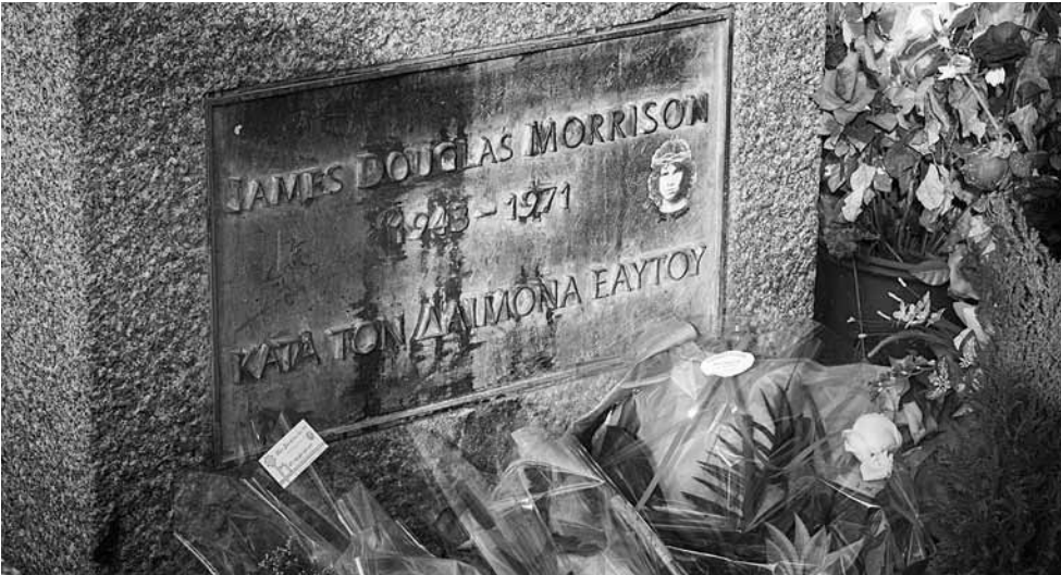
The patron saint of litter — or Jim Morrison's grave?

the stage and confirmed Leslie Caron's career in films. Sexually and politically ambiguous, Colette became the most celebrated novelist of her time and a journalist whose reputation somehow survived her dalliance with Vichy France and the German invader. Paul Legrand (1816-1898) and Marcel Marceau (1923-2007): Each the most celebrated French mime of his century. Sarah Bernhardt (1844-1923): No one died more dramatically or more dependably than this stunning beauty, in the thousands of performances that dominated the world's stages for the decades of her career. In eight tours, she took America by storm, although few understood the French in which she performed. Even after a leg was amputated, she continued to hypnotize her audiences with roles written for much younger women—and men. As the daughter of a famed Parisian