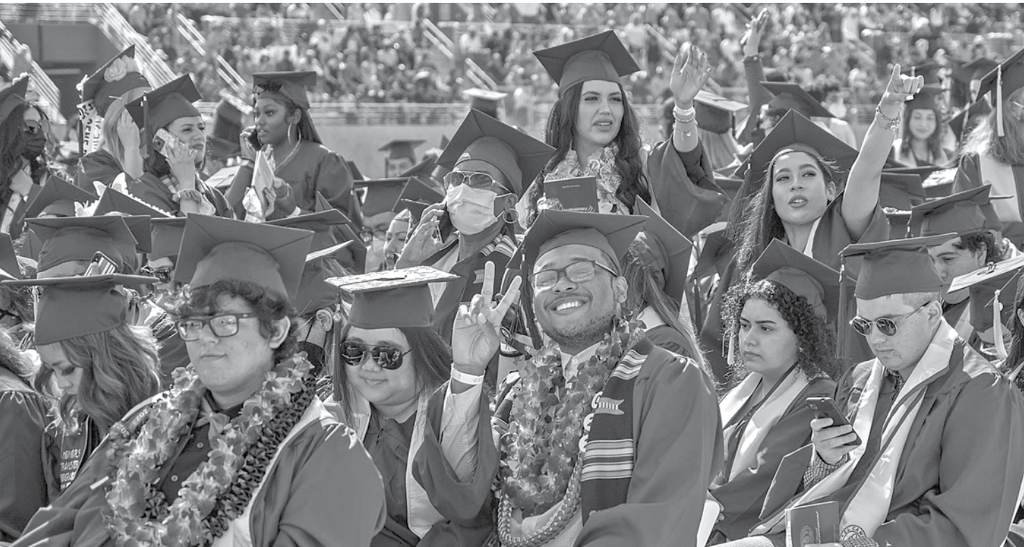
Congratulations to the classes of 2022, 2021 and 2020. You’ve graduated. Welcome, as new Warrior alumni.