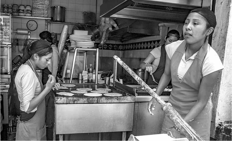
Making the tortas in Colonia Juárez. were the arguments, that the Revolución saw every President between 1910 and 1934—along with two of the more colorful Mexican leaders, Emiliano Zapata and Pancho Villa—either exiled or assassinated.

from the countryside against a Senator who was dispossessing them to make way for his cattle ranch—but the carefully staged event looked more theatrical than threatening, and made a point of not interfering with the surge