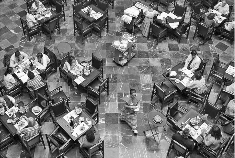
Lunchtime at Sanborn's in la Casa de los Azulejo. The unbalanced wealth earned Mexico City its reactionary sobriquet as the City of Palaces, while the Revolución contributed its determinedly centrist political structures and a host of provocative, avant-garde street names. These make for an odd juxtaposition that, much to our surprise, seems to work. We did weave in and out of a demonstration around El Ángel on Reforma—a protest by peasants

every regional variation, even the faraway Baja and Sonoran specialties we knew. In a tourist mecca, you'll also find every exported Mexican hyphenate returned to satisfy the untutored whims of foreigners. But once you get past the junk and casual foods of the markets and street vendors, Mexico City boasts a cuisine every bit as sophisticated as any European culinary capital. In neighborhoods from la Condesa to Polanco to the crowded Barrio Chino, local and imported chefs infuse the foods of the world with a Mexican sensibility that is every bit as distinctive as the Parisian.