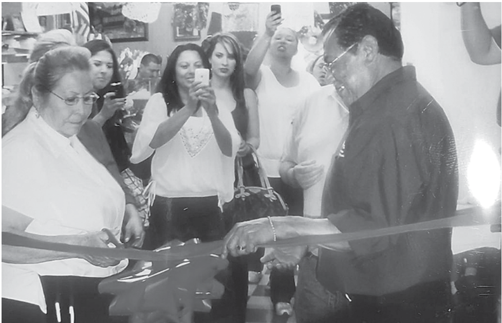
La Paz Expansion Party on Center Street.