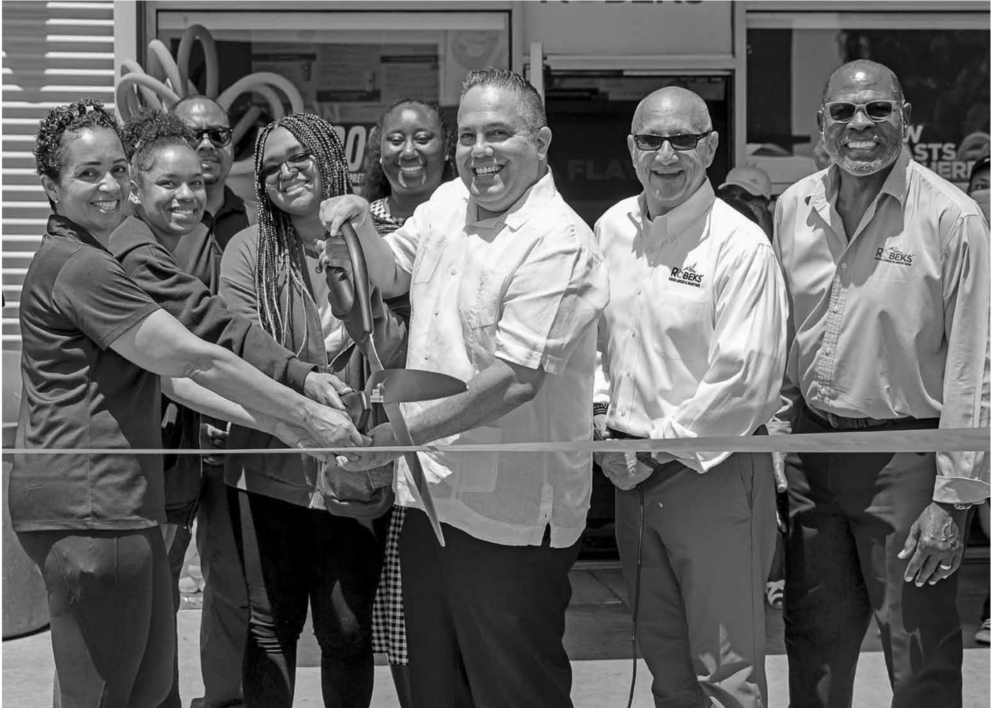
There was a Ribbon Cutting Ceremony this past weekend for Robeks. Come on down and welcome Robeks by supporting Hawthorne businesses.