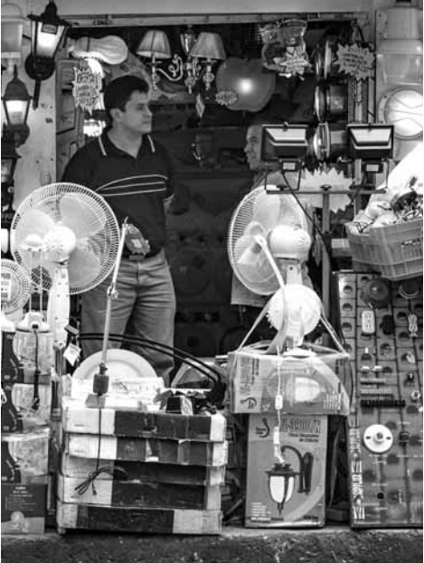
Everything your electrical heart desires in Cuauhtémoc.

And yes, we keep coming back to thoughts of Paris in this city. Because either Mexico City is the Paris of Latin America, or Paris is the Mexico City of France—we don't know or particularly care which. But we can't imagine a greater compliment for either. •