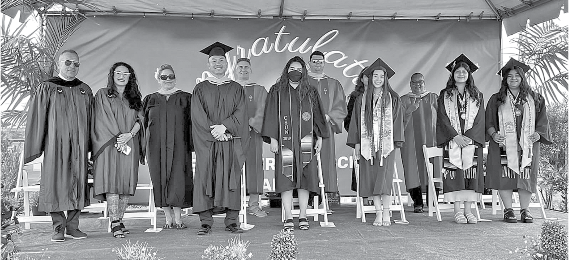
Great job Olympians. We are so proud of all your hard work and dedication. Best of luck in your future endeavors.