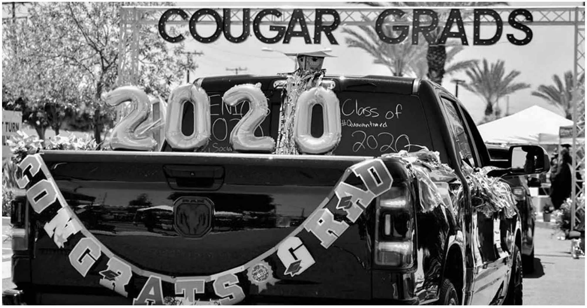
Congratulations Hawthorne High School class of 2020. You will go down in the history books with this one of a kind graduation. It was priceless to see all the smiles and joy in the faces of students and parents. You will be miseed. Go out and be great, you have completed an important milestone.