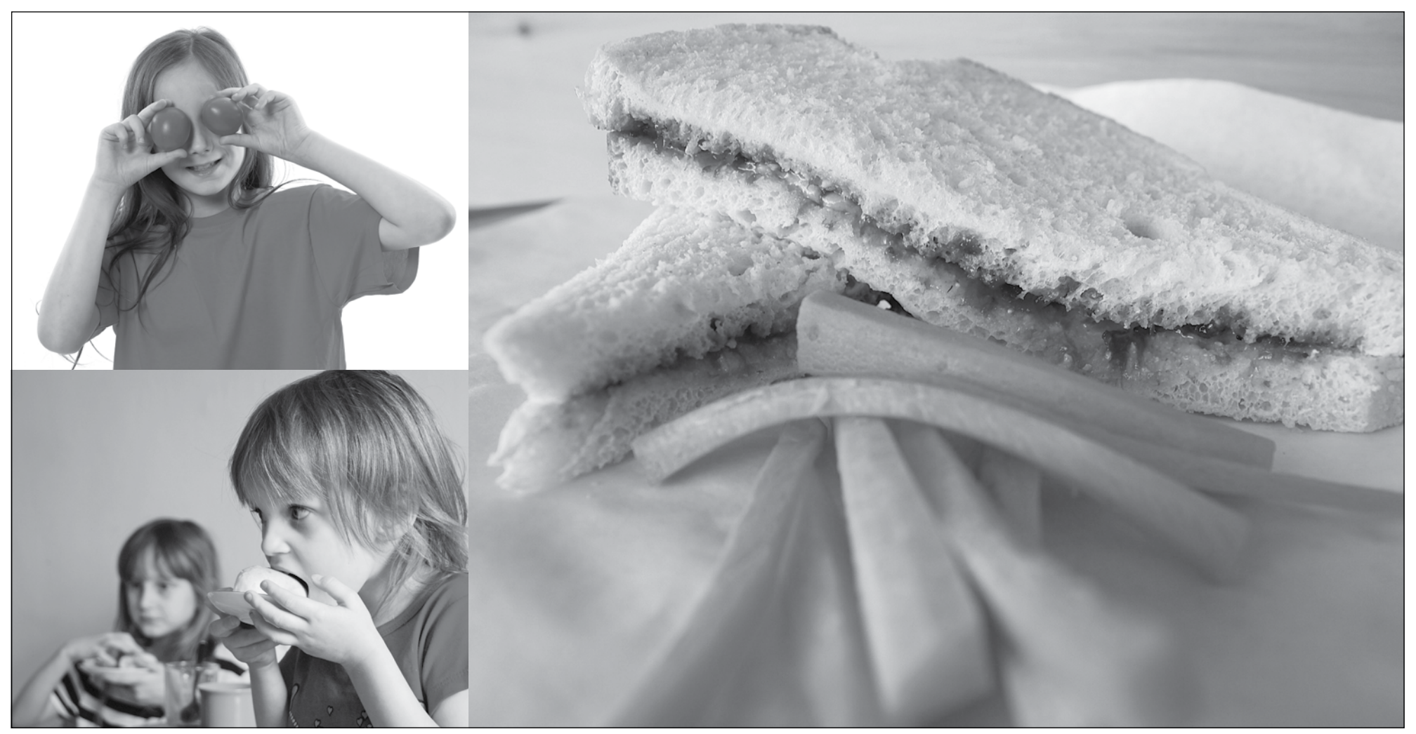
Well fed and well read. Pick up a FREE Lunch at the Lawndale Library and other select Libraries (Ages 18 and under). Lunch is available for no-contact pickup on a first come, first served basis, while supplies last. There are no restrictions on family income. Since 2015, LA County Library has been offering free, nutritious lunches to kids 18 and under with its Lunch at the Library program. It keeps children and teens nourished during the summer months, helping to ensure that kids return to school in the fall ready to learn. DATES: Tuesdays thru Fridays, from June 16 to August 7 (excluding July 3). TIME: 12:00 p.m. to 1:00 p.m. tearn MORE: lacountylibrary.org/SummerLunch.

"One of the greatest feelings in the world is knowing that we as individuals can make a difference. Ending hunger in America is a goal that is literally within our grasp." - JEFF BRIDGES