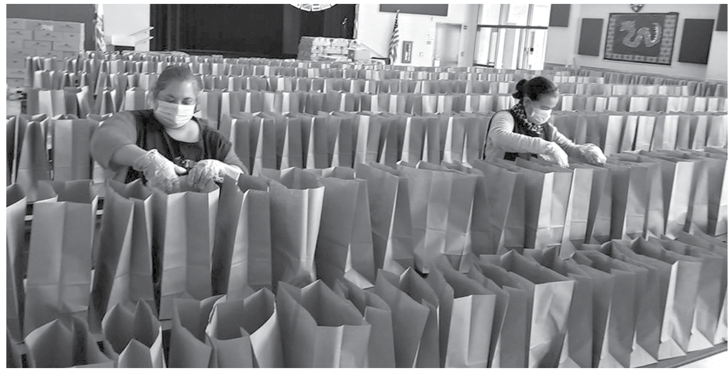
Thank you Hawthorne School District Foodservice Staff for all of your hard work ensuring students receive meals during this time.