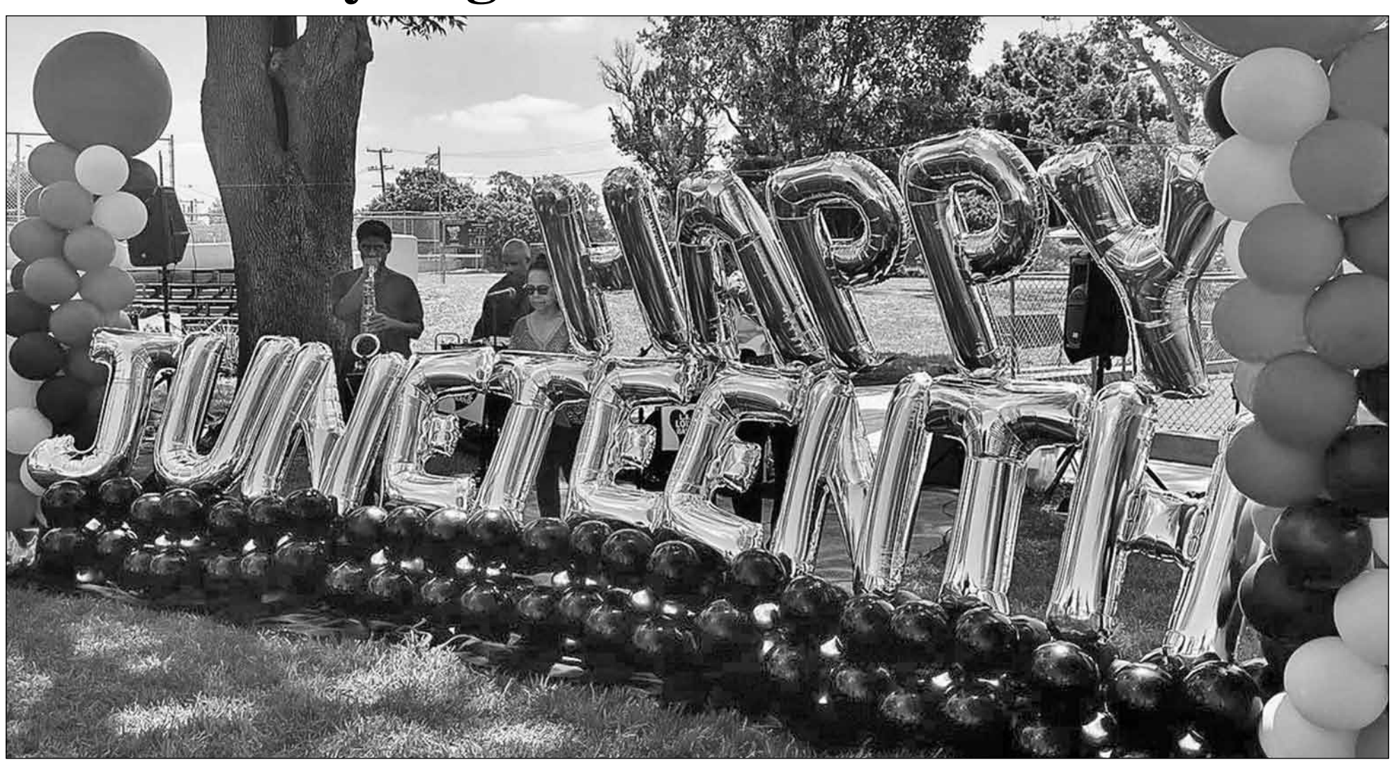
The City of Hawthorne celebrated Juneteenth at Holly Park. It was a day full of live music, great food and fun games.