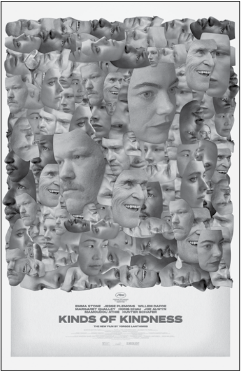
Kinds of Kindness

Despite its weird and oftentimes head-scratching moments, one thing is clear: Kinds of Kindness is made by a man who absolutely loves cinema. Yorgos Lanthimos, director of Academy Award-winning Poor Things , cooks up a smorgasbord of eccentricity and kookiness in his latest work, Kinds of Kindness . It does have a lengthy runtime of 2 hours and 45 minutes but the film surprisingly breezes by with uncompromising energy. Kinds of Kindness is a film you may not completely understand, but it's surely one you will not forget.