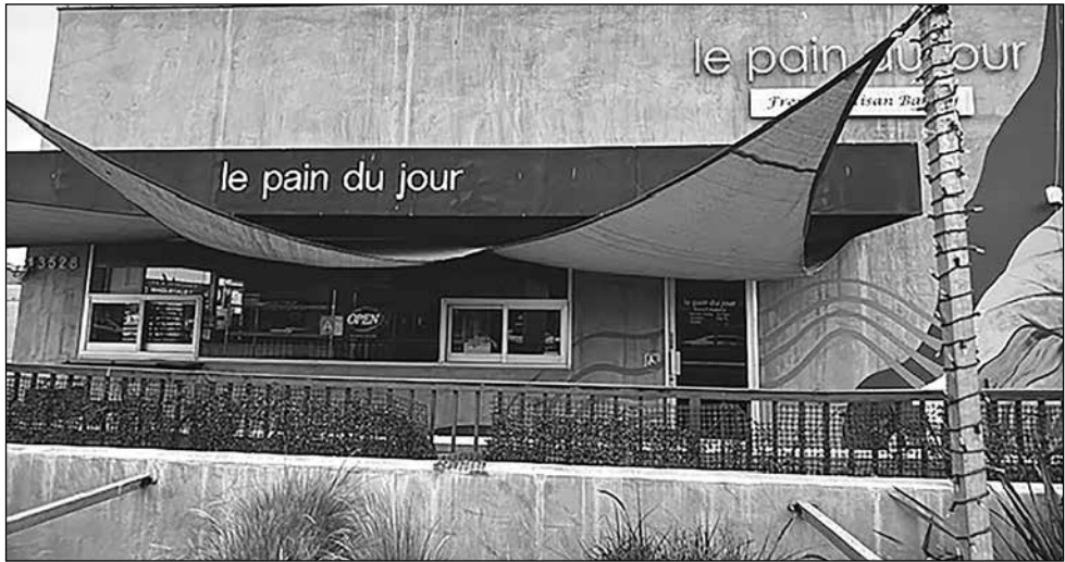
Le Pain Du Jour

Maybe I can convince the powers that be to designate an official Yum Day for the City of Good Neighbors. After all, there are so many choices. I only mention a very few here. Should we make a Yum Award part of Hawthorne’s lore? Did I hear you say, “That’s a yummy idea!”? •