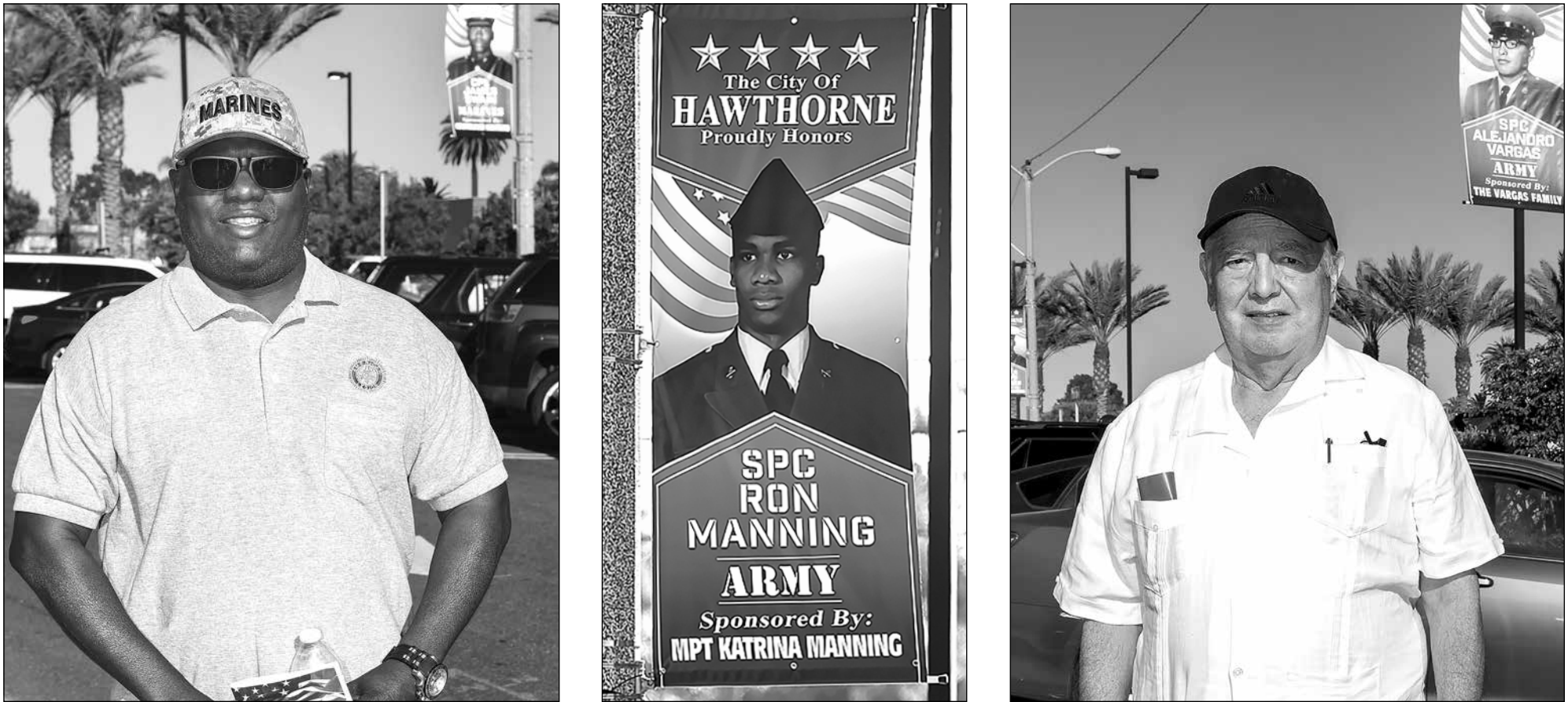
The City of Hawthorne’s Veterans Affairs Commission held an Inaugural Military Banner Recognition Ceremony on Tuesday, June 25th outside of City Hall. The street banner program was created to recognize Hawthorne’s military men & women from the past and present. Sixteen banners were sponsored in this first year and are hanging around the Hawthorne community.