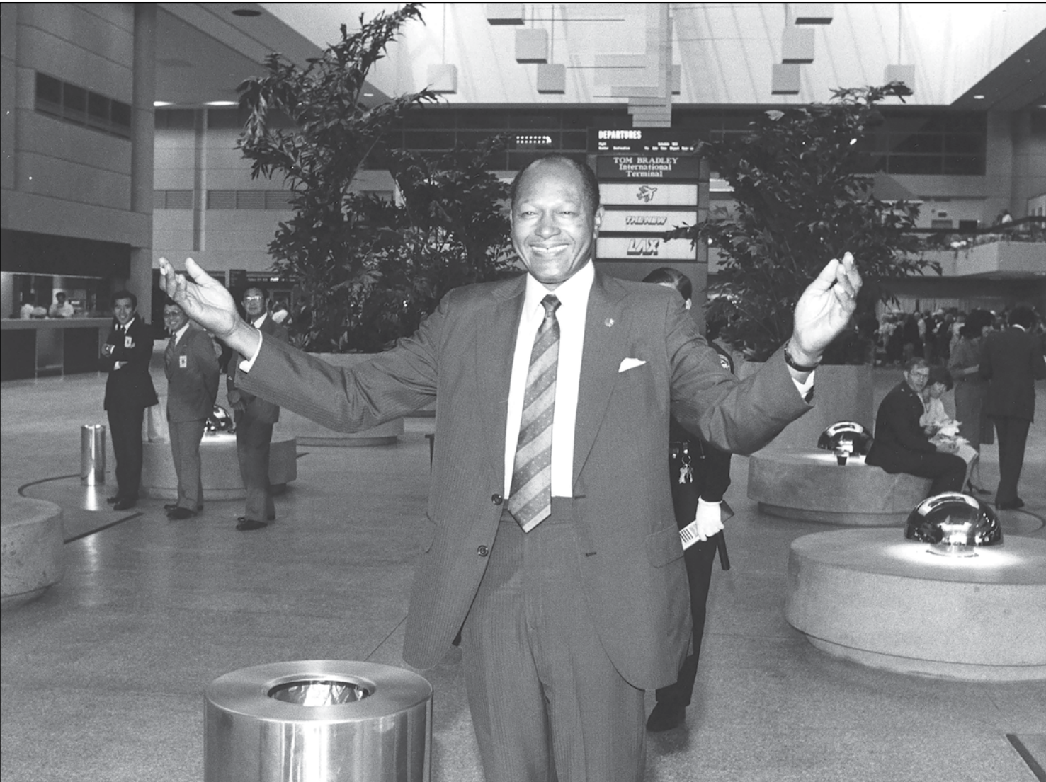
Named after LA's longest-serving mayor and a true champion of our city, the iconic terminal opened its doors to guests on June 18, 1984, in advance of the Summer Olympics. As a global gateway, the terminal has continuously evolved to meet the demands of modern air travel. Over the years, it has seen expansions and upgrades, most recently with the opening of the terminal's new "front door" which represents another step forward in LAWA's mission to enhance guests' experiences and connectivity at LAX. Join us as we celebrate the Tom Bradley International Terminal – a symbol of innovation, connectedness and the spirit of Los Angeles.