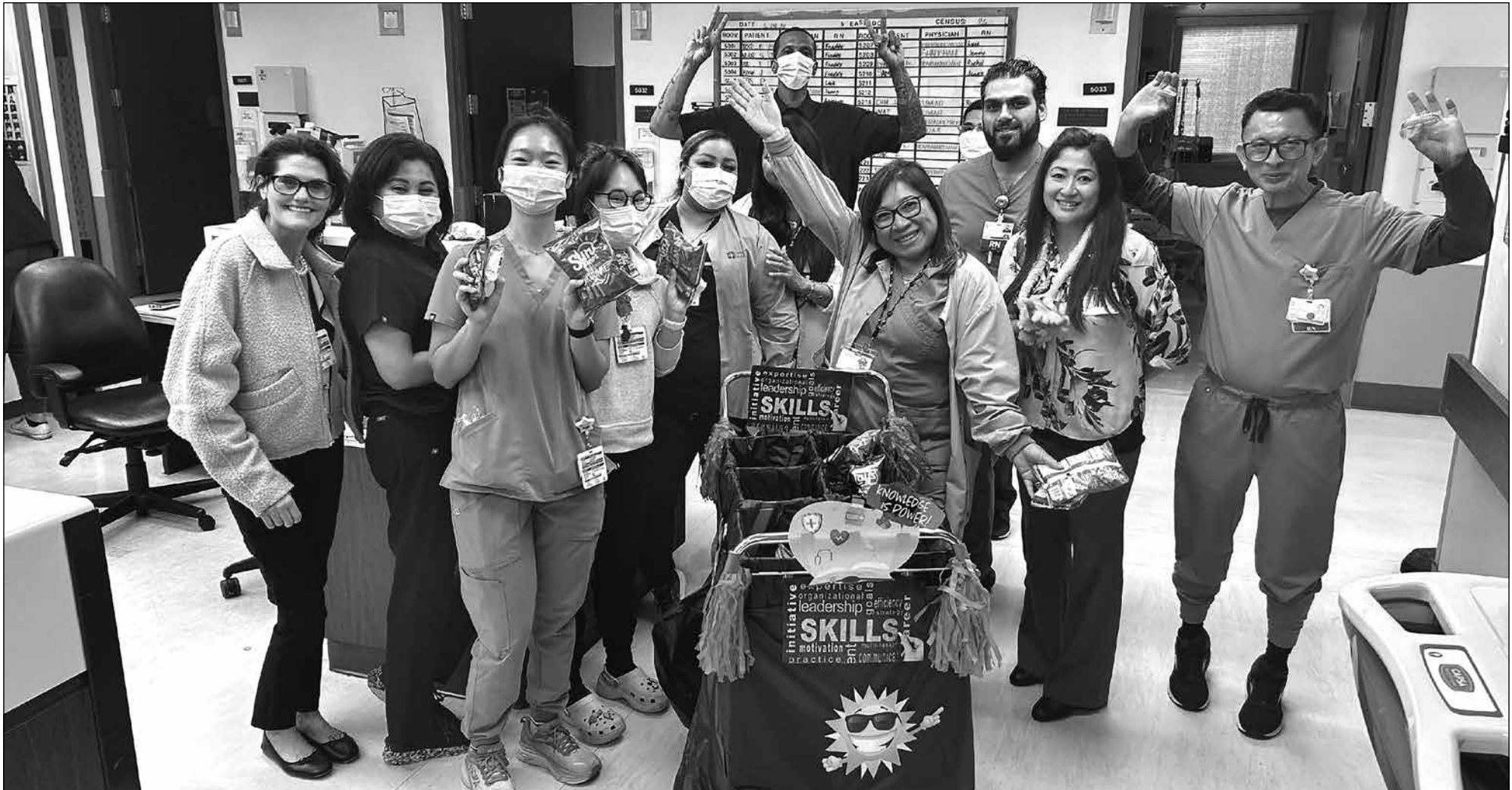
Our outstanding nurses, CNAs, techs and other allied health professionals work hard providing outstanding care to our patients. Members of our Engagement Committee visit one of our nursing units with "The Sunshine Cart" providing a break and distributing snacks. We appreciate all your hard work.