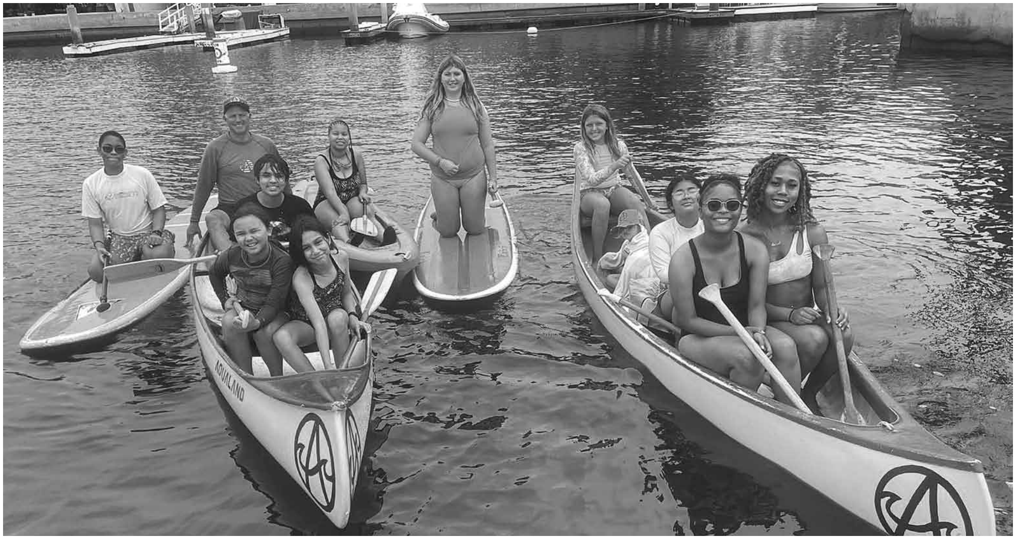
The Power Project Girls had a great time learning paddle boarding and canoeing, from our friends at Aqualand. They made sure everyone was comfortable on the water and had a wonderful experience. Power Project is a youth program out of Hawthorne. It offers mentorship and new experiences like Aqualand.