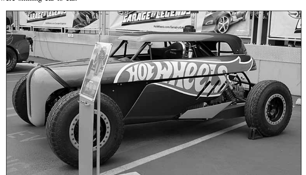
A beautiful Hot Wheels™ hotrod.