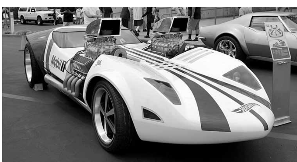
Another live-sized Hot Wheel was a crowd pleaser.