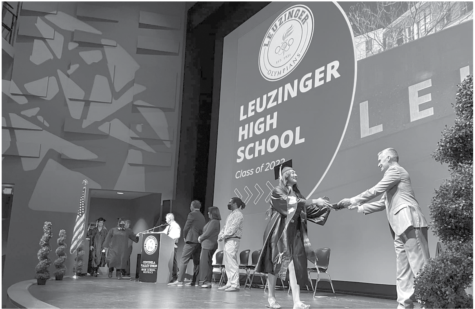
Congratulations Hawthorne High School, Lawndale High School, Leuzinger High School and Lloyde High School summer school graduates. You did it. We are so proud of you for buckling down and getting it done. Go out there and do GREAT things.