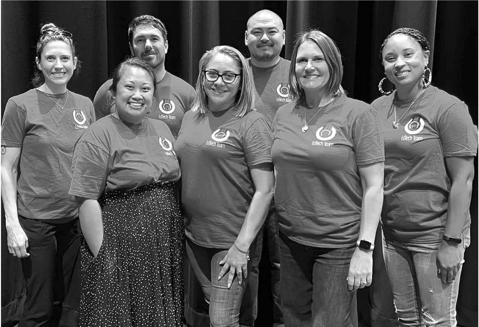
Thank you to our Ed Tech Team who presented to new teachers at our CVUHSD New Hire Summer Institute. Great job making sure everyone is technologically ready to start school on August 15th.