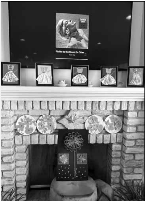
Artwork on the fireplace mantel with everyone's favorite actress Doris Day on the tv.