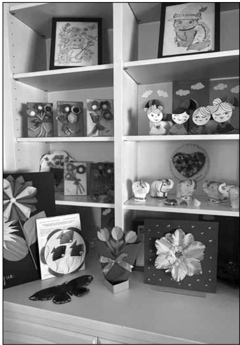
Colorful artwork fills the shelves.