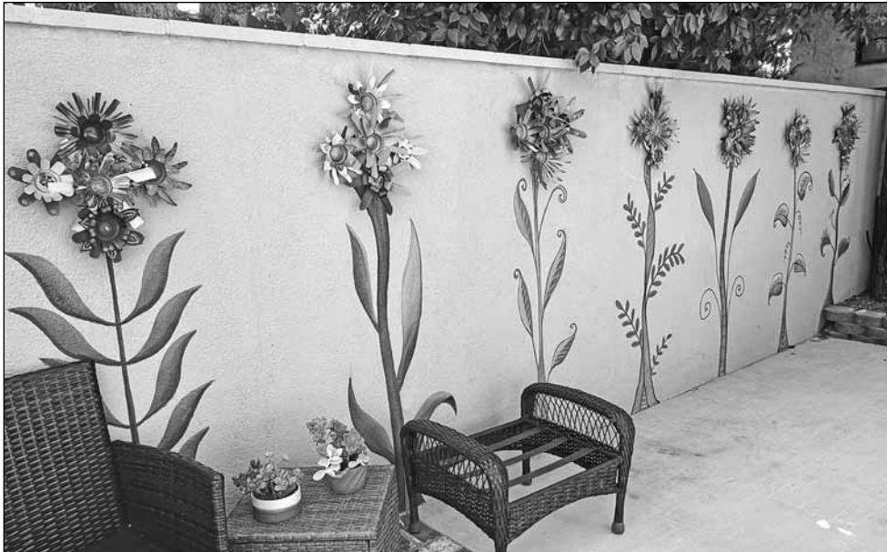
A row of tin petaled flowers welcome you in.