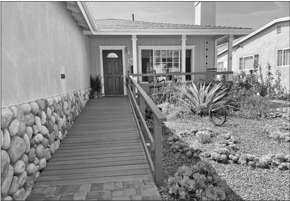
Welcoming stairway to the house.